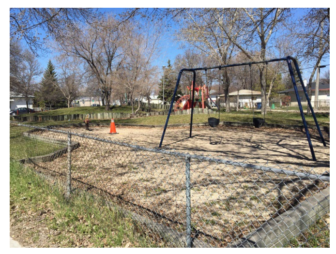
Existing Blue Bird Park structures

Blue Bird Park was last redeveloped in 1999, therefore the park is due for an update. With the open greenspace at Lismore Park right beside it, this is a good time to think of the two greenspaces together and come up with ideas for what is needed in the community and the best way to address it in the available park spaces. Since the nearby play equipment at Bannatyne Playground has reached the end of its useful life and it is located less than a five minute walk from Blue Bird and Lismore parks, the play structure there will be removed. The intent is to focus resources on a new playground at the larger, more central site at Blue Bird and Lismore parks.