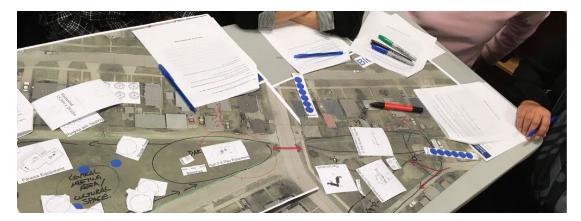
Figure 1 - Group mapping at the public workshop

Workshop participants were divided into four groups and worked through a number of exercises to help in visioning the types of improvements they would like to see in the parks. After placing various amenities on the maps provided, participants were asked to highlight their top priorities. Following group mapping, each participant was given five stickers to place on the final maps to 'upvote' the amenities they would most like to see in either park. A number of trends were evident in the final maps, as described below.