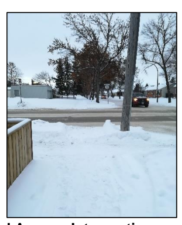
Photo 2: North side of McGregor Street and Hartford Avenue Intersection