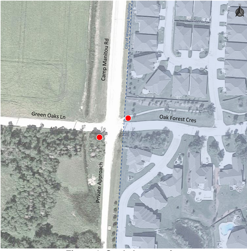
Figure 1: Study Intersection

To the west, Green Oaks Lane provides access to rural properties in the RM of Headingley including Camp Manitou and terminates as a dead-end roadway. Camp Manitou is a 28-acre summer camp and year-round outdoor recreation facility along the Assiniboine River. Amenities at the facility include a gym, heated outdoor pool, cabins and a skating rink. A new lodge with dining facility is currently under construction and slated to open in the summer of 2020.