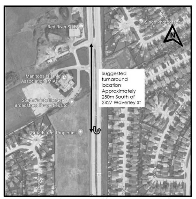
Figure 3 - Proposed turnaround location on Waverley Street

This alternative would allow eastbound motorists to focus on one stream of traffic at a time instead of trying to find a gap in both directions of traffic. A suitable location for such a turnaround could be investigated at a point approximately 250 metres south of 2427 Waverley Street as shown in Figure 3.