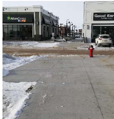
Figure 2: Images of the Private Walkway (North Alignment)