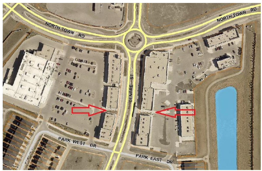
Figure 1: Study Area