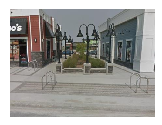
Building Gap Looking West from Centre Street