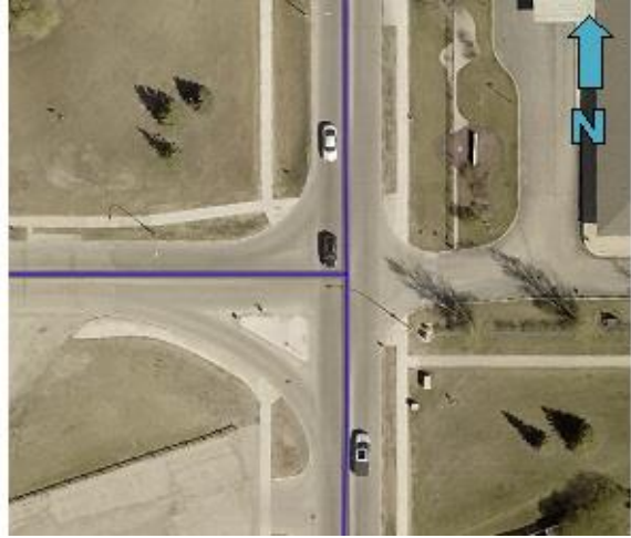
Figure 3: Lakewood Boulevard and Willowlake Crescent – Before, 2016 (left); After, 2018 (right)

The improvements to Lakewood Boulevard and Willowlake Crescent completed in 2016 have improved pedestrian safety therefore no additional modifications to this intersection are recommended at this time.