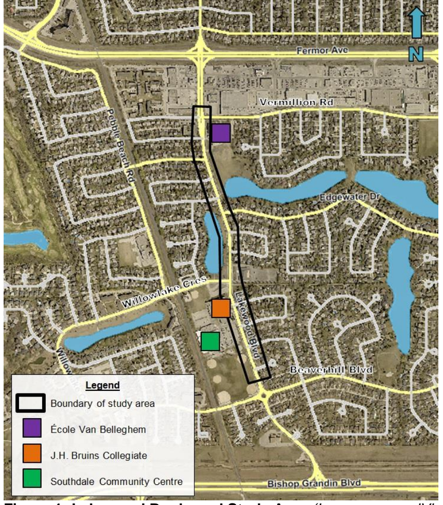
Figure 1: Lakewood Boulevard Study Area

Lakewood Boulevard is a two-lane undivided street in the St. Boniface Ward. The speed limit is 50 km/h and the average weekday traffic volumes are between 10,000 and 12,000 vehicles per day, which is characteristic of a major residential collector street. Lakewood Boulevard is the main north-south connection for the community of Southdale and intersects with Fermor Avenue to the north, and Bishop Grandin Boulevard to the south. Sidewalks are provided on either side of Lakewood Boulevard. There are all-way stop controlled intersections at Lakewood Boulevard and Vermillion Road/Weatherstone Place, Edgewater Drive, and Willowlake Crescent, and a roundabout at the intersection with Beaverhill Boulevard.