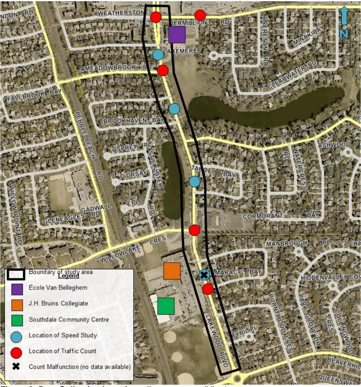
Figure 2: Data Collection Locations

Traffic volumes and/or speeds were collected at nine locations on Lakewood Boulevard in November 2018. Site visits were conducted and meetings were held with the administration at both schools to discuss the study and understand their traffic concerns.