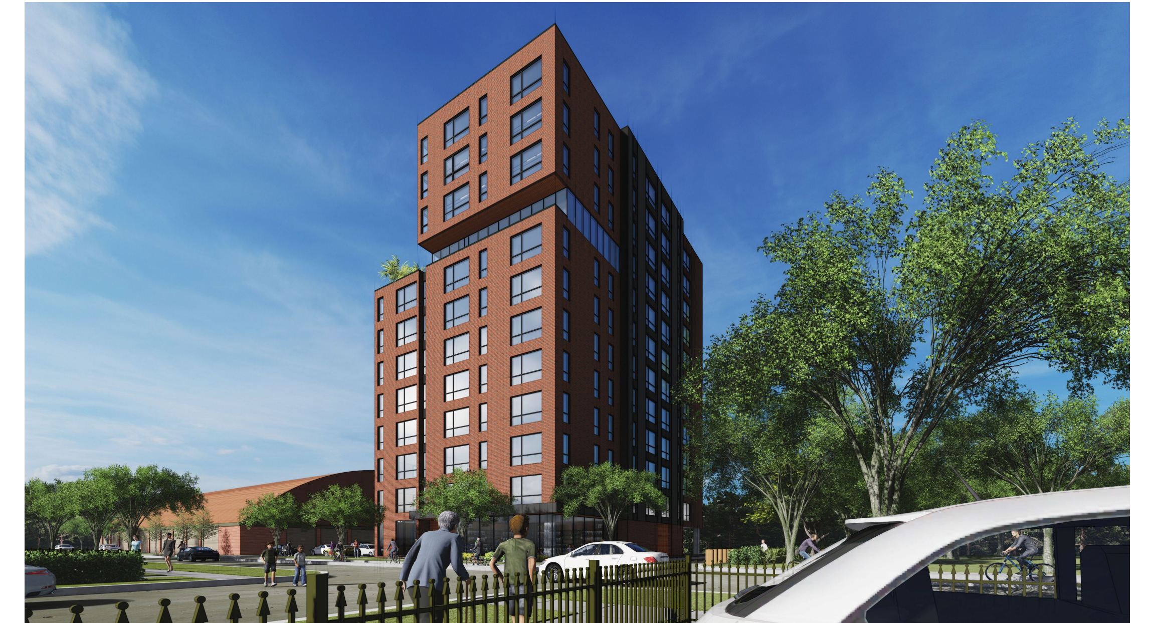
Proposed Riverside Commons building