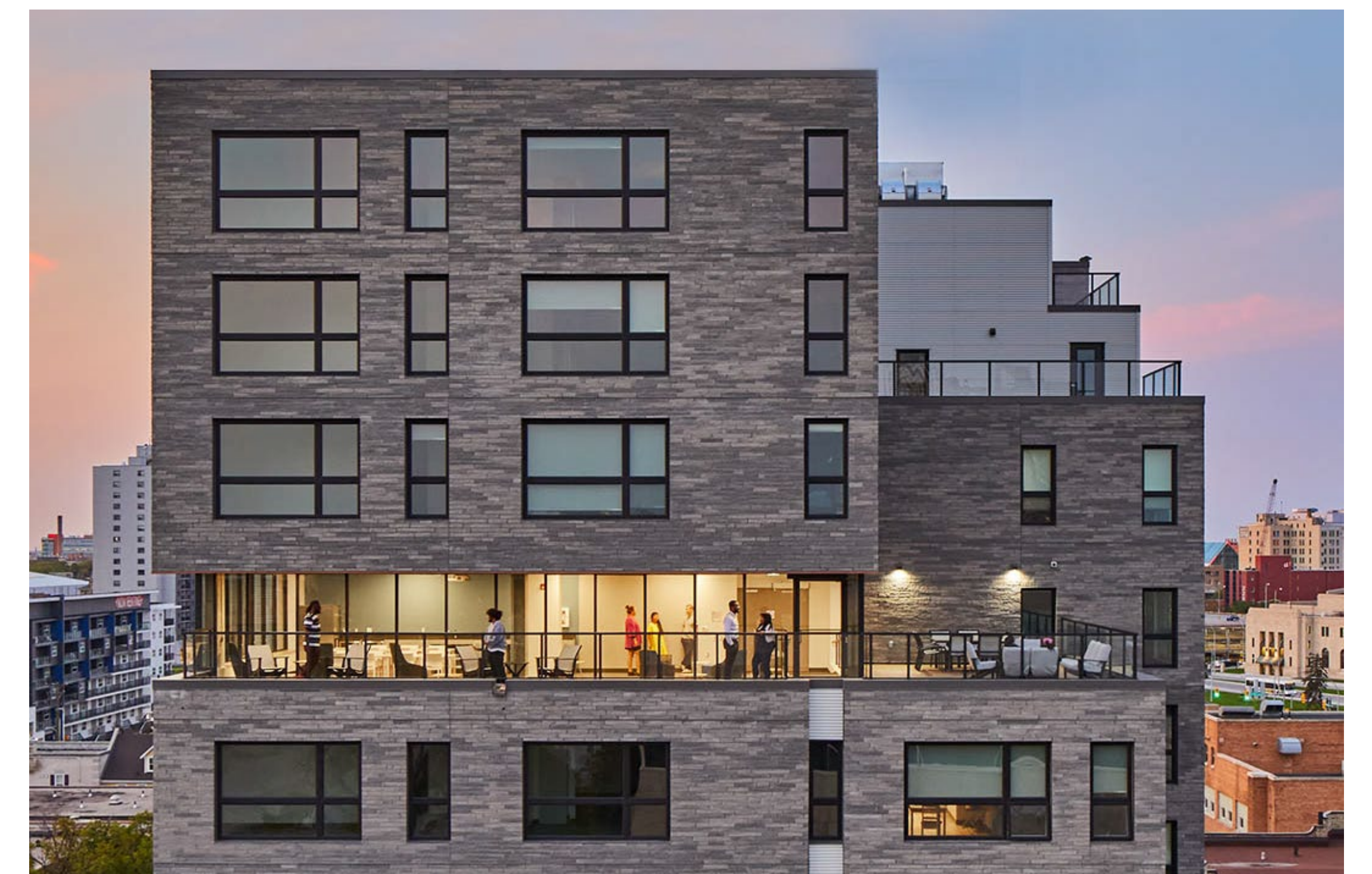
Broadway Commons, 175 Colony Street, similar design