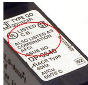
Sample labels on combination-type AFCI breakers

The above requirements are applicable to all new installations.