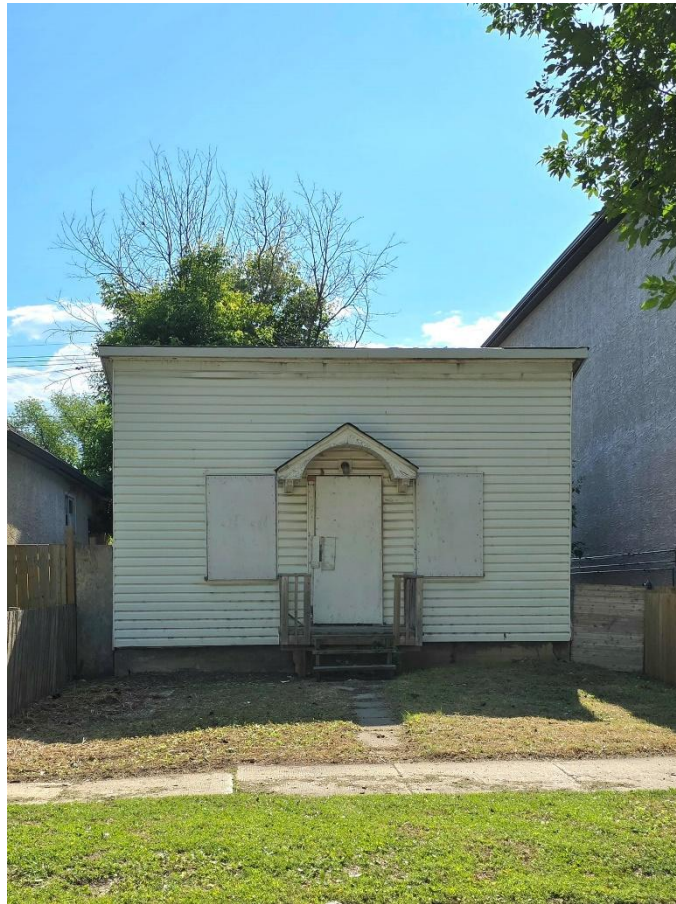
Front View – 25 ft frontage