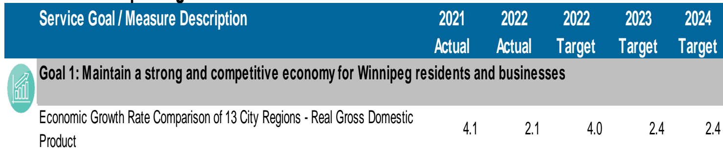
Economic Growth Comparison of 13 City Regions - Real Gross Domestic Product (%)