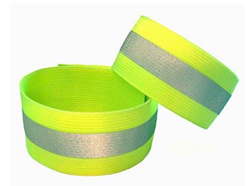
Example of ankle band meeting retroreflective standard