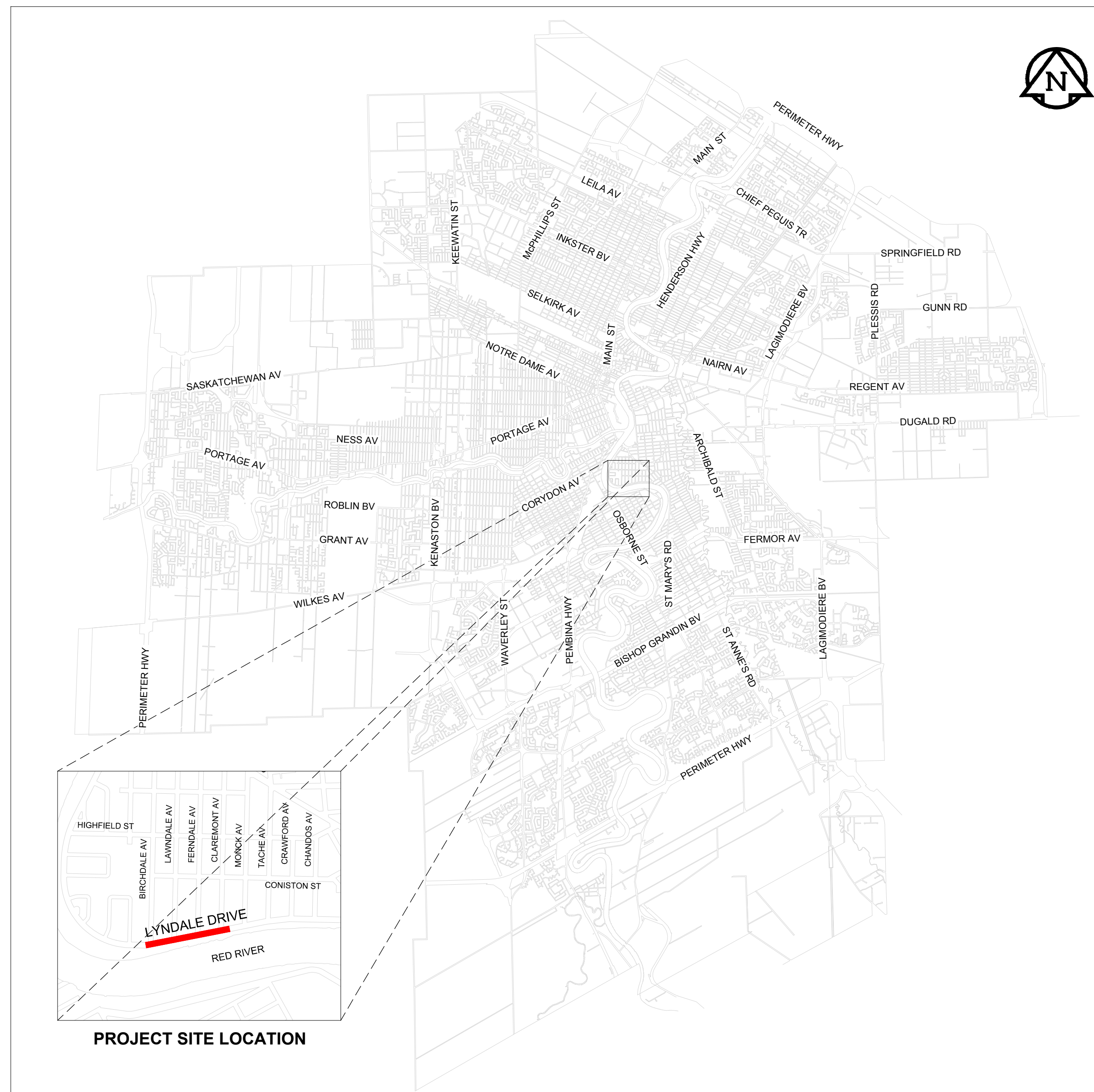
PROJECT SITE LOCATION

BID OPPORTUNITY No. 779-2020 ISSUED FOR TENDER