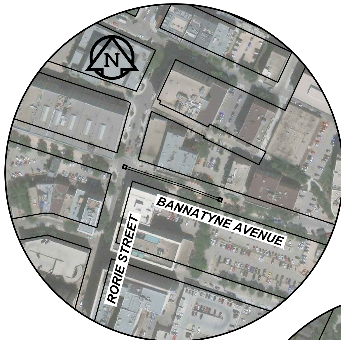
SITE 1 12592 | BANNATYNE AVENUE