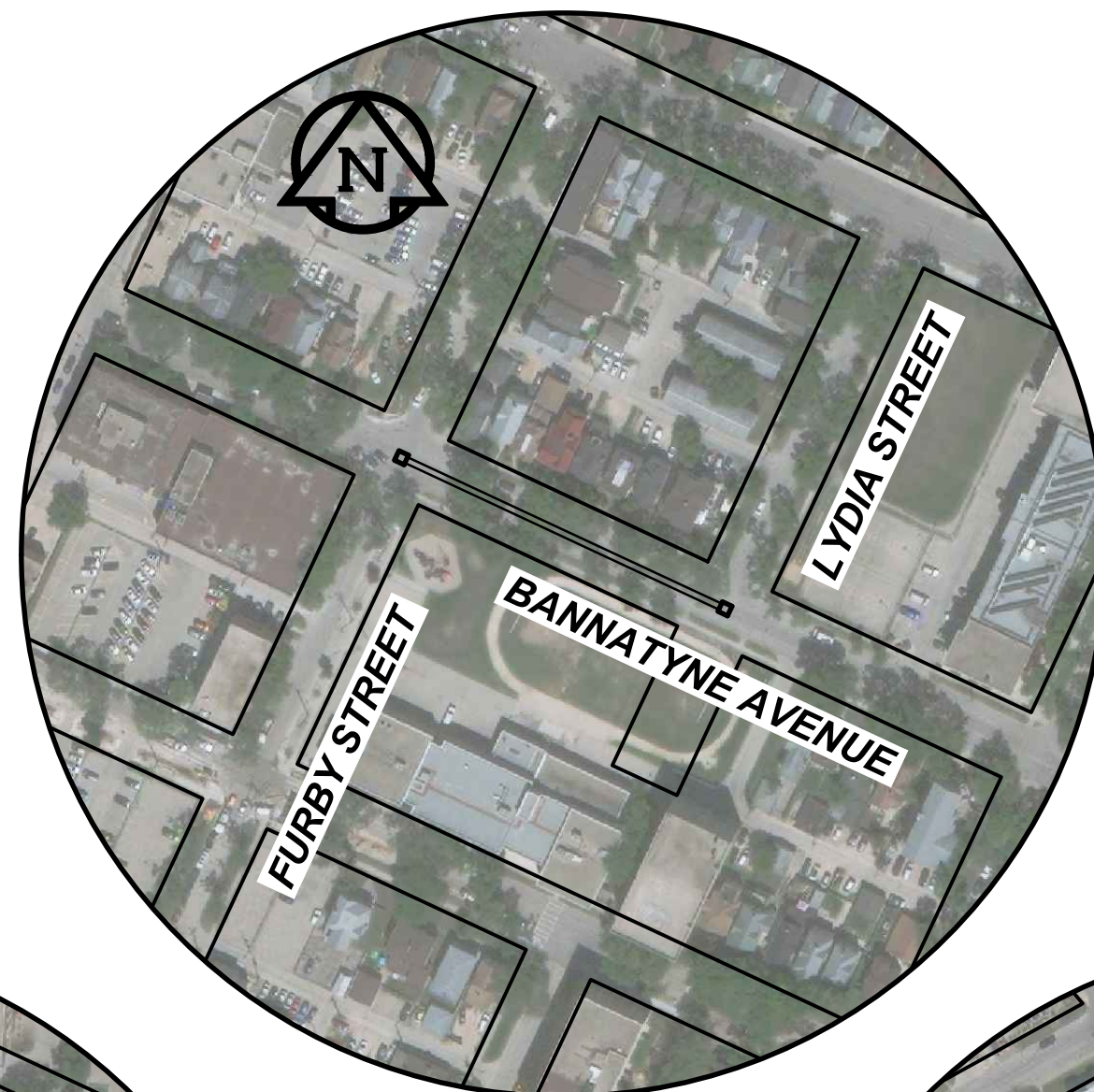
SITE 2 12593 | BANNATYNE AVENUE