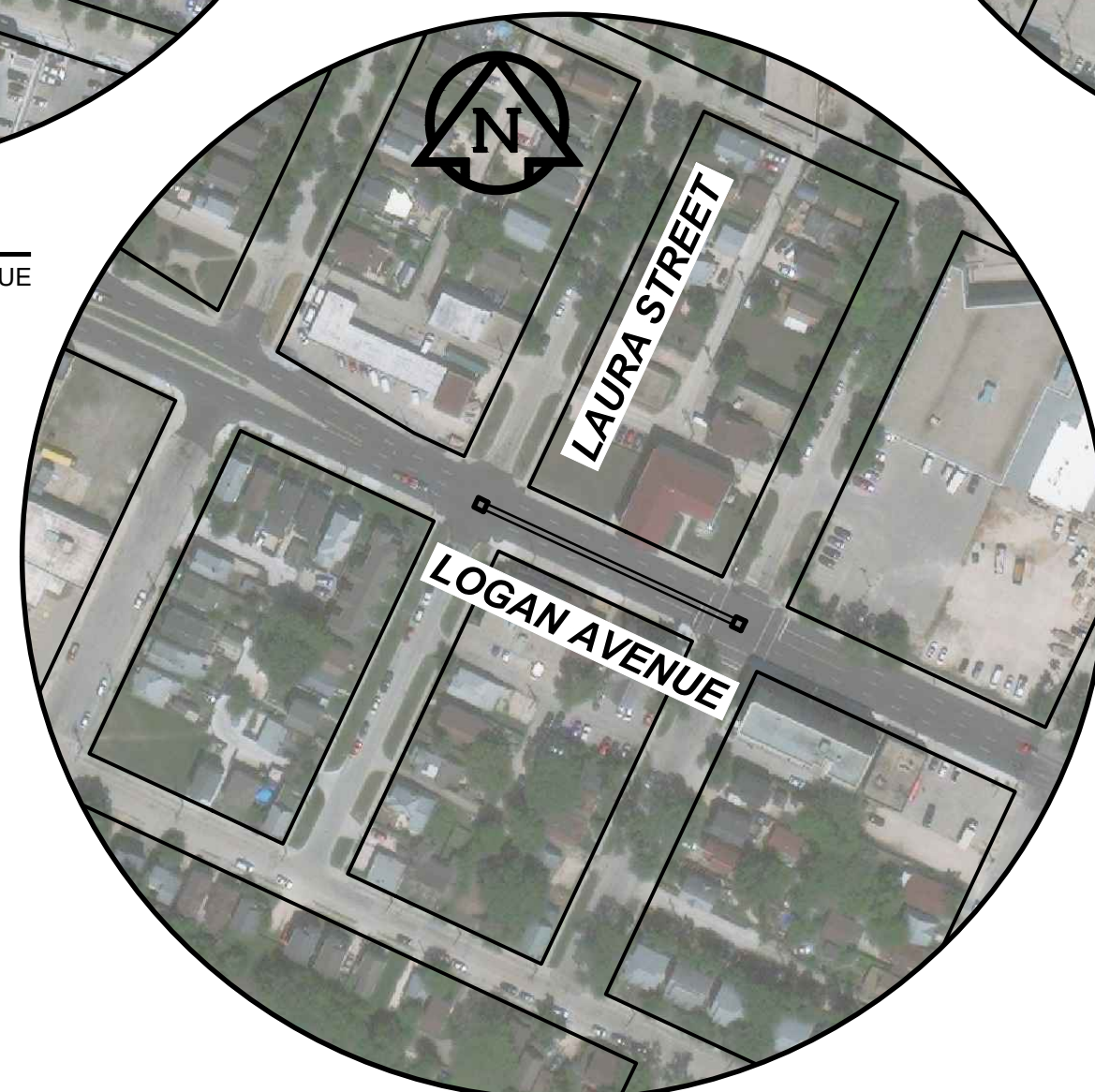
SITE 3 12594 | LOGAN AVENUE