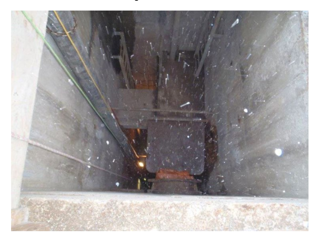
West Side - Existing tunnel shaft