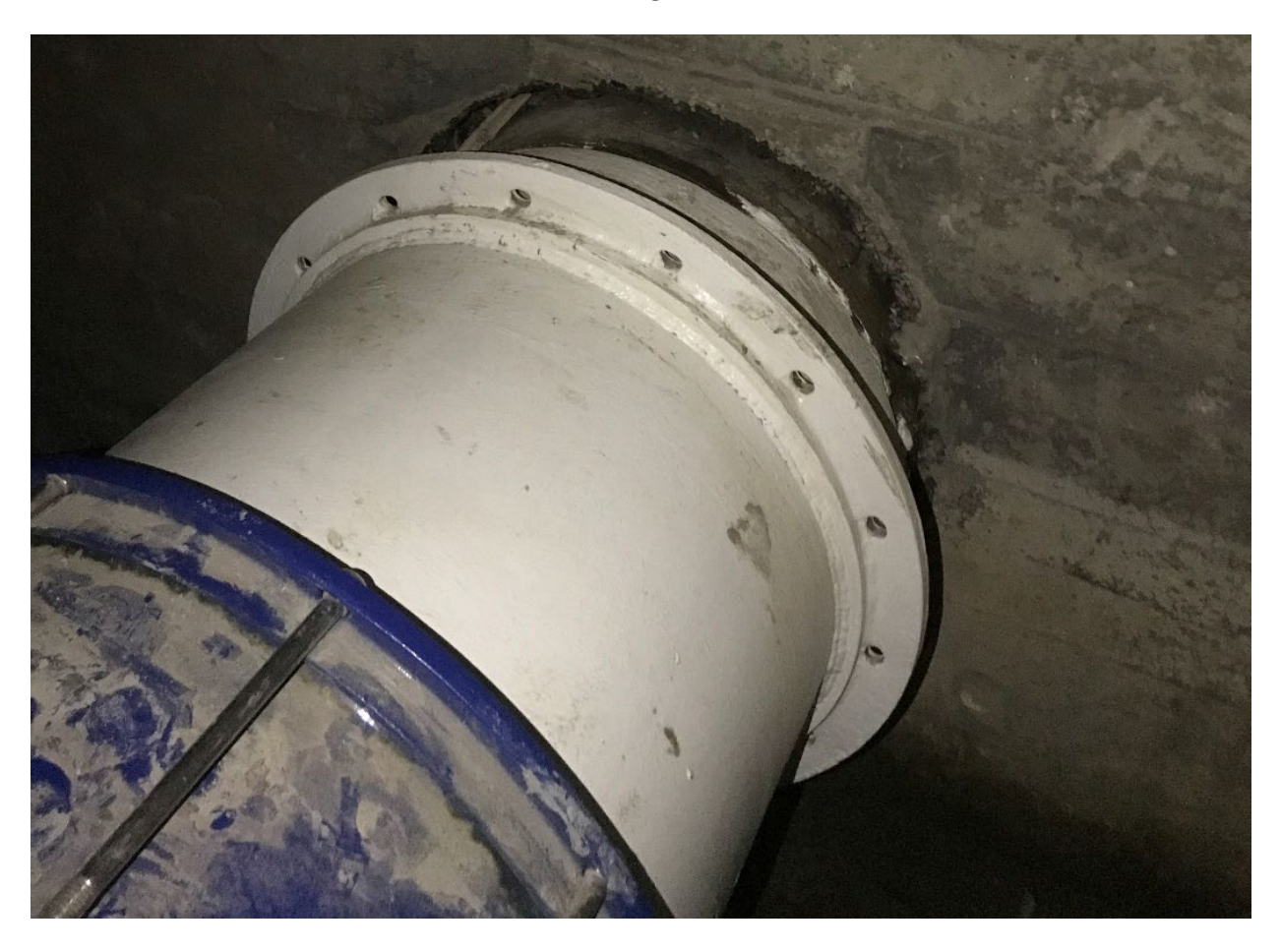
East Side – Existing valve chamber - 600 feeder main (exterior)