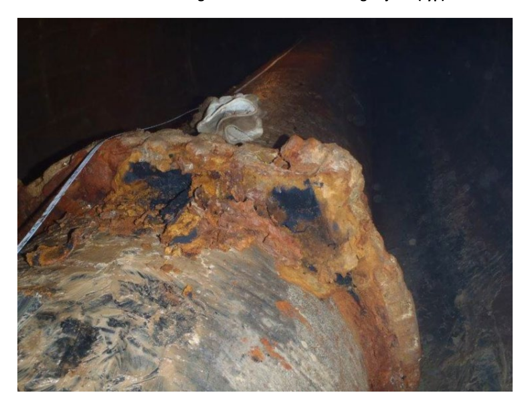
West Side – Existing 600 mm feeder main Victaulic joint (typ)