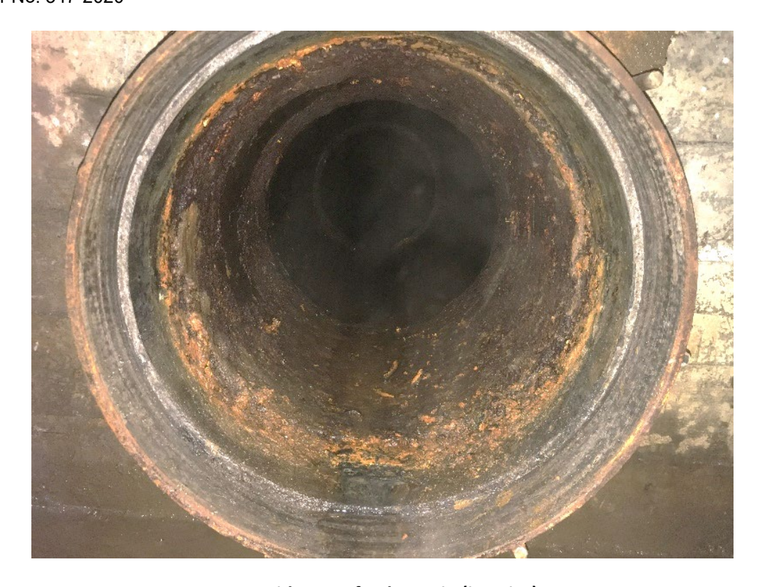
East Side - 600 feeder main (interior)