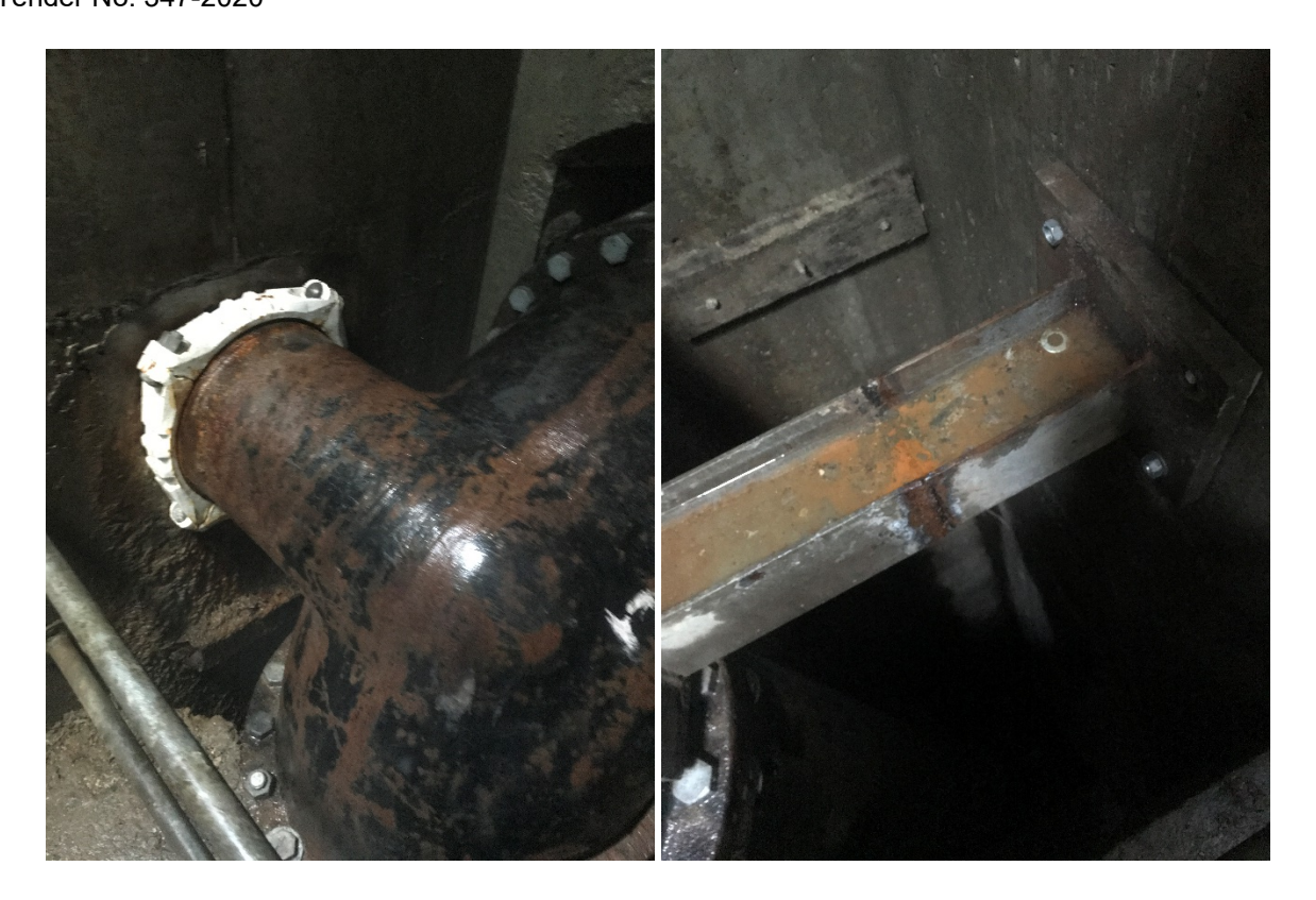
West Side – Existing tunnel shaft - Side-outlet elbow