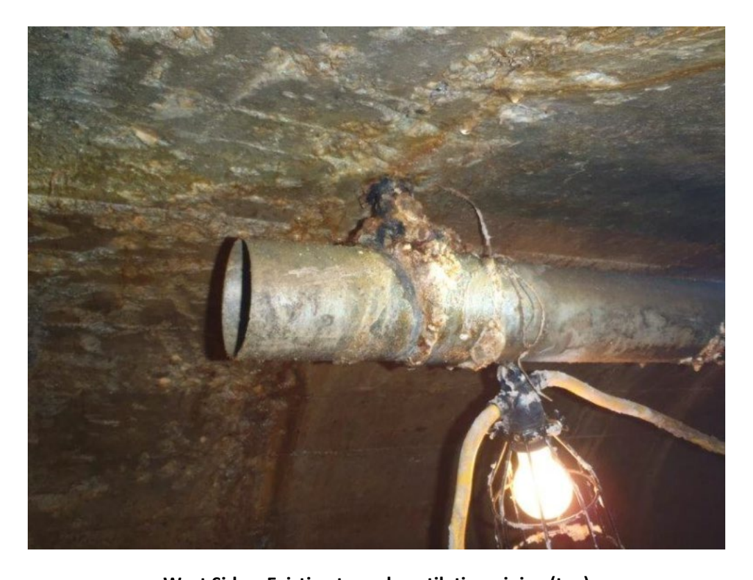
West Side – Existing tunnel ventilation piping (typ)