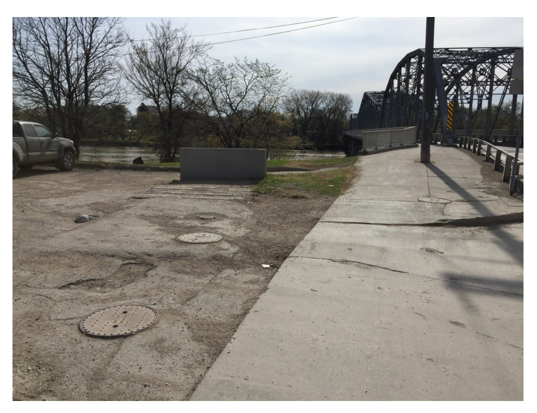
West Side – Existing tunnel shaft and valve chambers