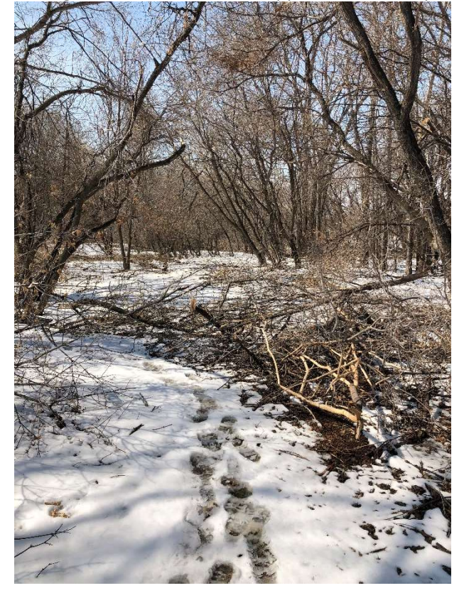
Photo 5 – Looking West from Mid-Bank (Approx. on CL of Pipe Alignment)