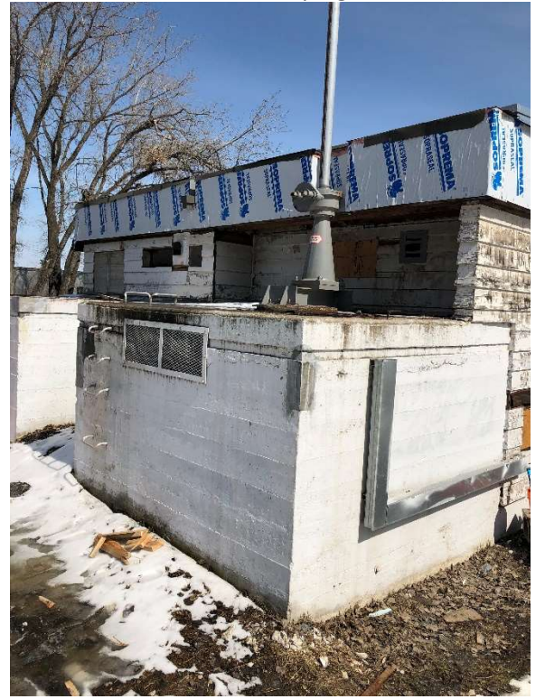
Photo 4 – Looking West from Mission Flood Pumping Station (Approx. on CL of Pipe Alignment)

Photo 3 – Looking North at Mission Flood Pumping Station (Access Chamber to Outfall)