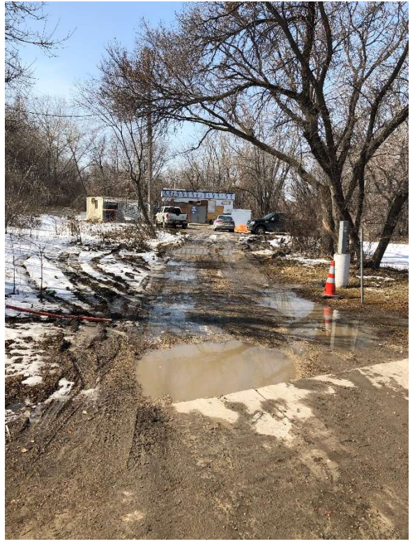
Photo 2 – Looking East from upper bank towards Mission Flood Pumping Station

Photo 1 - Looking West from Archibald Street towards Mission Flood Pumping Station