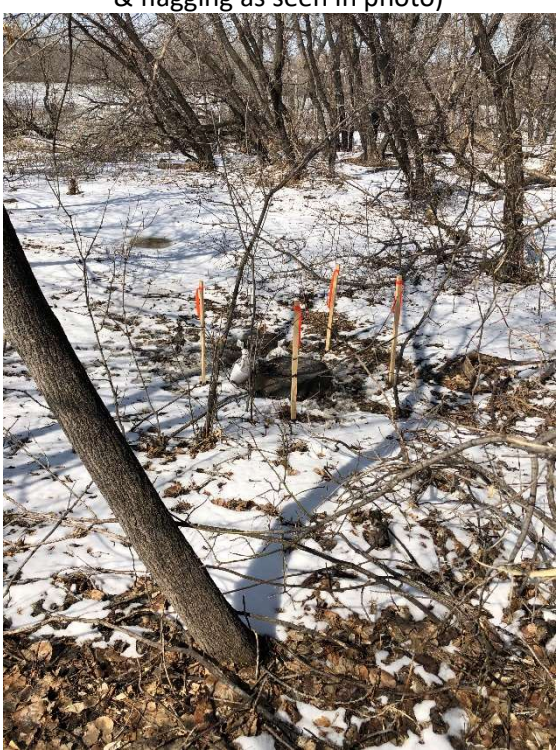
Photo 8 – Looking South East at Intermediate Manhole (Location has been marked in field with stakes & flagging as seen in photo)

Photo 7 – Looking North West at Intermediate Manhole (Location has been marked in field with stakes & flagging as seen in photo)