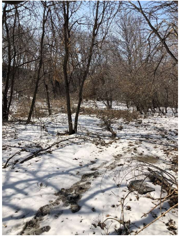
Photo 6 – Looking West towards Seine River (relative proximity to pipe alignment)