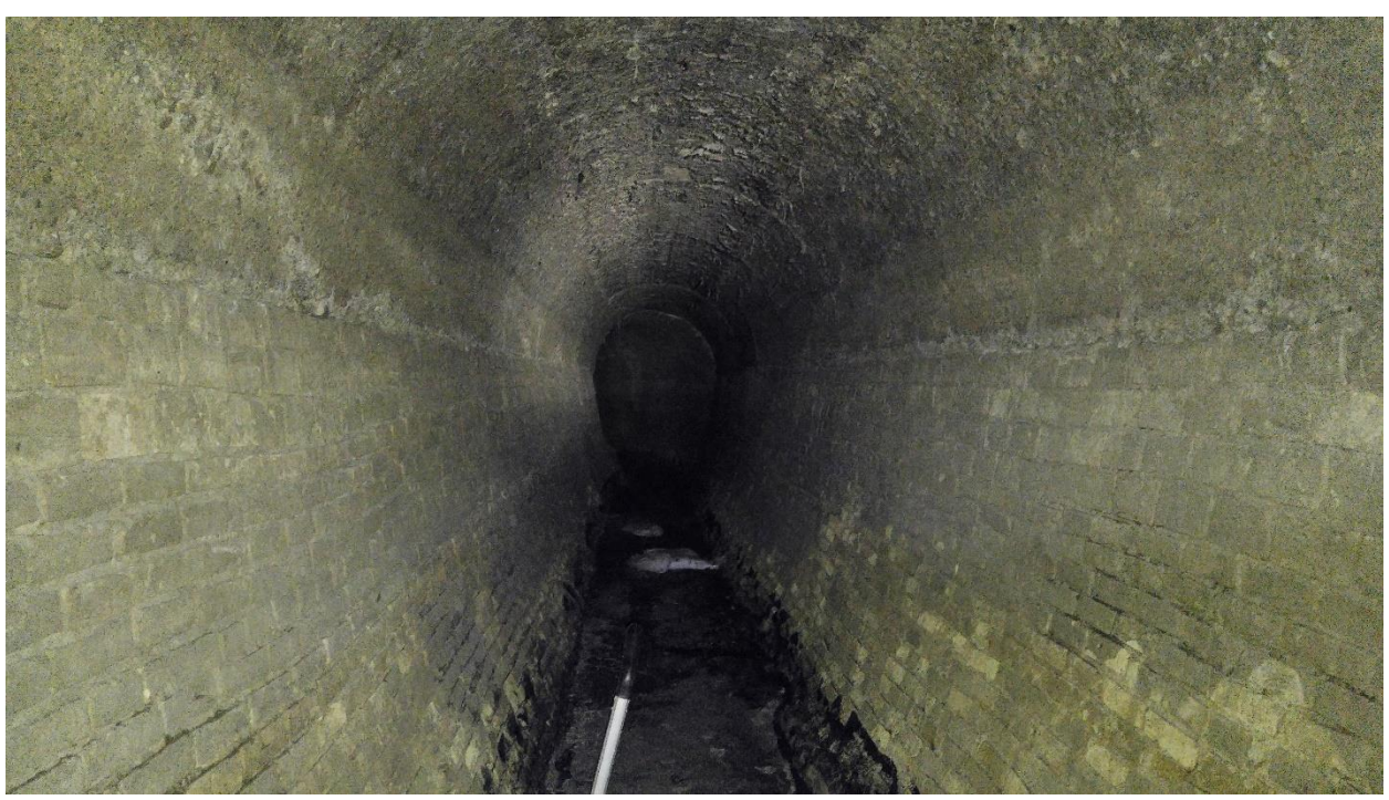
Approx. Sta. 1+45 (Looking Upstream)