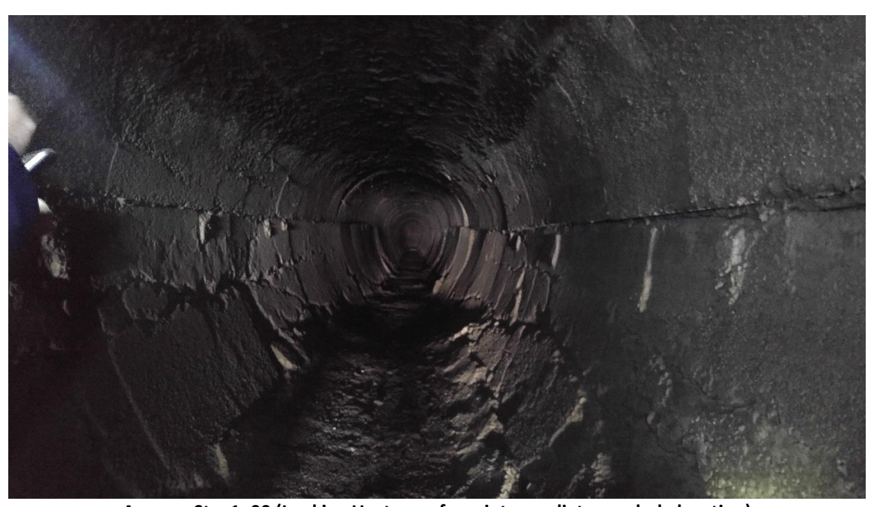
Approx. Sta. 1+00 (Looking Upstream from intermediate manhole location)