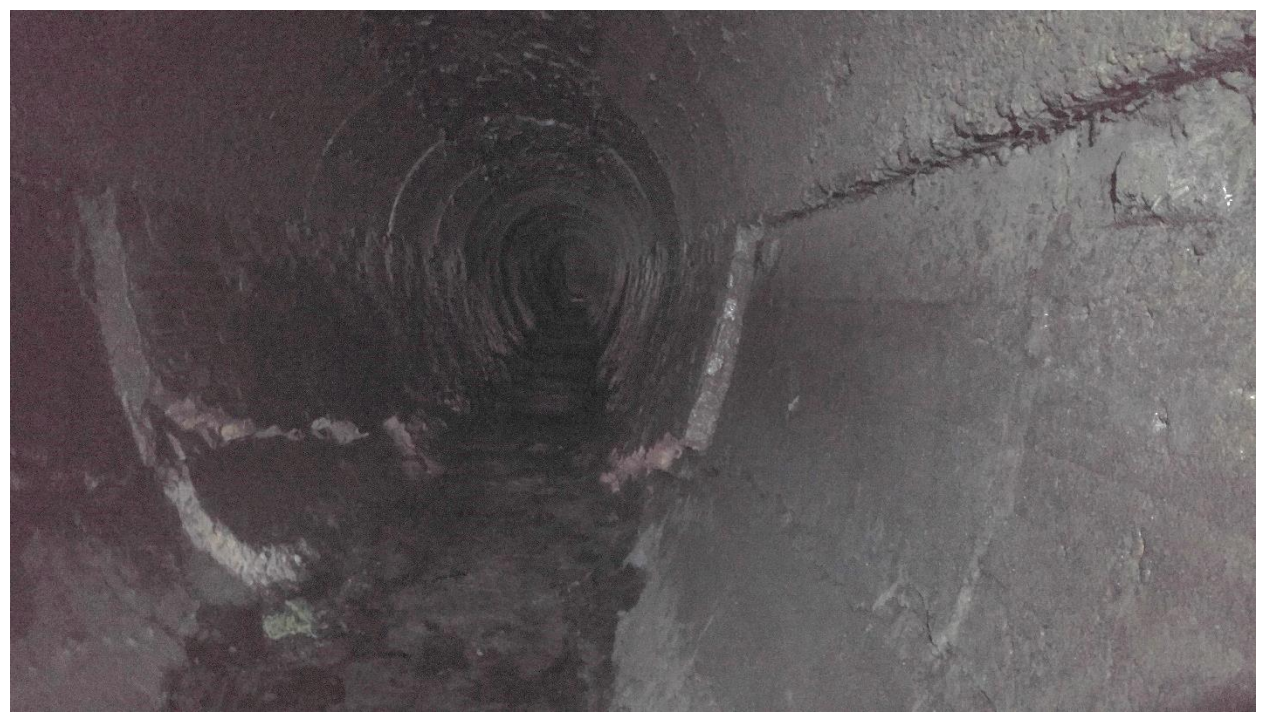
Approx. Sta. 1+07 (Looking Upstream)