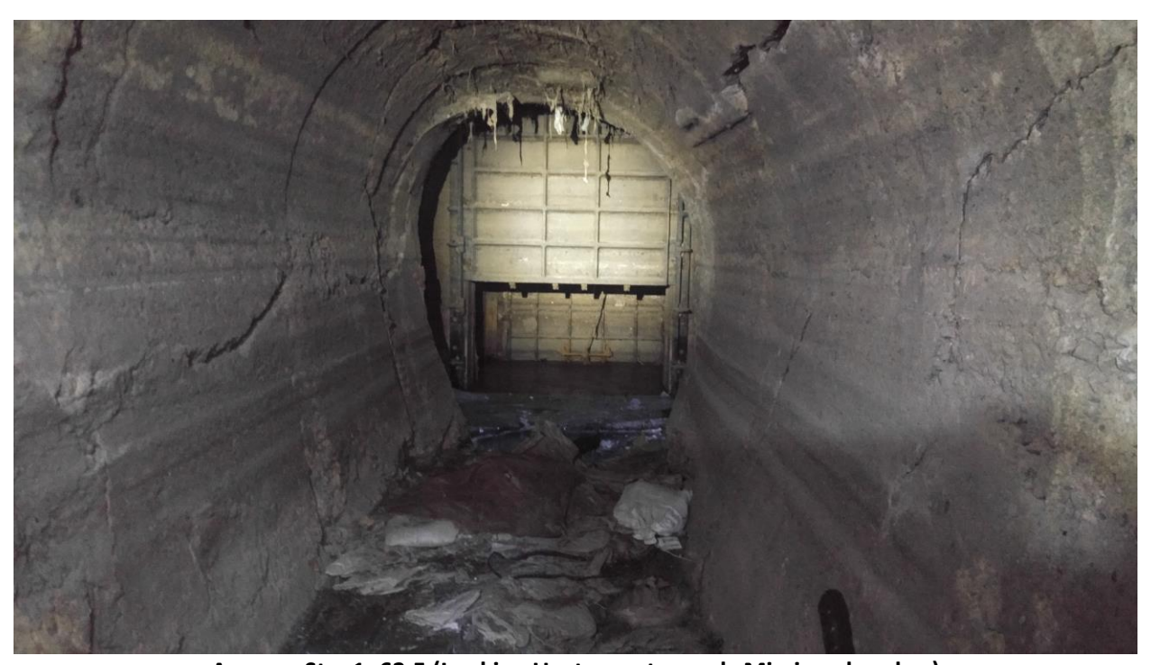
Approx. Sta. 1+63.5 (Looking Upstream towards Mission chamber)