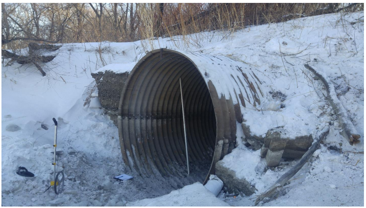
Archibald Outfall – Outlet at Seine River (February 2018)