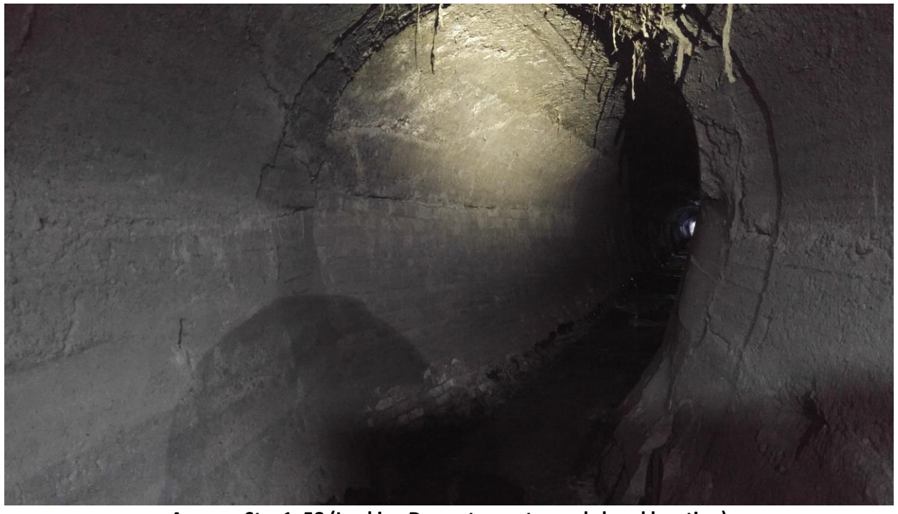
Approx. Sta. 1+58 (Looking Downstream towards bend location)