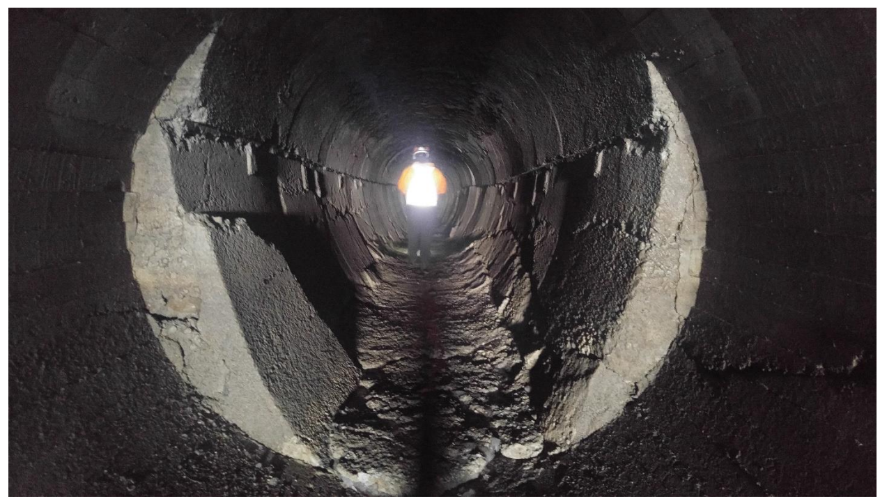
Approx. Sta. 0+88 (Looking Upstream)