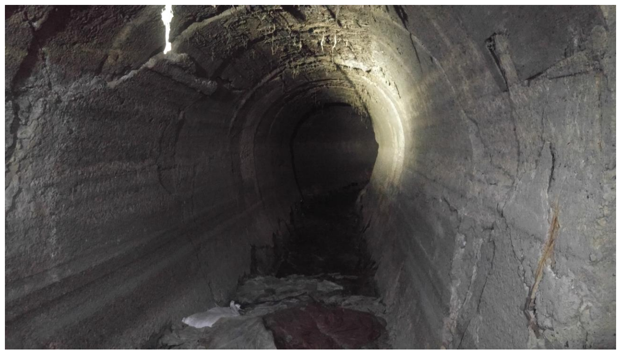
Approx. Sta. 1+64 (Looking Downstream towards bend location)