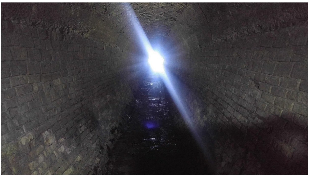
Approx. Sta. 1+45 (Looking Downstream)