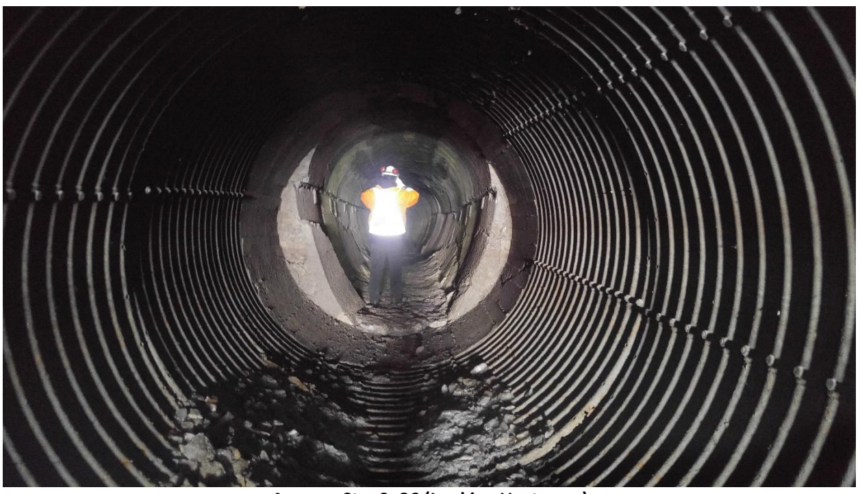
Approx. Sta. 0+86 (Looking Upstream)