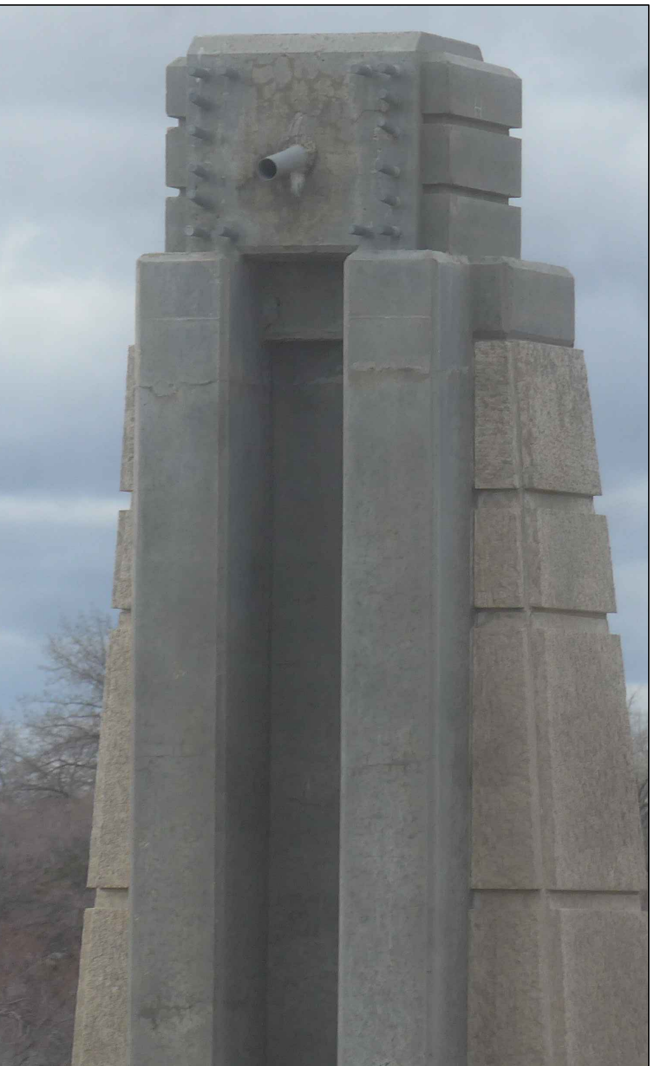
EXISTING SOUTHBOUND OVERHEAD SIGN STRUCTURE