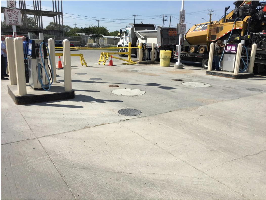
Photograph 1. Refueling Area ↑