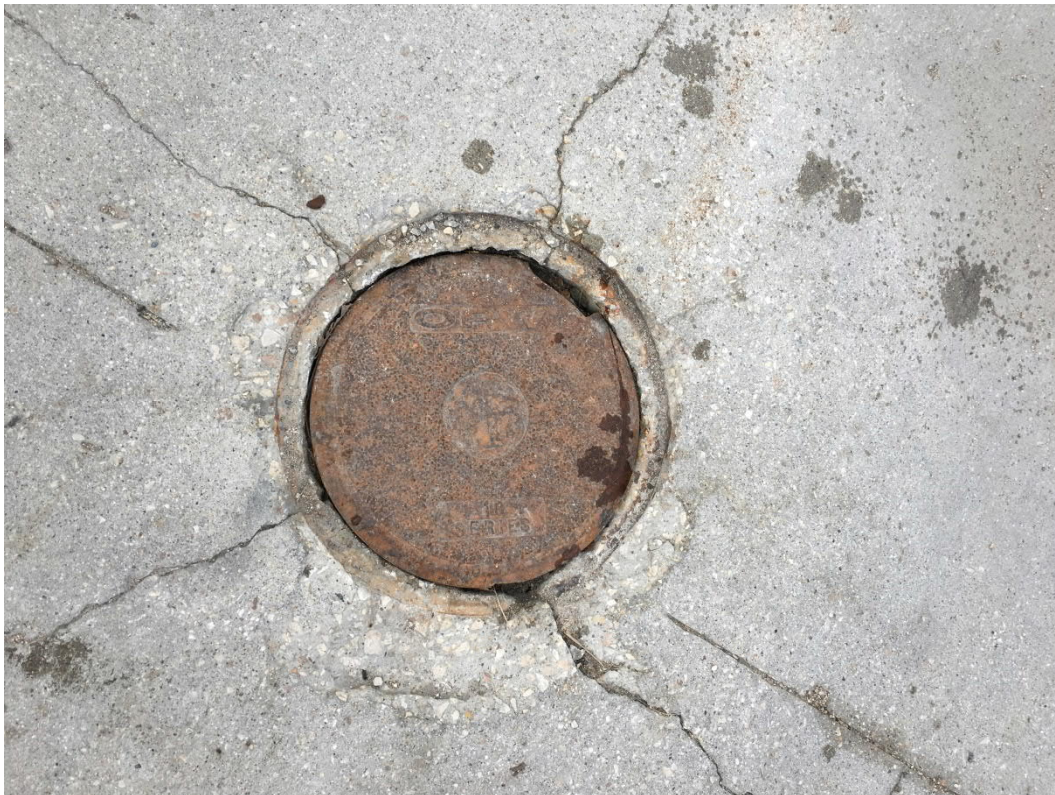
Photograph 2. Damaged Spill Containment Manhole ↑