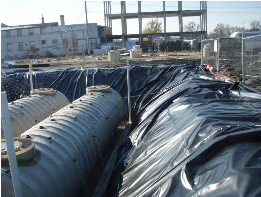
Photograph 6. Installation of Underground Storage Tank & Liner ↑