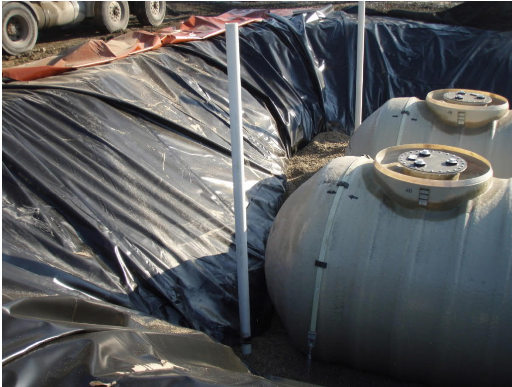
Photograph 7. Installation of Underground Storage Tank & Liner ↑