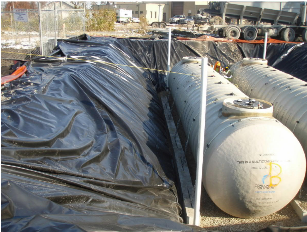
Photograph 4. Installation of Underground Storage Tank & Liner ↑