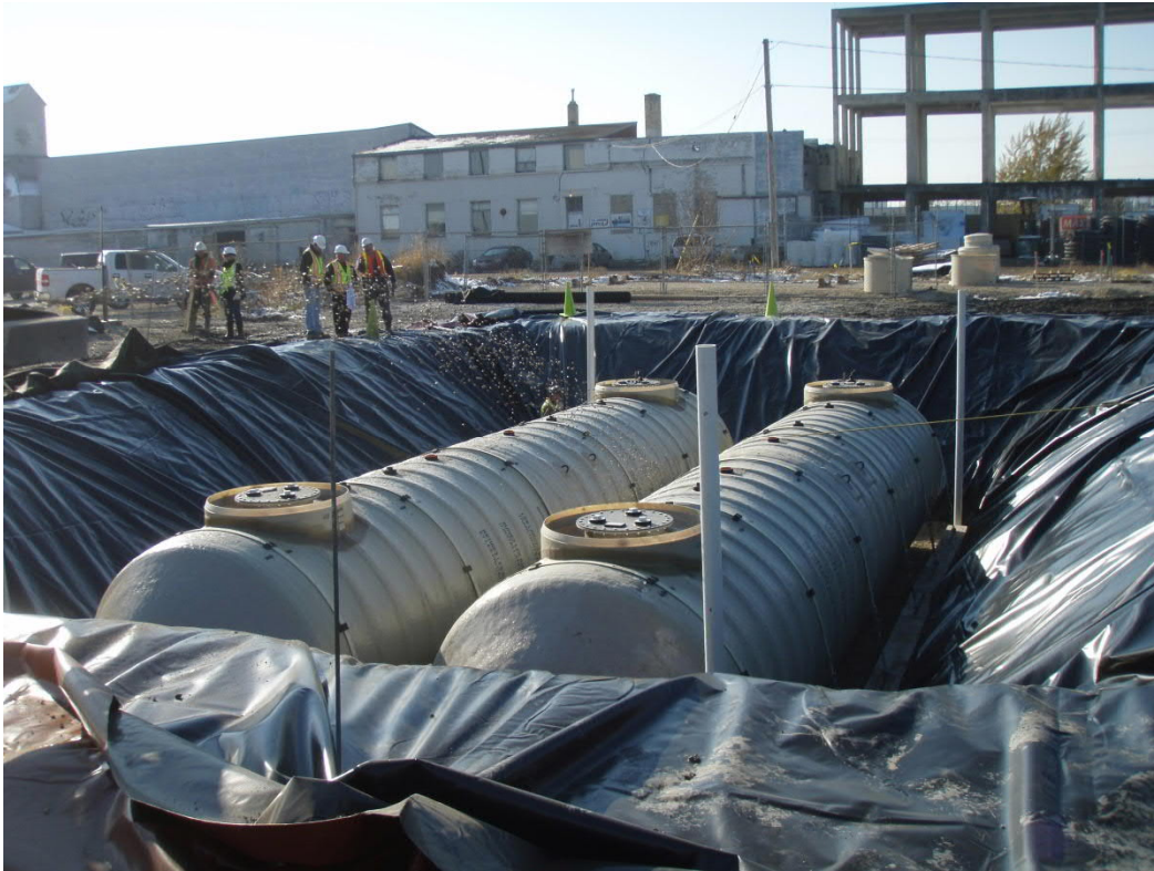
Photograph 5. Installation of Underground Storage Tank & Liner ↑