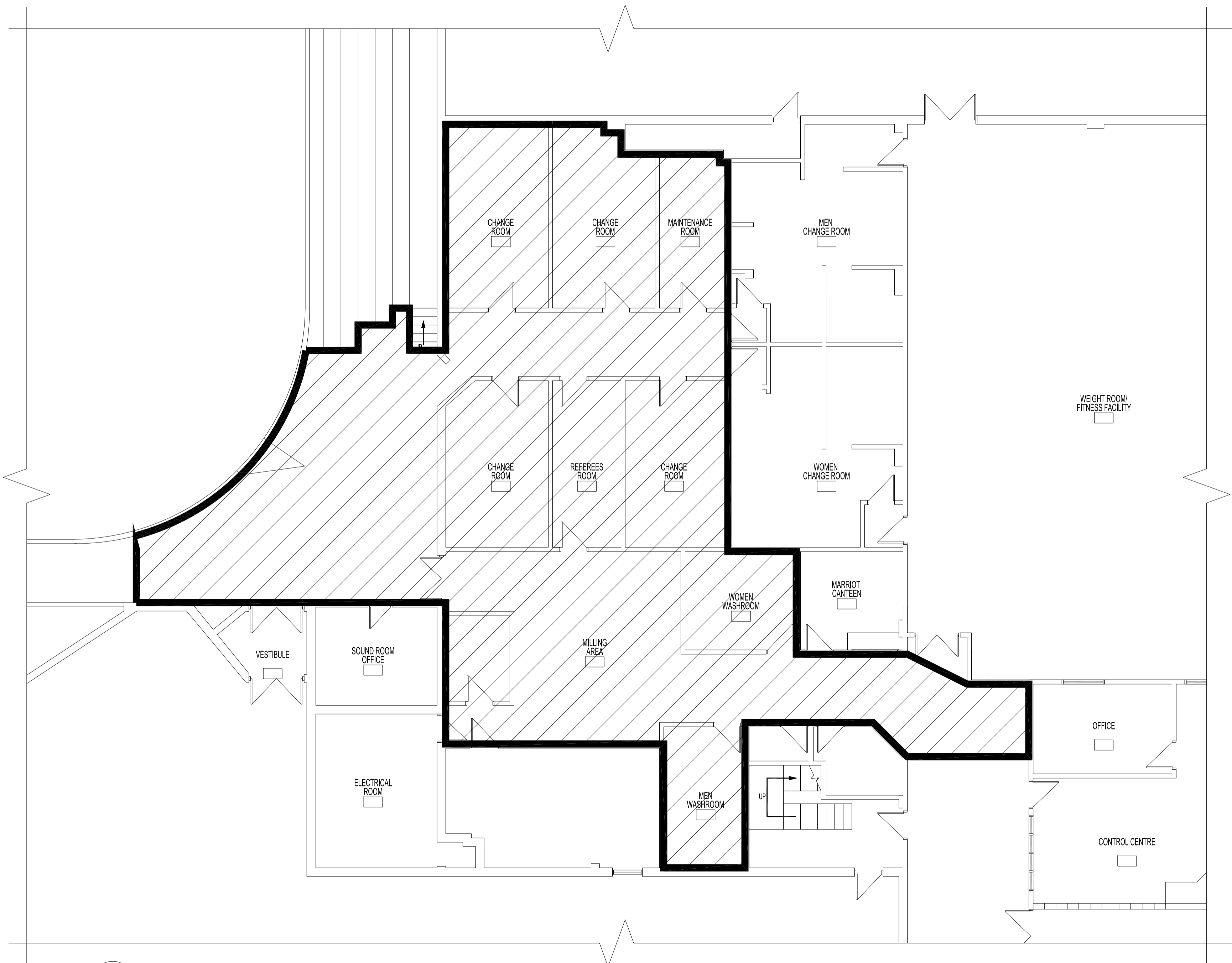
PARTIAL MAIN FLOOR PLAN SCALE: 1/8"=1'-0"

ADDRESS: 625 OSBORNE STREET PROJECT No: DESCRIPTION: PARTIAL MAIN FLOOR PLAN DATE: 2018.06.18 FILE NAME: 20180710.dwg