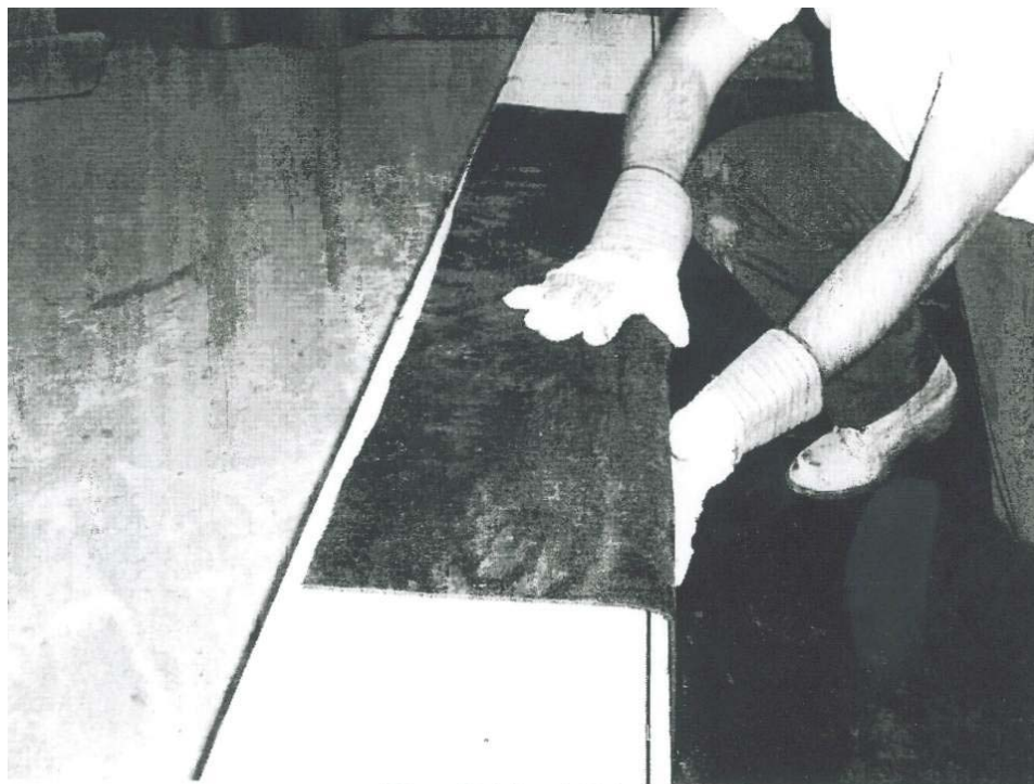
Step 3: Final fitting.