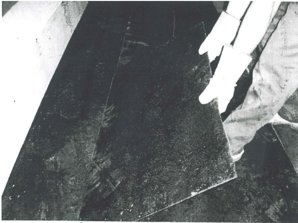
Step 2: Installation on the parapet.