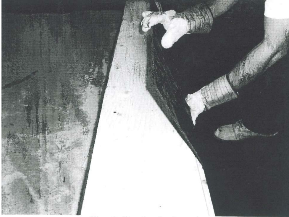
Step 3: Bending the board.