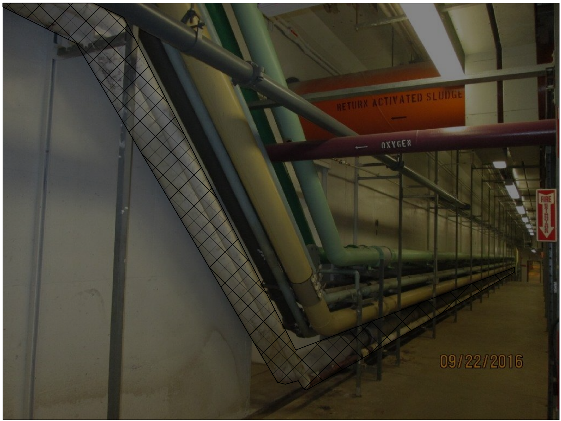
1 DEMOLITION PHOTO NTS

NOTES: REFER TO GENERAL DEMOLITION NOTES DRAWING 1-0102-DAAA-AD01. CONFIRMED ASBESTOS CONTAINING MATERIALS IN HIGH AND LOW PRESSURE STEAM FITTINGS INSULATION. REFER TO ASBESTOS ABATEMENT SPECIFICATIONS FOR ABATEMENT PROCEDURES.