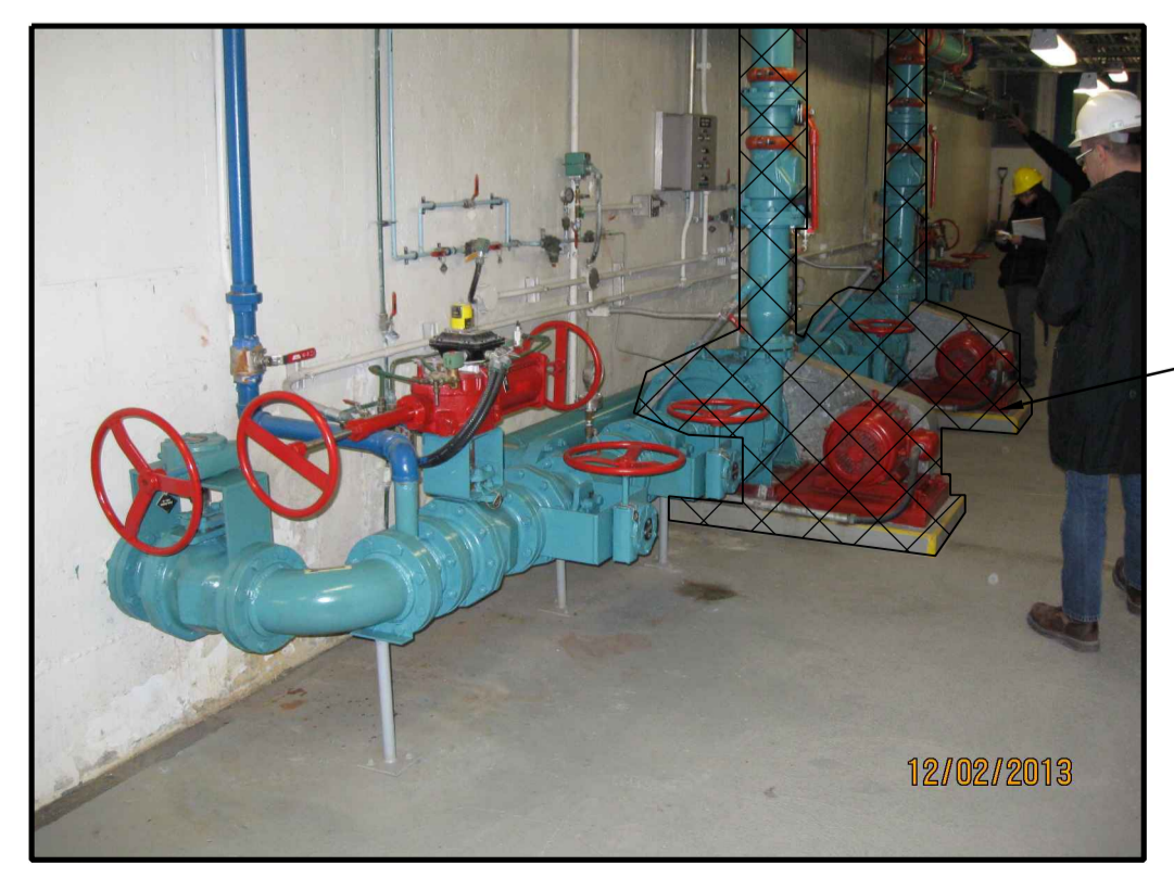
1 PHOTO NTS

REMOVE EXISTING GRIT SLURRY PUMPS INCLUDING CONCRETE PADS, DISCHARGE PIPING, AND ELECTRICAL WIRING AND COMPONENTS TO SOURCE