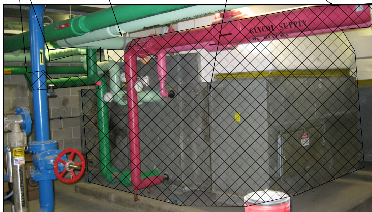
01 PHOTO MGAD-GD50

REMOVE EXISTING 75 DIA GLYCOL SUPPLY AND RETURN. CAP PIPE AT TEE