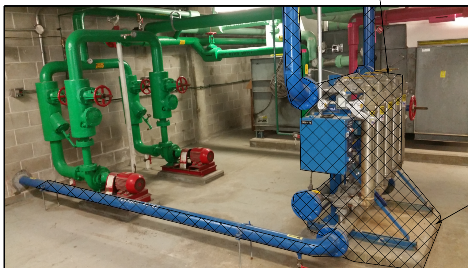
02 PHOTO MGAD-GD50

TEMPORARILY REMOVE WATER STRAINER AND ASSOCIATED PIPING. CUT AND CAP PIPE NEAR WALL