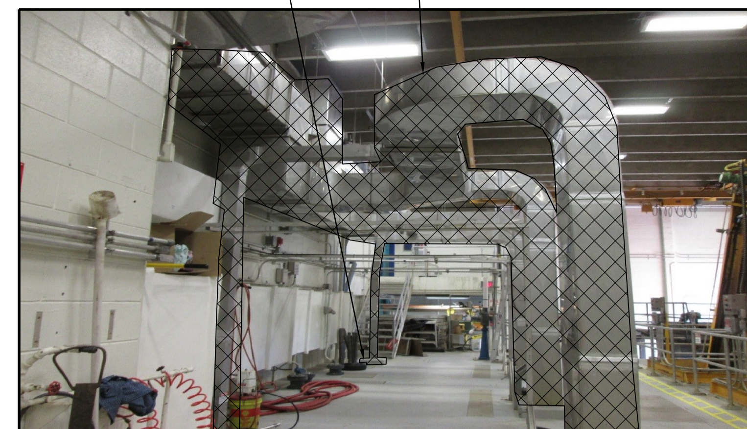
03 PHOTO MGAD-GD50