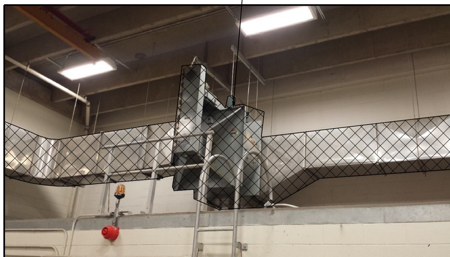
05 PHOTO MGAD-GD50

REMOVE EXISTING DUCTWORK, EXHAUST FAN, ASSOCIATED COMPONENTS AND WIRING