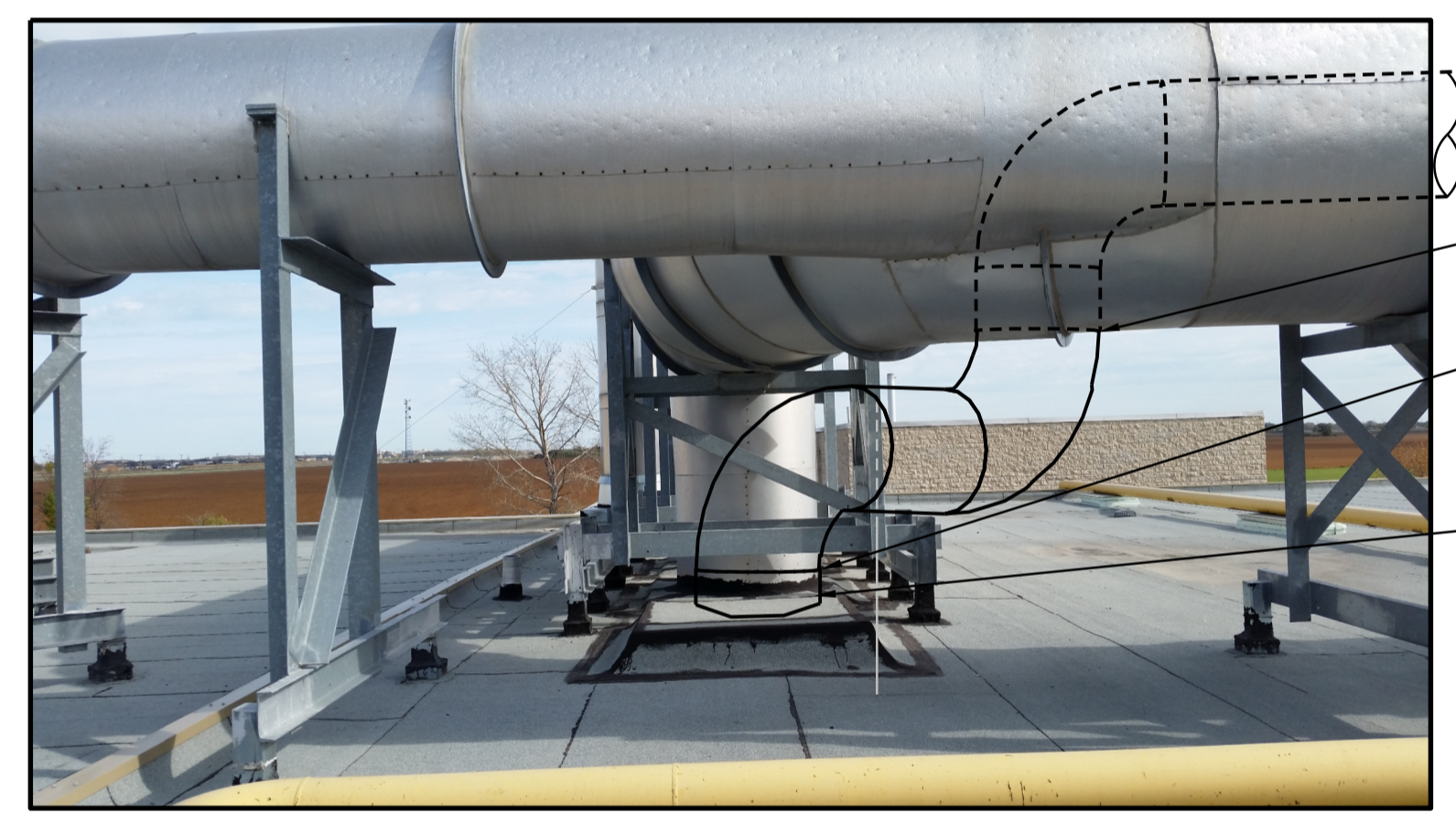
SERVICE BUILDING MECHANICAL ROOM 11 PHOTO MGAD-G605

NOTES: 1. CONFIRMED ASBESTOS CONTAINING MATERIAL IN HEATING WATER FITTINGS INSULATION. REFER TO ASBESTOS ABATEMENT SPECIFICATIONS FOR ABATEMENT PROCEDURES. 2. CONFIRMED ASBESTOS CONTAINING MATERIAL DUCTWORK INSULATION. REFER TO ASBESTOS ABATEMENT SPECIFICATIONS FOR ABATEMENT PROCEDURES.