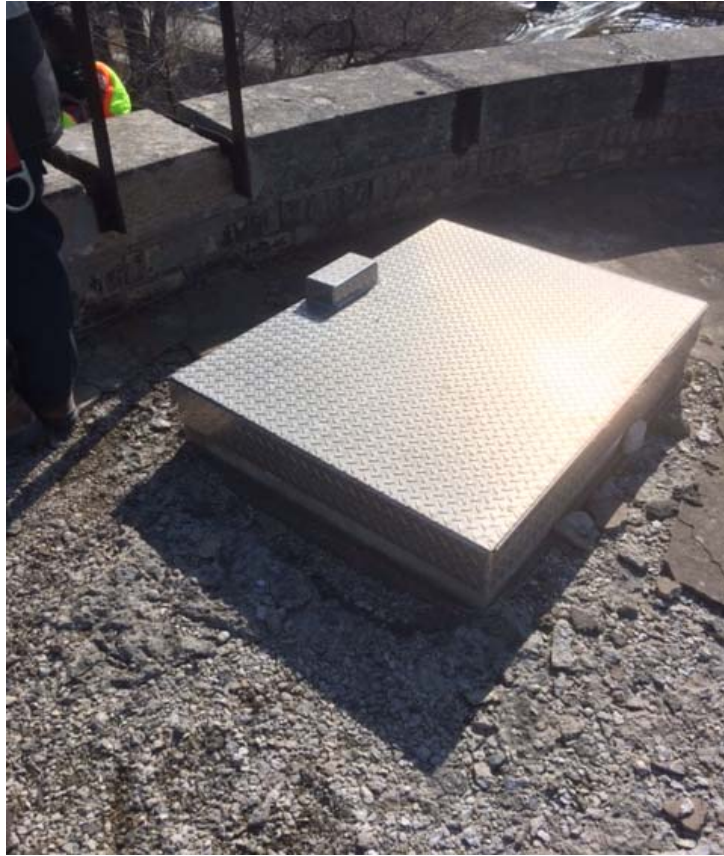
Add: Photo 11: Surge Tower Roof Hatch