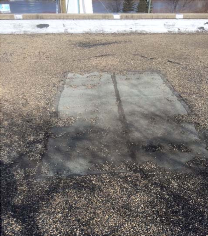
Add: Photo 6: Tache Booster Pumping Station Roof