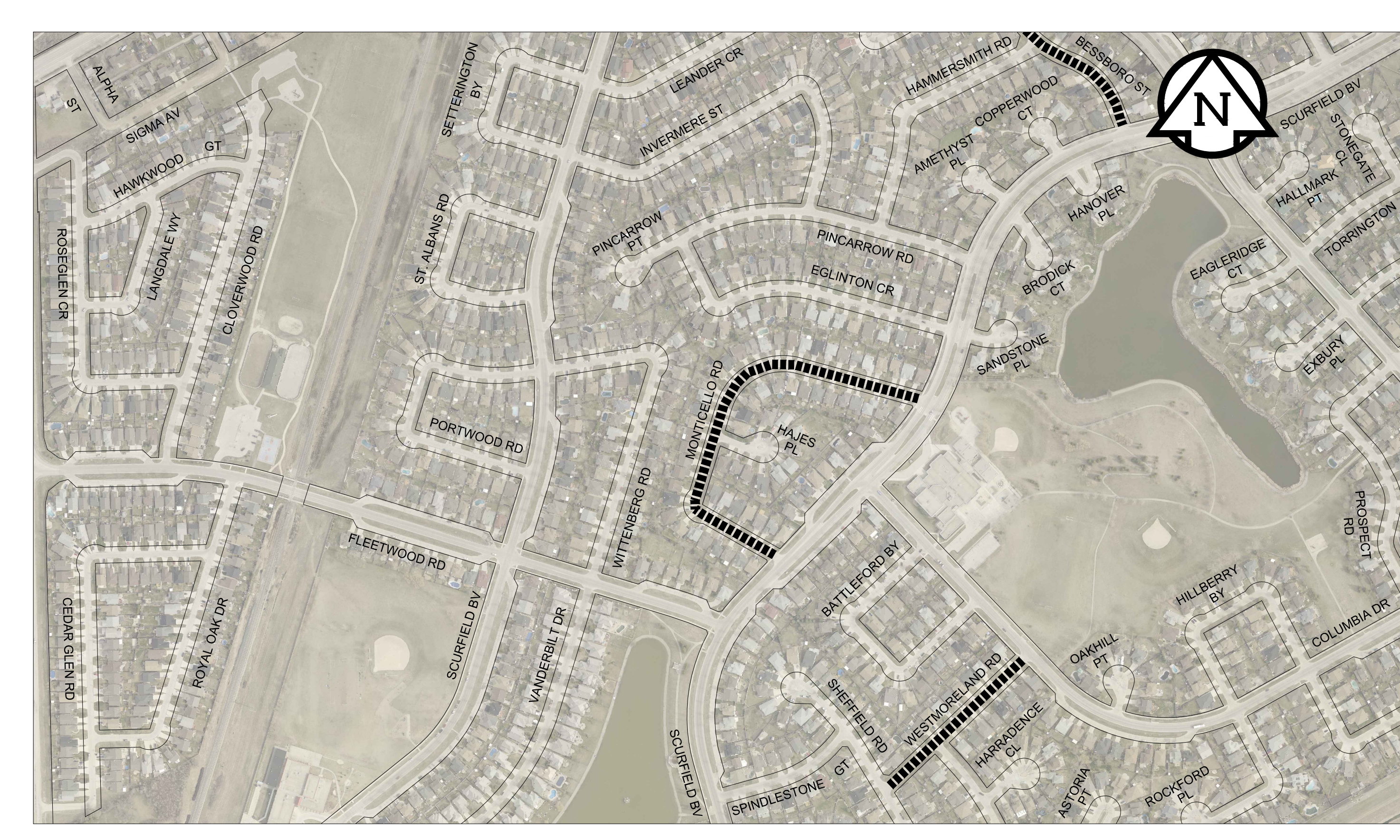
MONTICELLO ROAD - SCURFIELD BV TO SCURFIELD BV