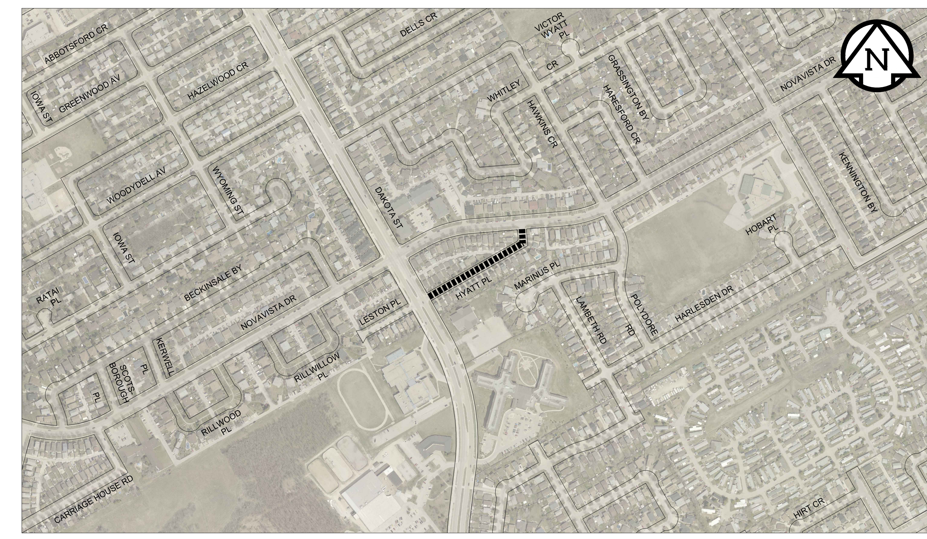
HYATT PLACE - DAKOTA ST TO NOVAVISTA DR