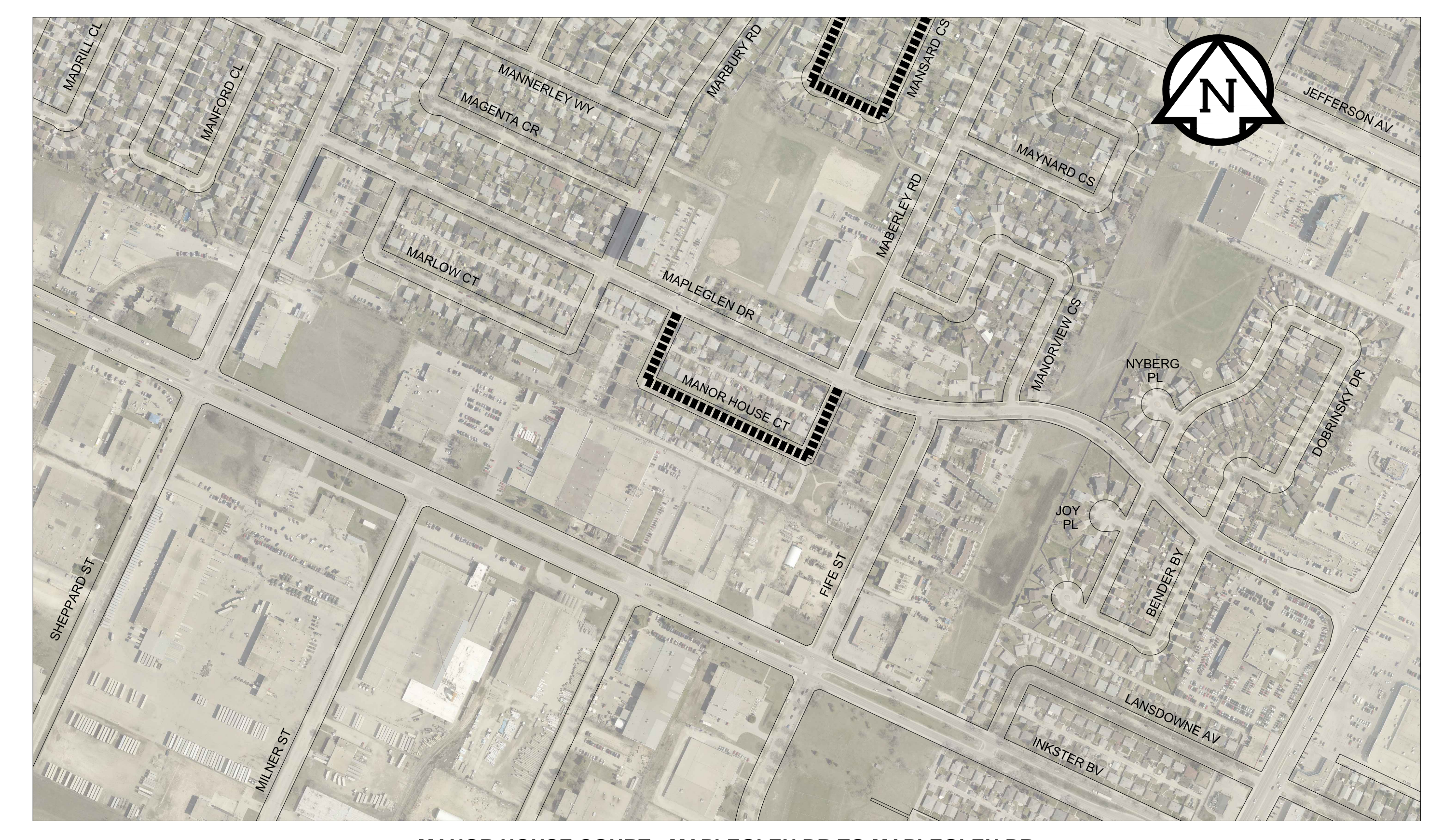
MANOR HOUSE COURT - MAPLEGLEN DR TO MAPLEGLEN DR