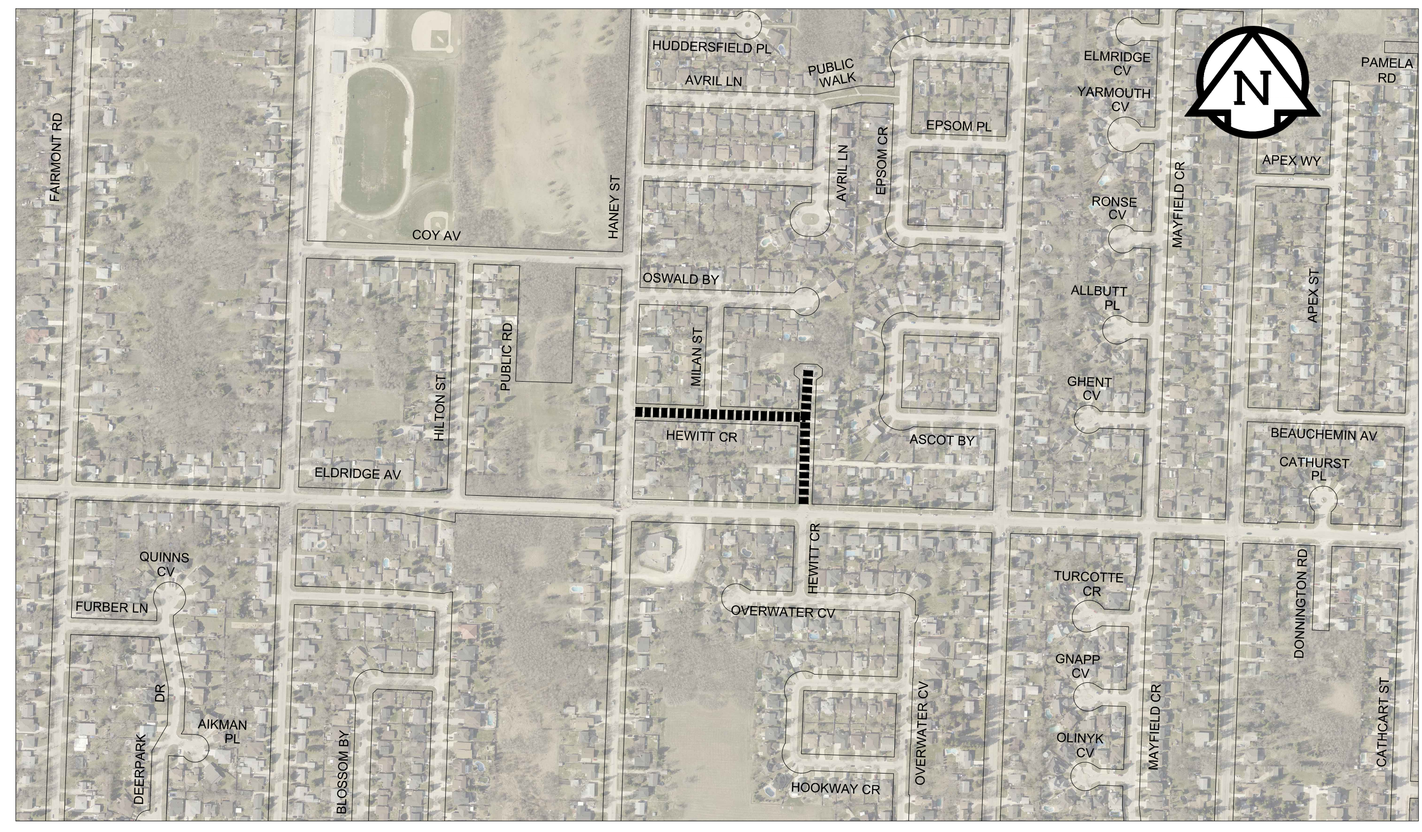
HEWITT CRESCENT - ELDRIDGE AV TO HANEY ST