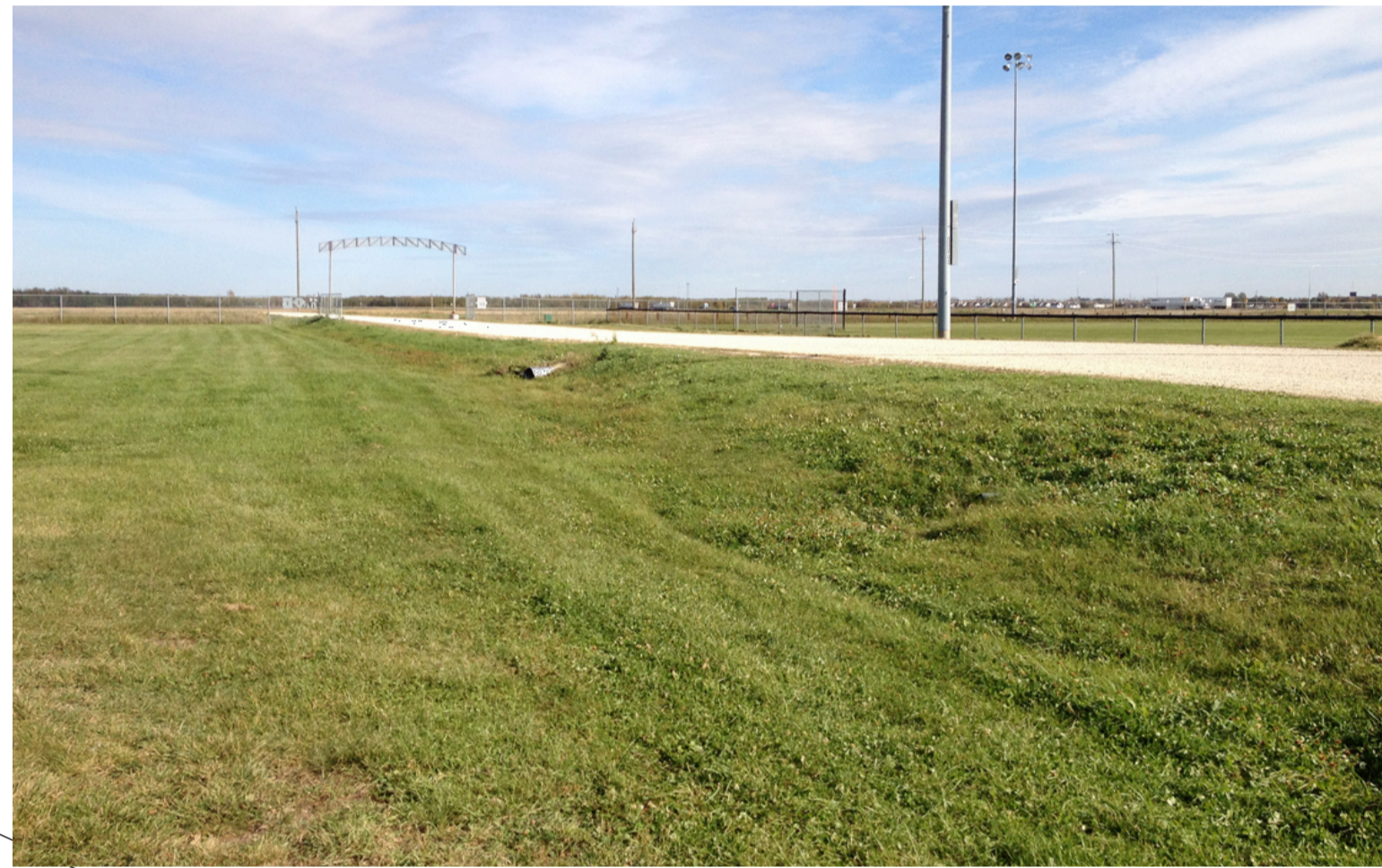
2 DITCH AND CMP FACING EAST L-SS