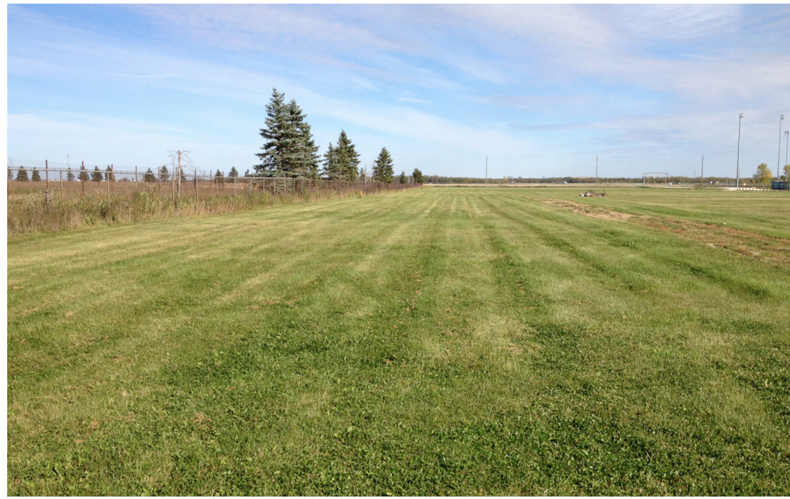
1 NORTH FENCE LINE FACING EAST L-SS