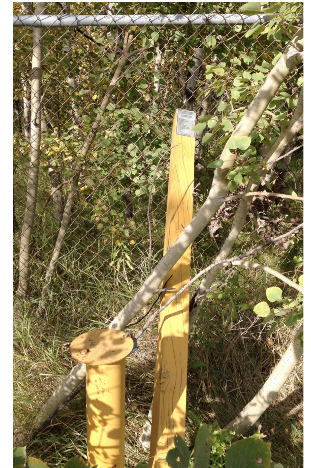
4 PIEZOMETER ON NORTH FENCE LINE L-SS