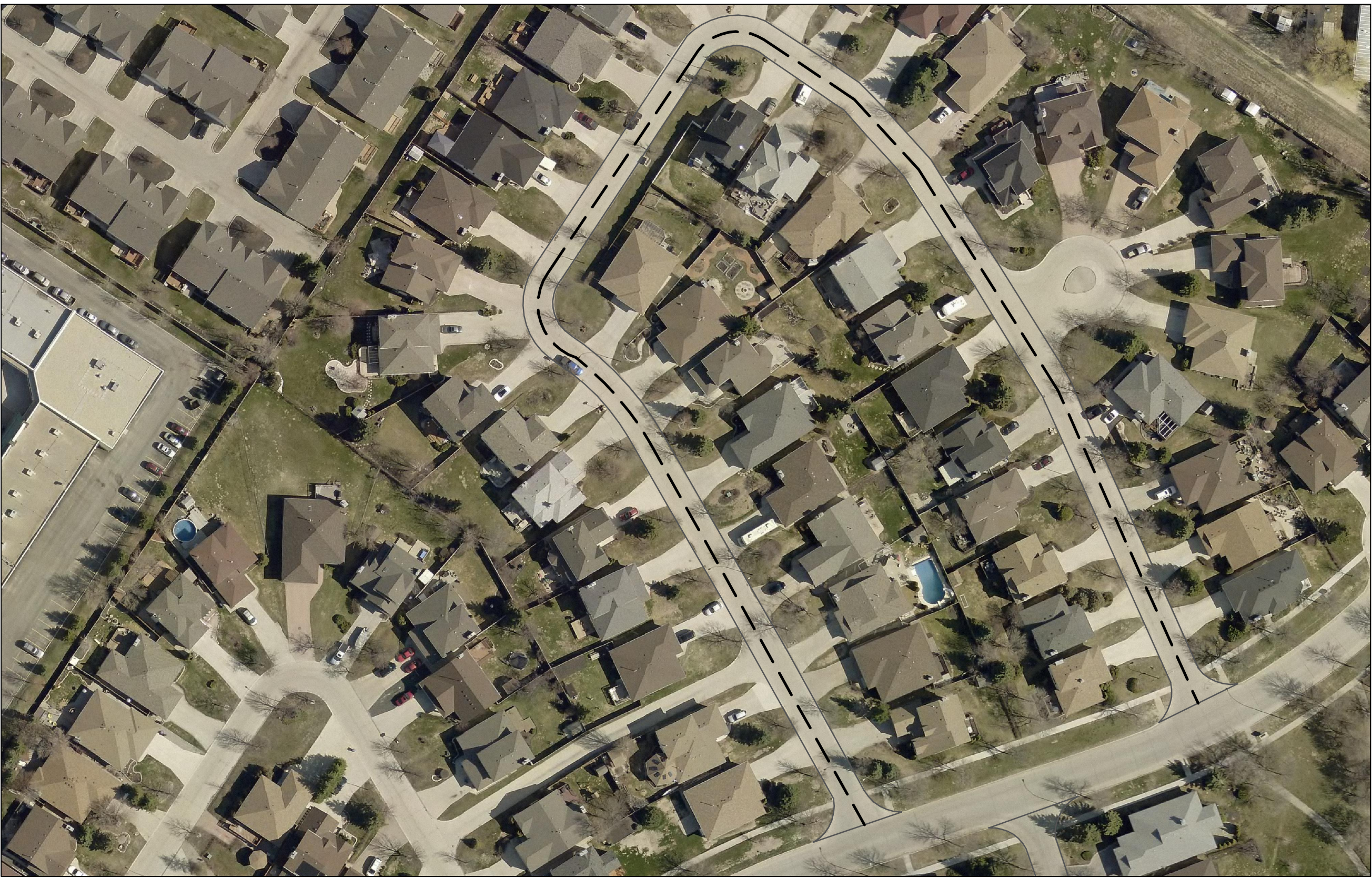
SAUL MILLER DRIVE - RIVERGROVE DRIVE TO RIVERGROVE DRIVE SCALE NTS