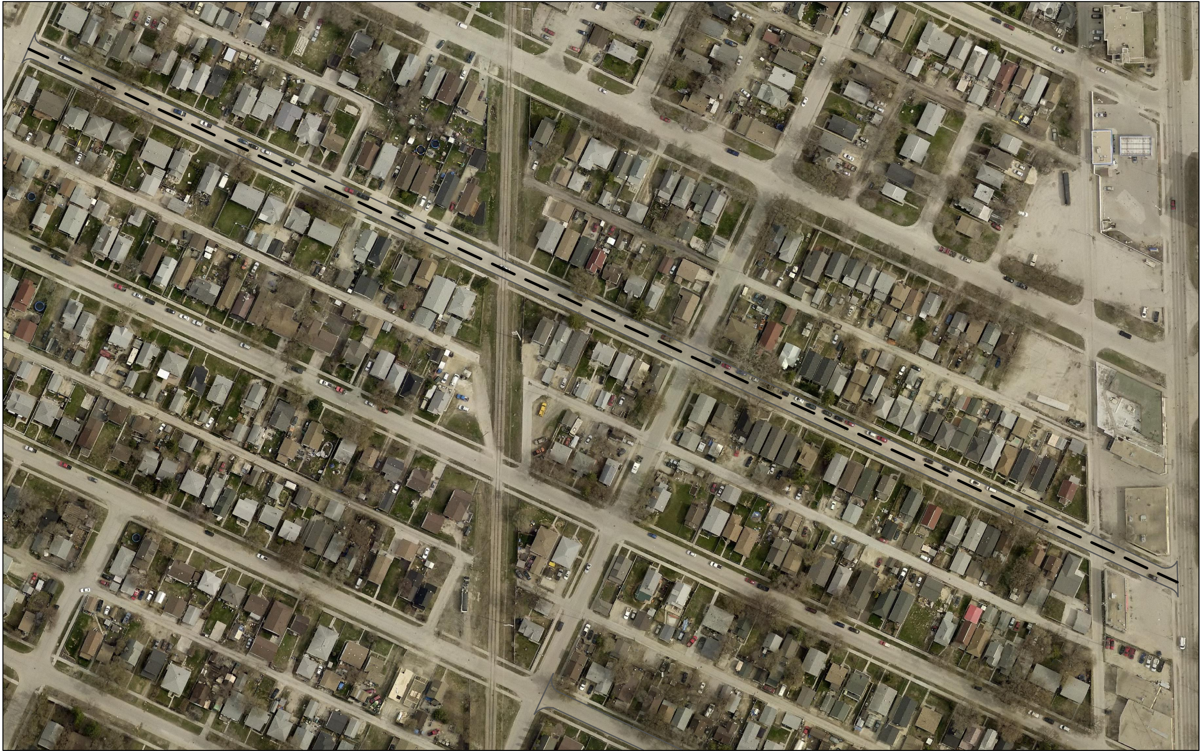
ROSS AVENUE (WEST) - KEEWATIN STREET TO ODDY STREET SCALE NTS