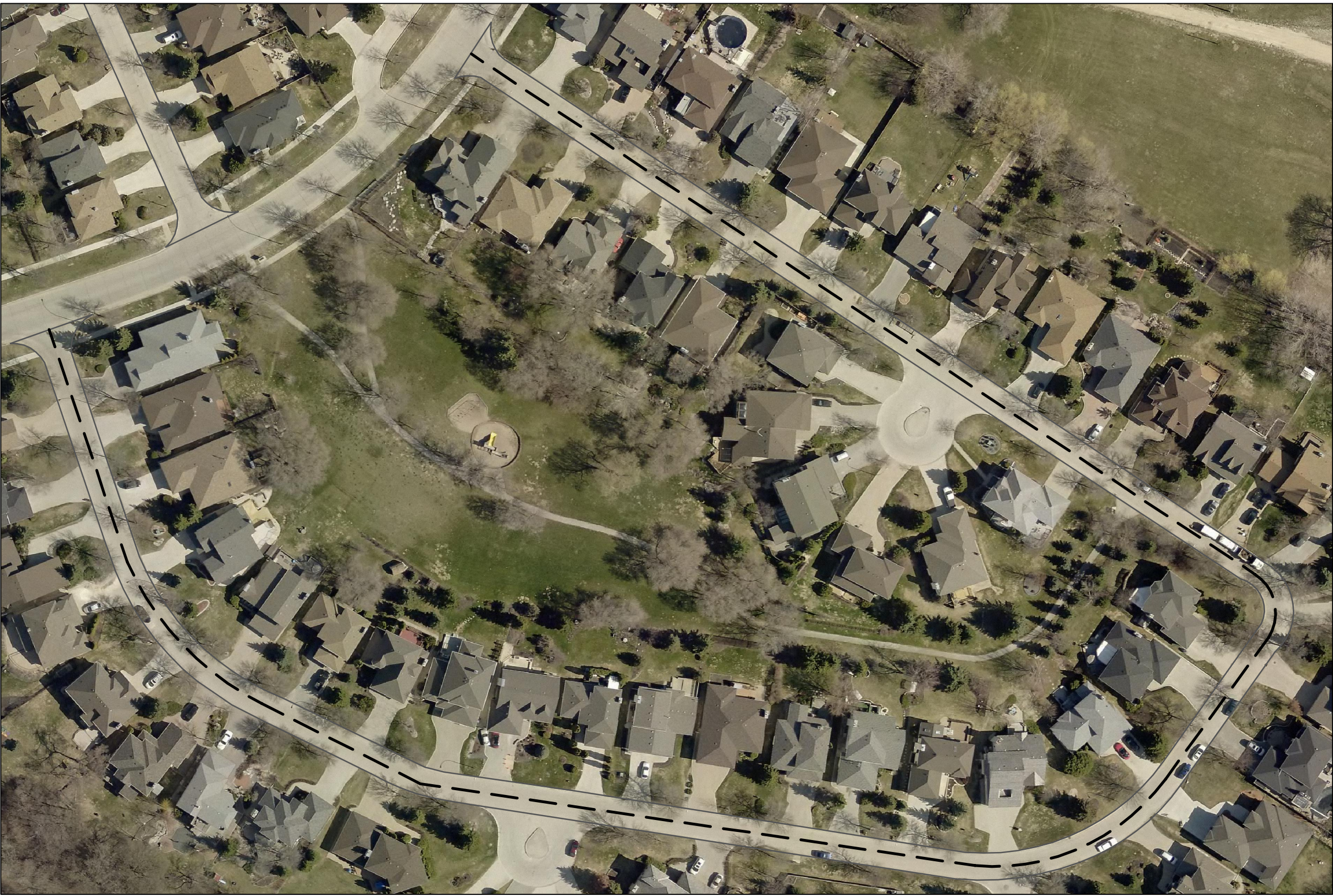
SUMMERVIEW LANE - RIVERGROVE DRIVE TO RIVERGROVE DRIVE SCALE NTS