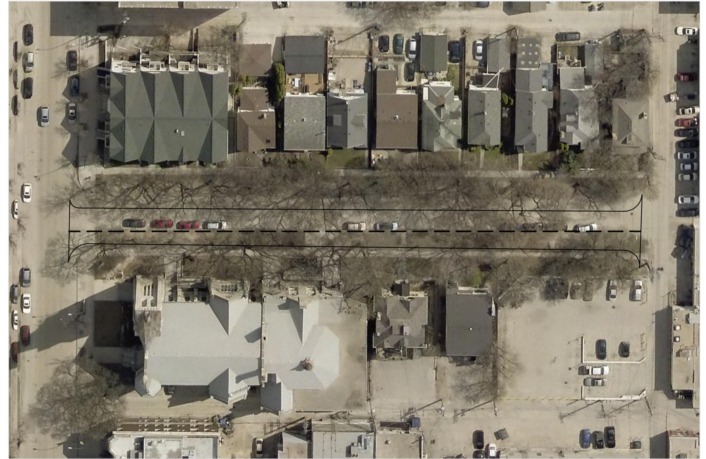
PULFORD STREET - RIVER AVENUE TO END SCALE NTS