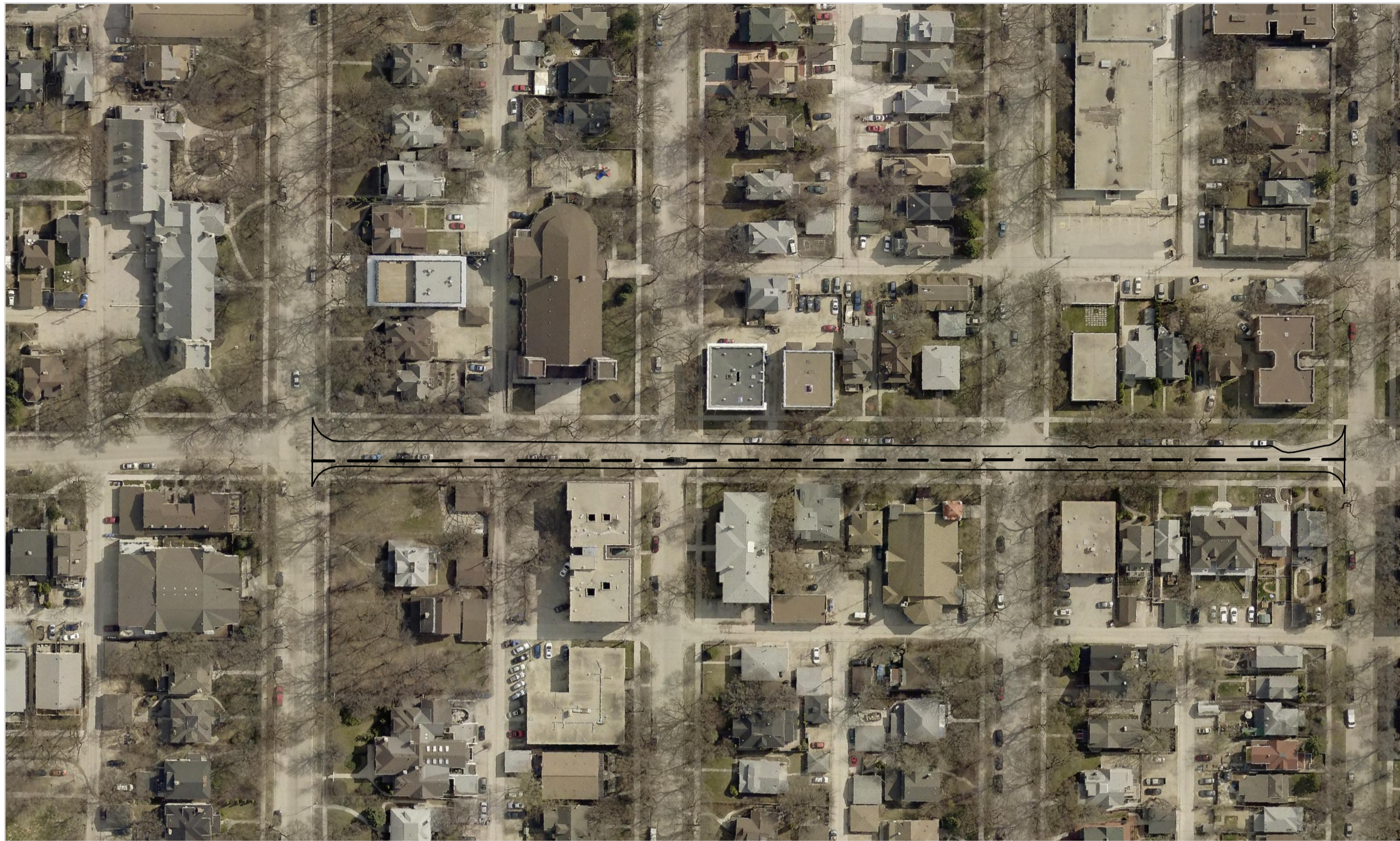
NASSAU STREET (NORTH) - McMILLAN AVENUE TO STRADBROOK AVENUE SCALE NTS