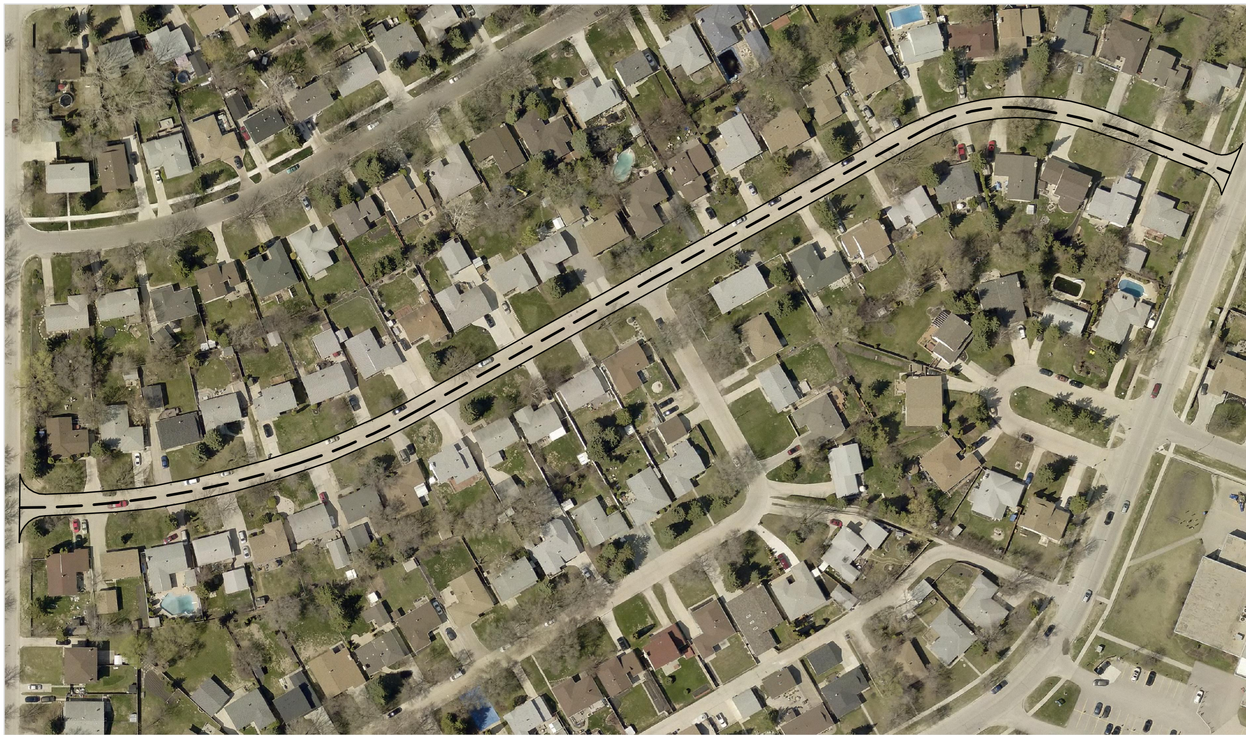
LEEDS AVENUE - BAYLOR AVENUE TO DALHOUSIE DRIVE SCALE NTS