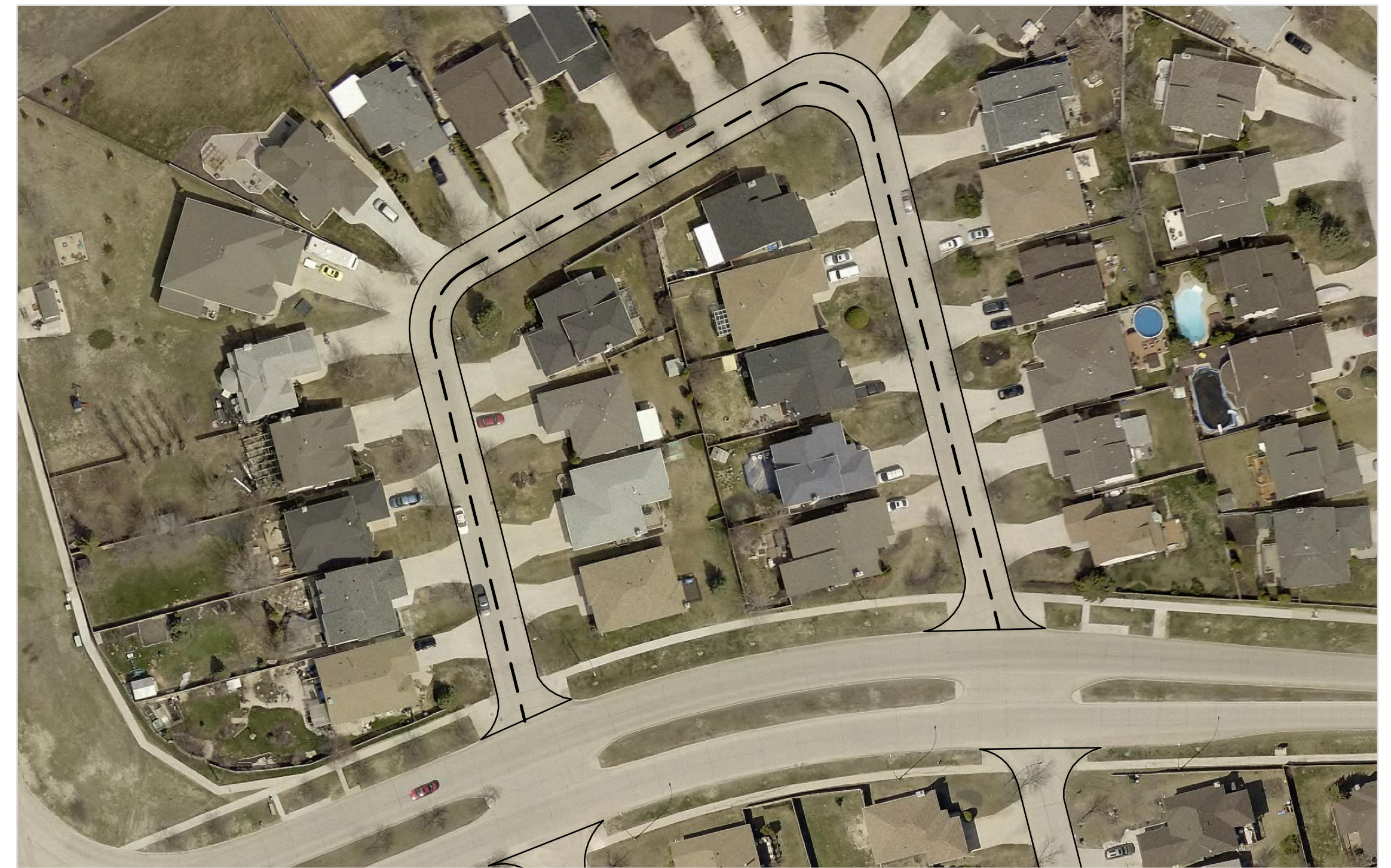
EVERINGHAM BAY - ALDGATE ROAD TO ALDGATE ROAD SCALE NTS