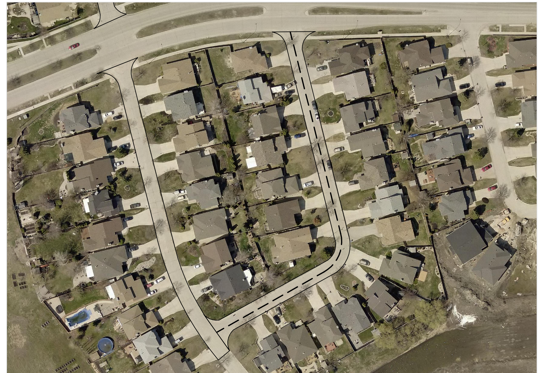
SLOANE CRESCENT - ALDGATE ROAD TO HALLFIELD BAY SCALE NTS