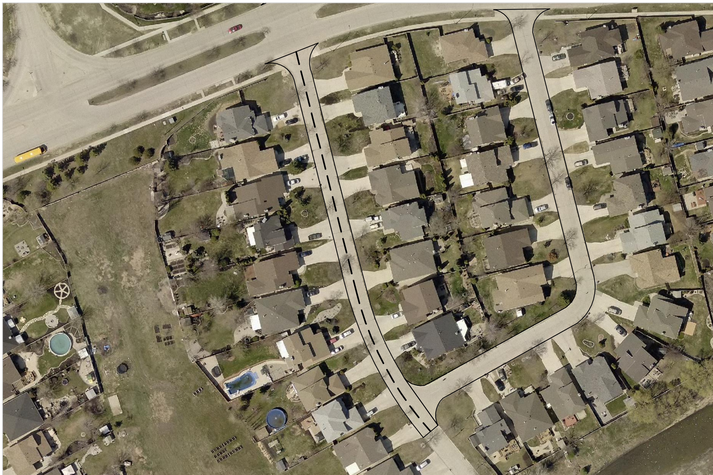
HALLFIELD BAY - ALDGATE ROAD TO SLOANE CRESCENT SCALE NTS