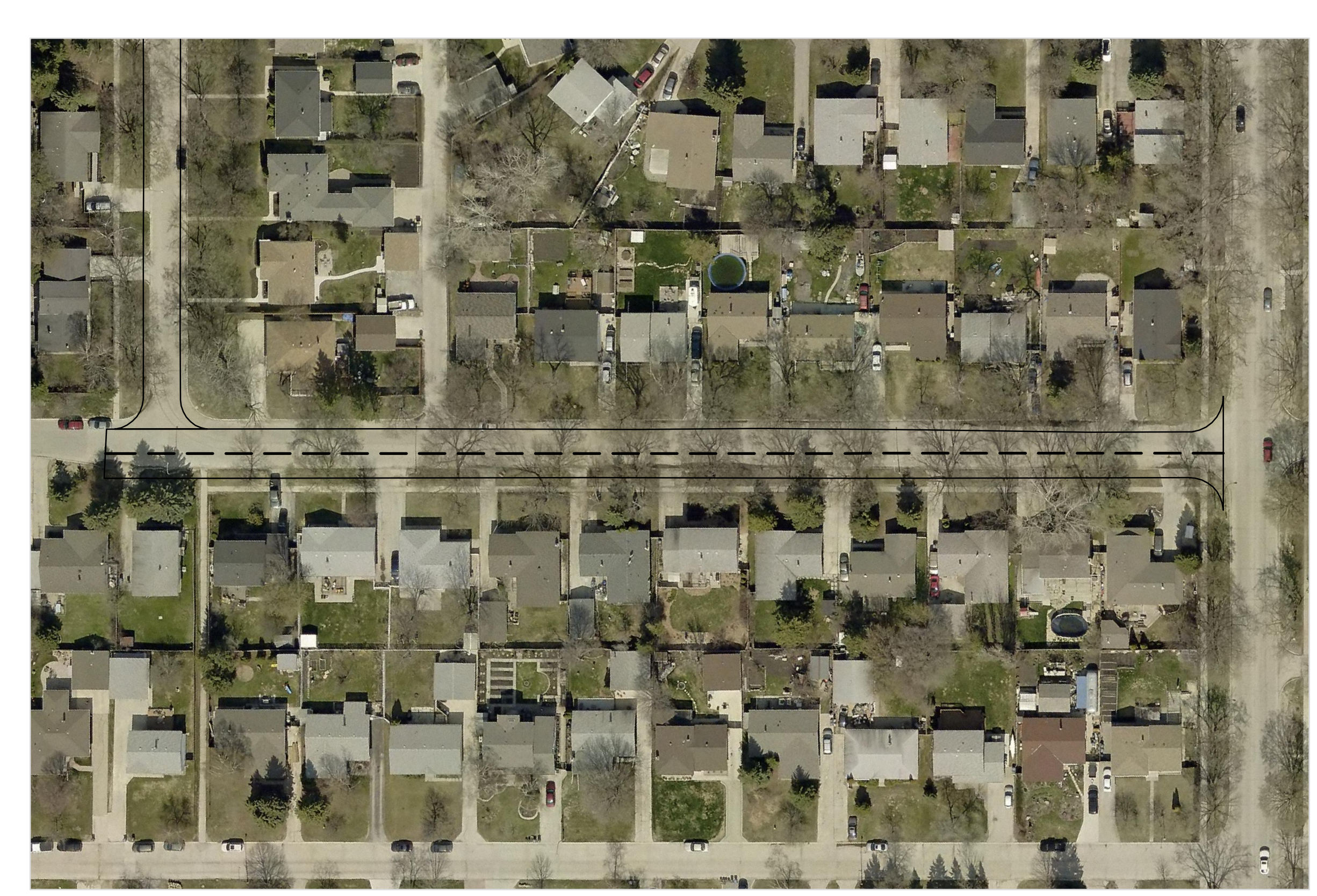
LAVAL DRIVE - PASADENA AVENUE TO SILVERSTONE AVENUE SCALE NTS