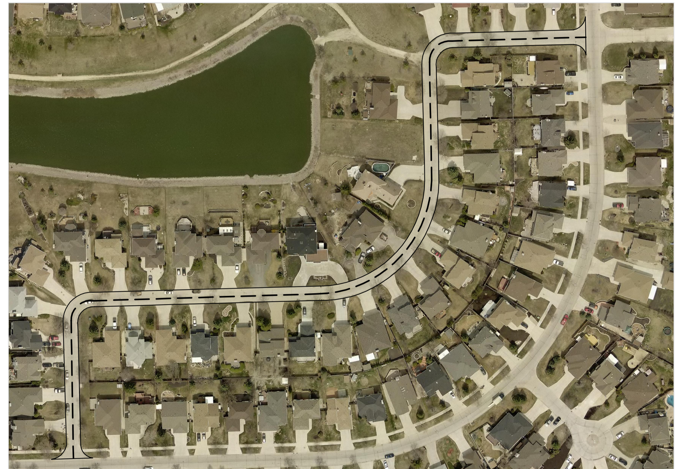
ROYAL PARK CRESCENT - ROYAL MINT DRIVE TO ROYAL MINT DRIVE SCALE NTS