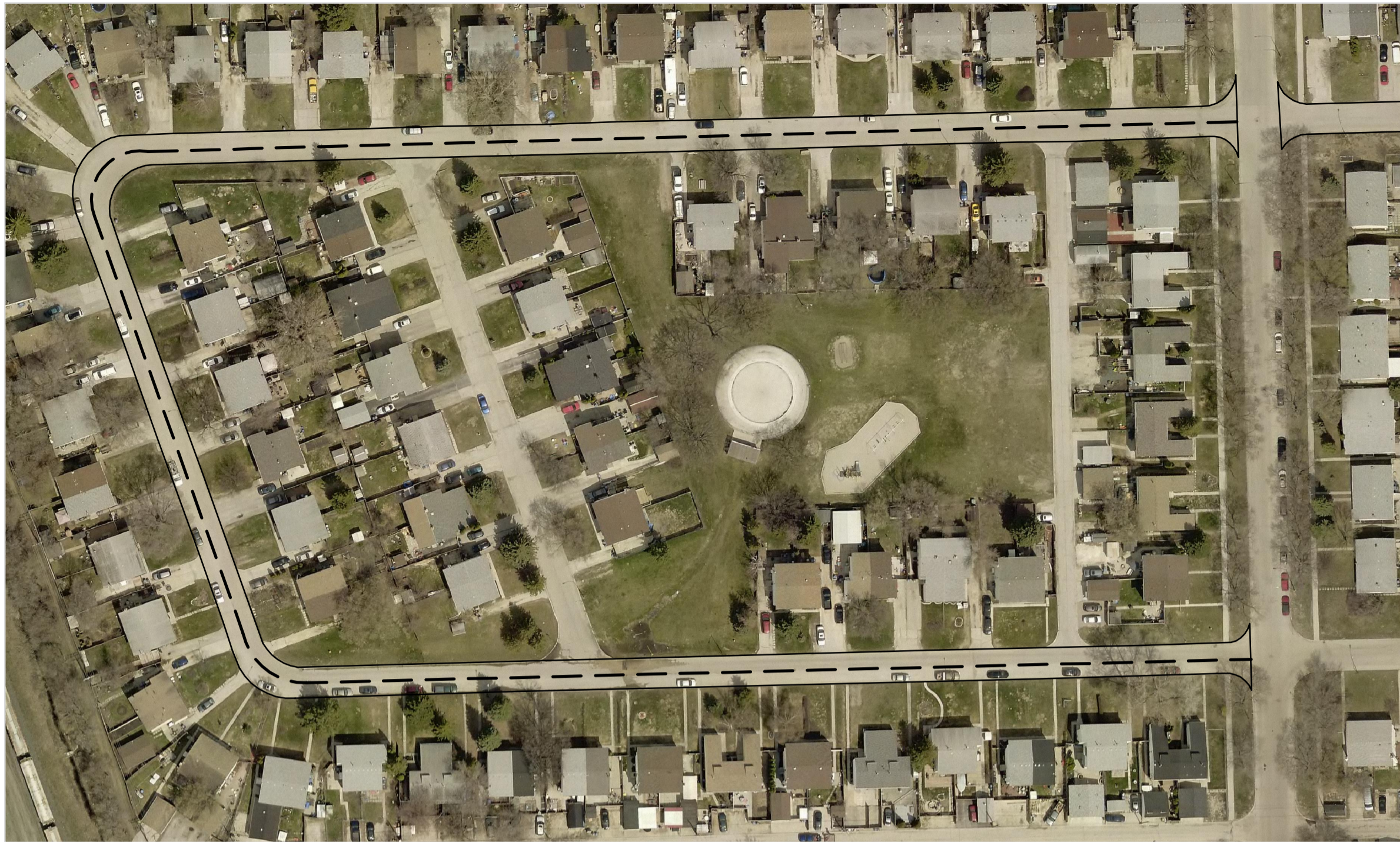
BERKSHIRE BAY - DRAKE BOULEVARD TO DRAKE BOULEVARD SCALE NTS