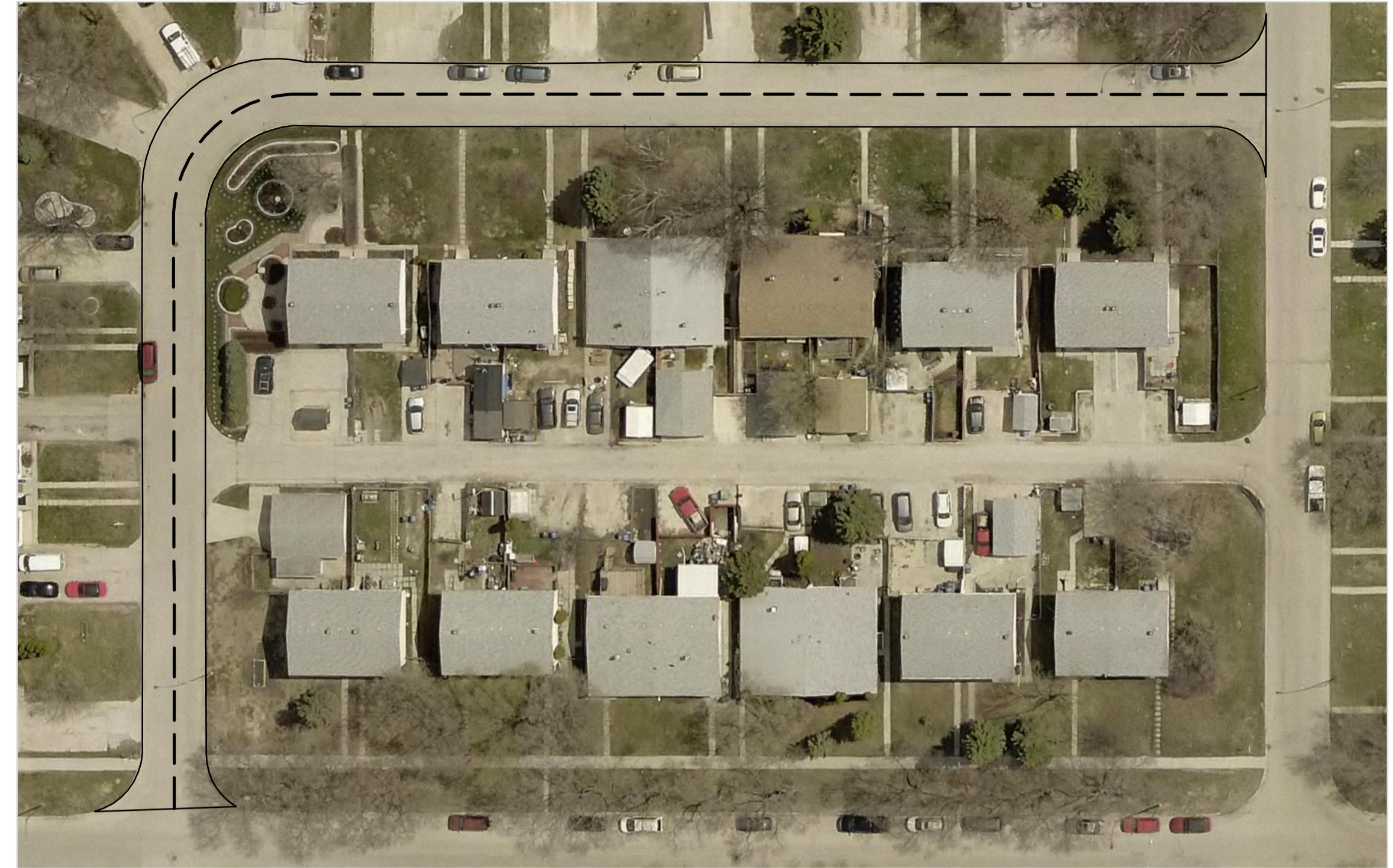
HAMPSHIRE BAY - DRAKE BOULEVARD TO WICKHAM ROAD SCALE NTS