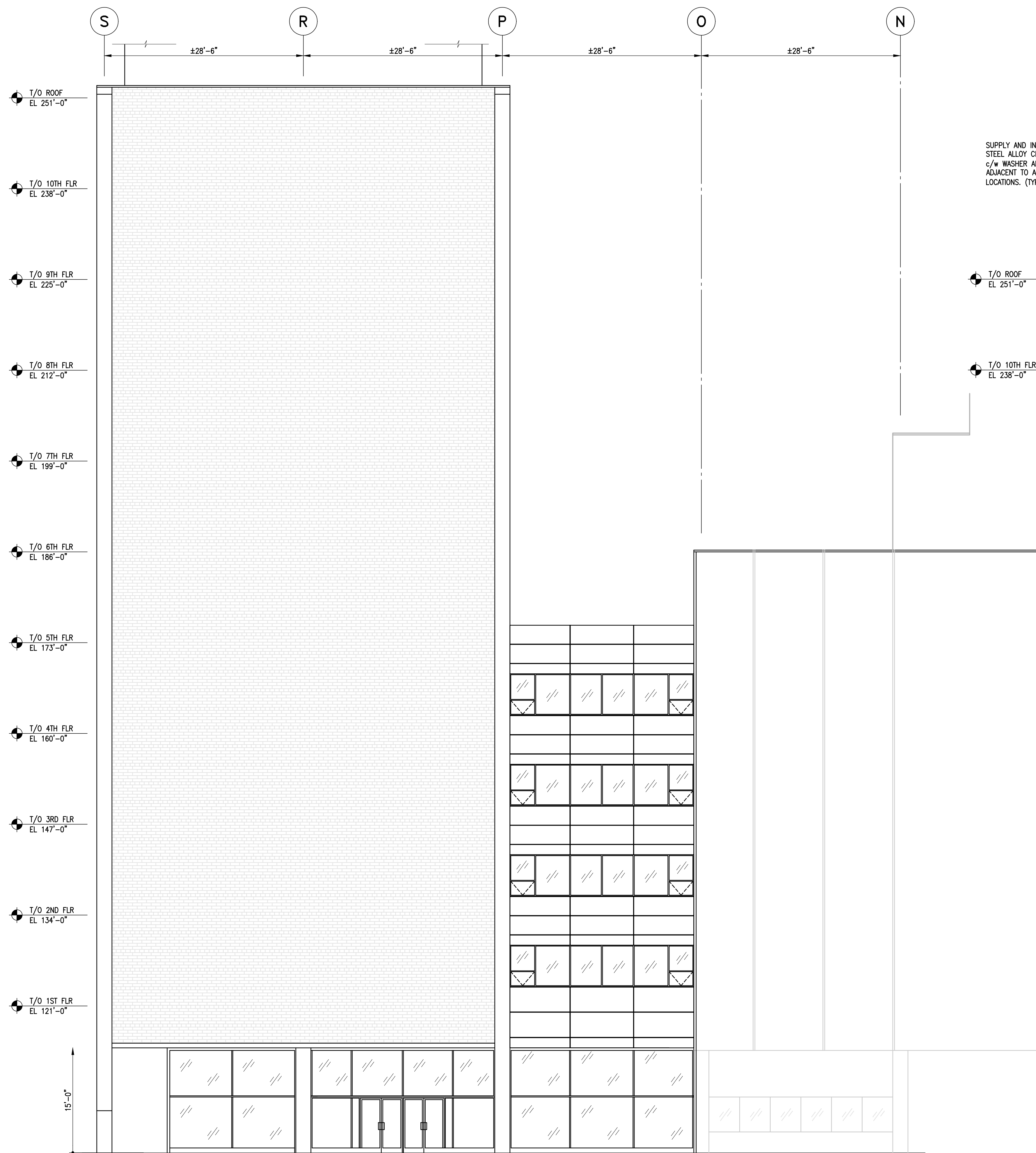
1 WEST ELEVATION S1.3 1/8" = 1'-0"