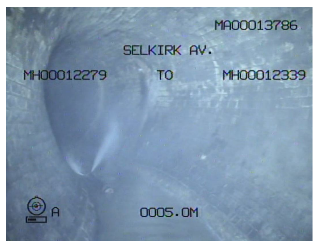
Figure 12 – Selkirk Ave Trunk, 5.0m downstream of MH00012279, facing east