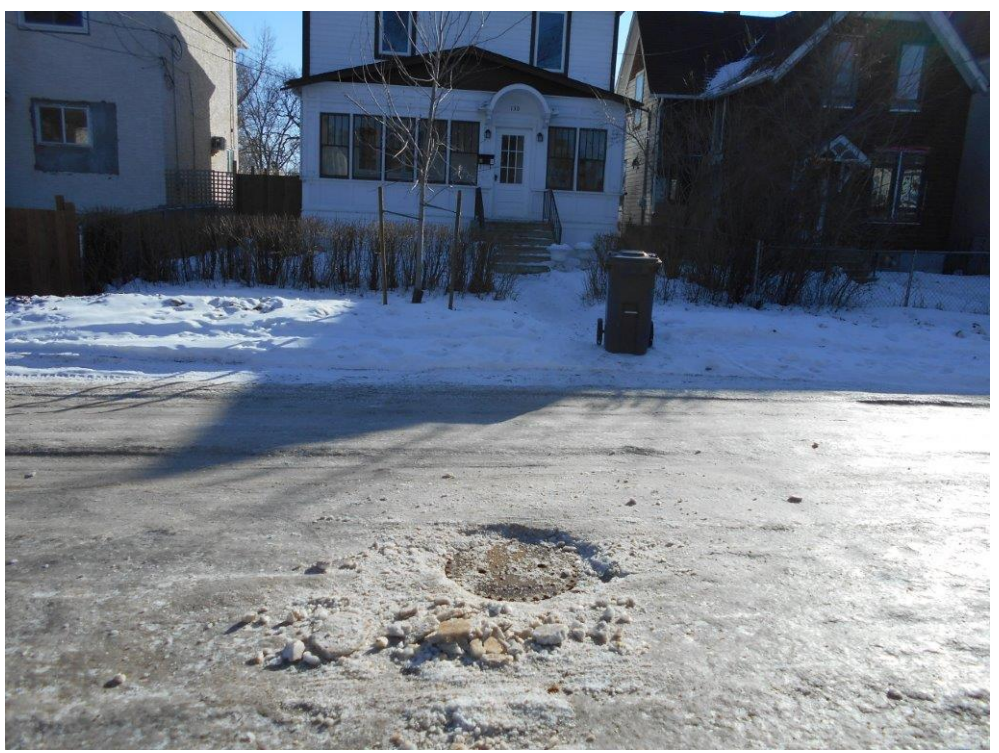
Figure 11 – Selkirk Avenue looking at manhole MH00012339, facing south