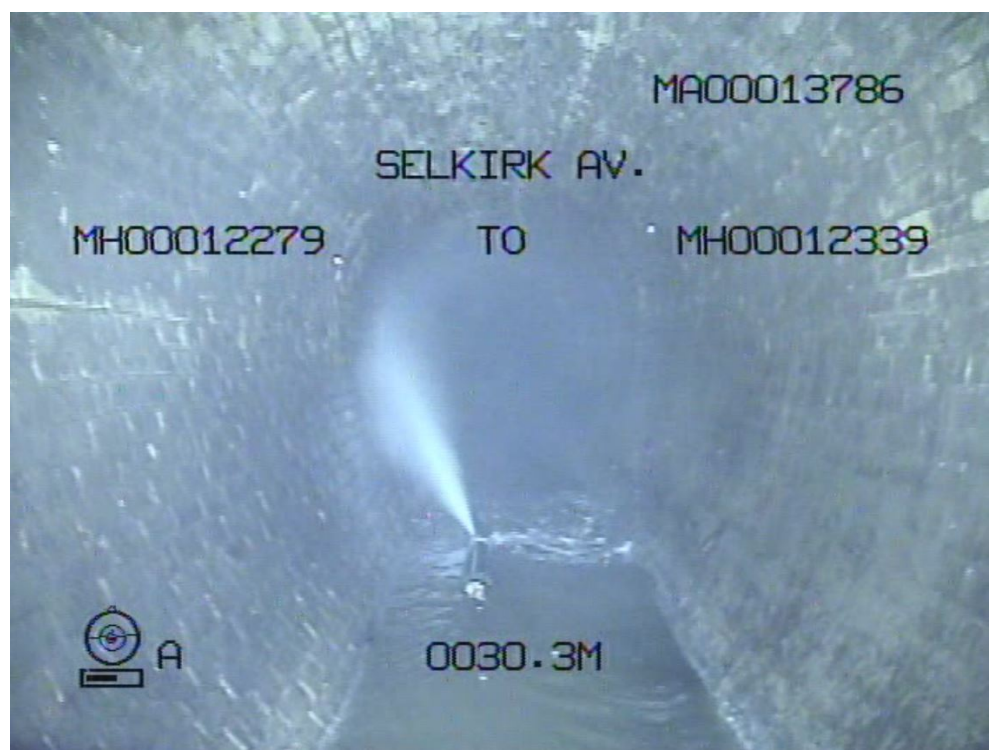
Figure 14 – Selkirk Ave Trunk, 30.3m downstream of MH00012279, facing east