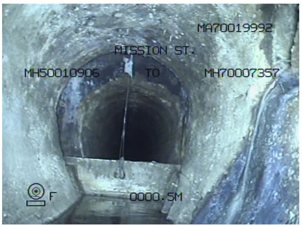
Figure 4 – Mission Trunk, upstream of weir manhole, facing west