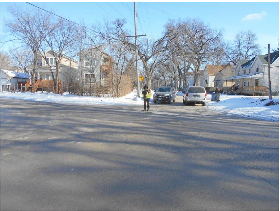
Figure 8 – Selkirk Ave Trunk and Austin Street North, facing east