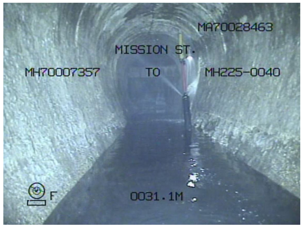
Figure 7 – Mission Trunk, 31.1m downstream of weir manhole, facing west