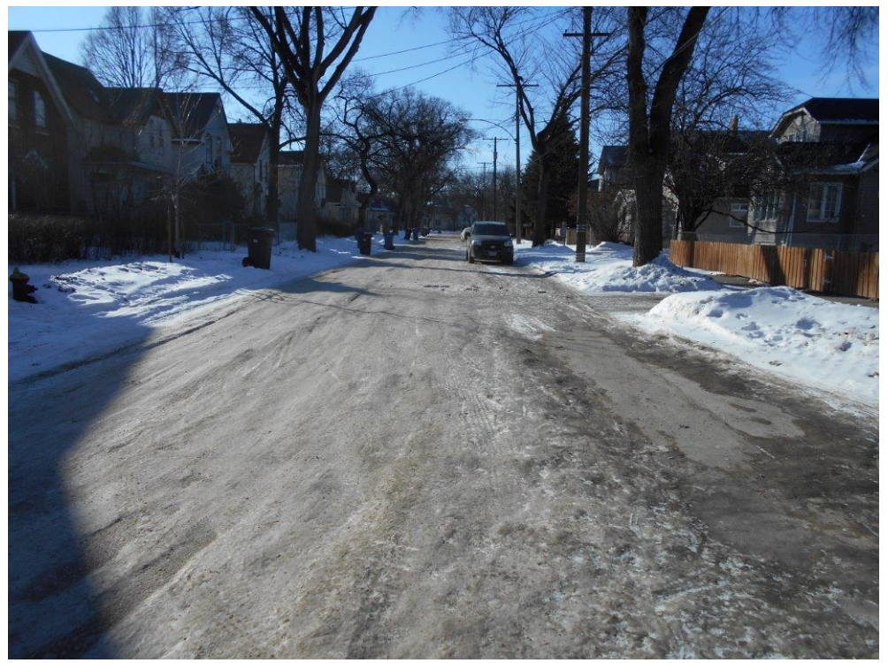
Figure 10 – Selkirk Avenue looking at manhole MH00012339, facing west