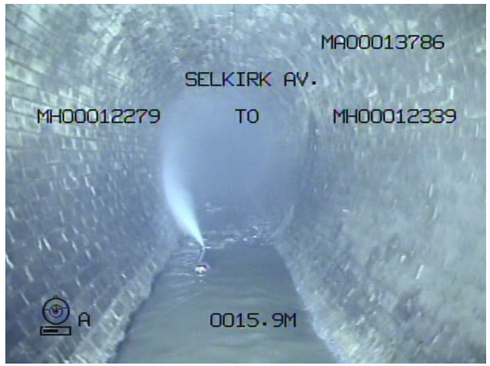
Figure 13 – Selkirk Ave Trunk, 15.9m downstream of MH00012279, facing east