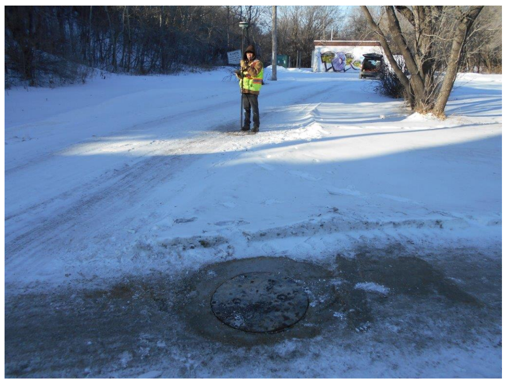
Figure 2 - Mission Trunk weir manhole, facing west