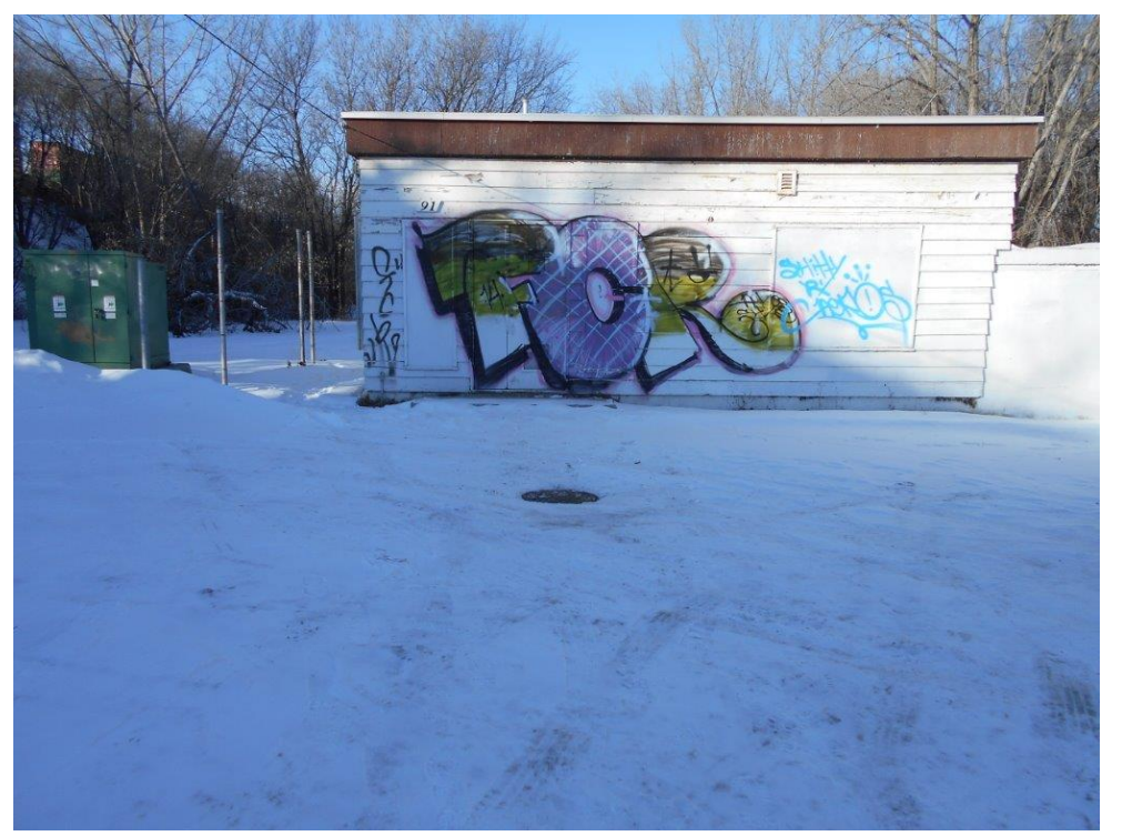
Figure 3 - Mission Flood Pumping Station, facing west