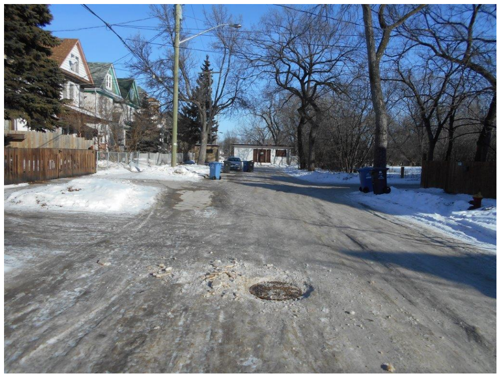
Figure 9 – O/S No. 125 Selkirk Avenue, at manhole MH00012339, facing east