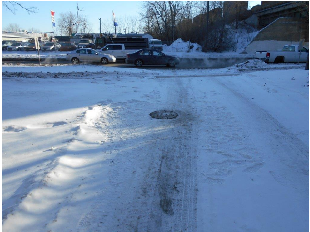
Figure 1 - Mission Trunk weir manhole, facing east