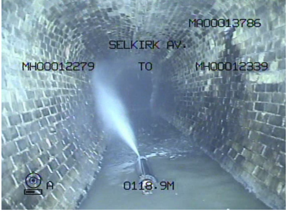
Figure 16 – Selkirk Ave Trunk, 118.9m downstream of MH00012279, facing east