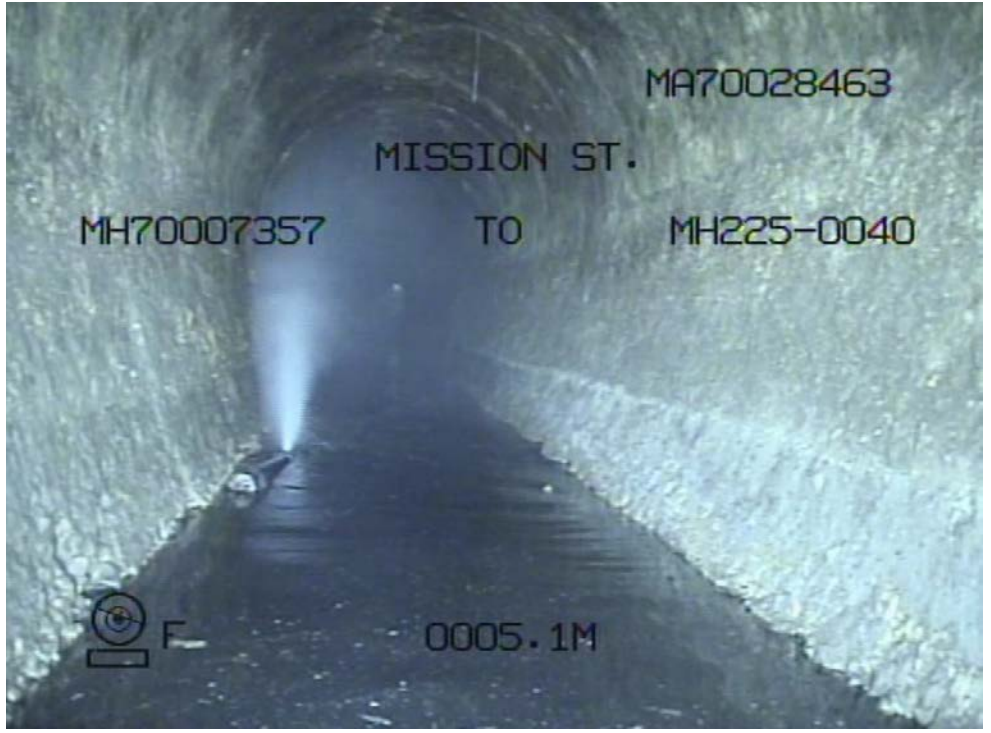
Figure 5 – Mission Trunk, 5.1m downstream of weir manhole, facing west