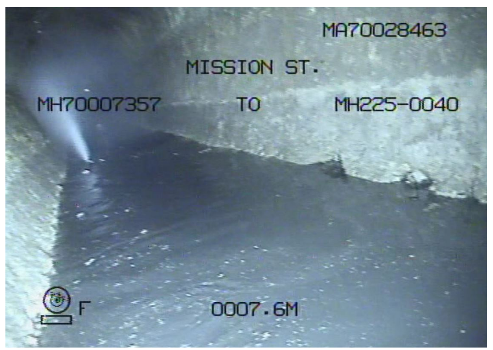
Figure 6 – Mission Trunk, 7.6m downstream of weir manhole, facing west