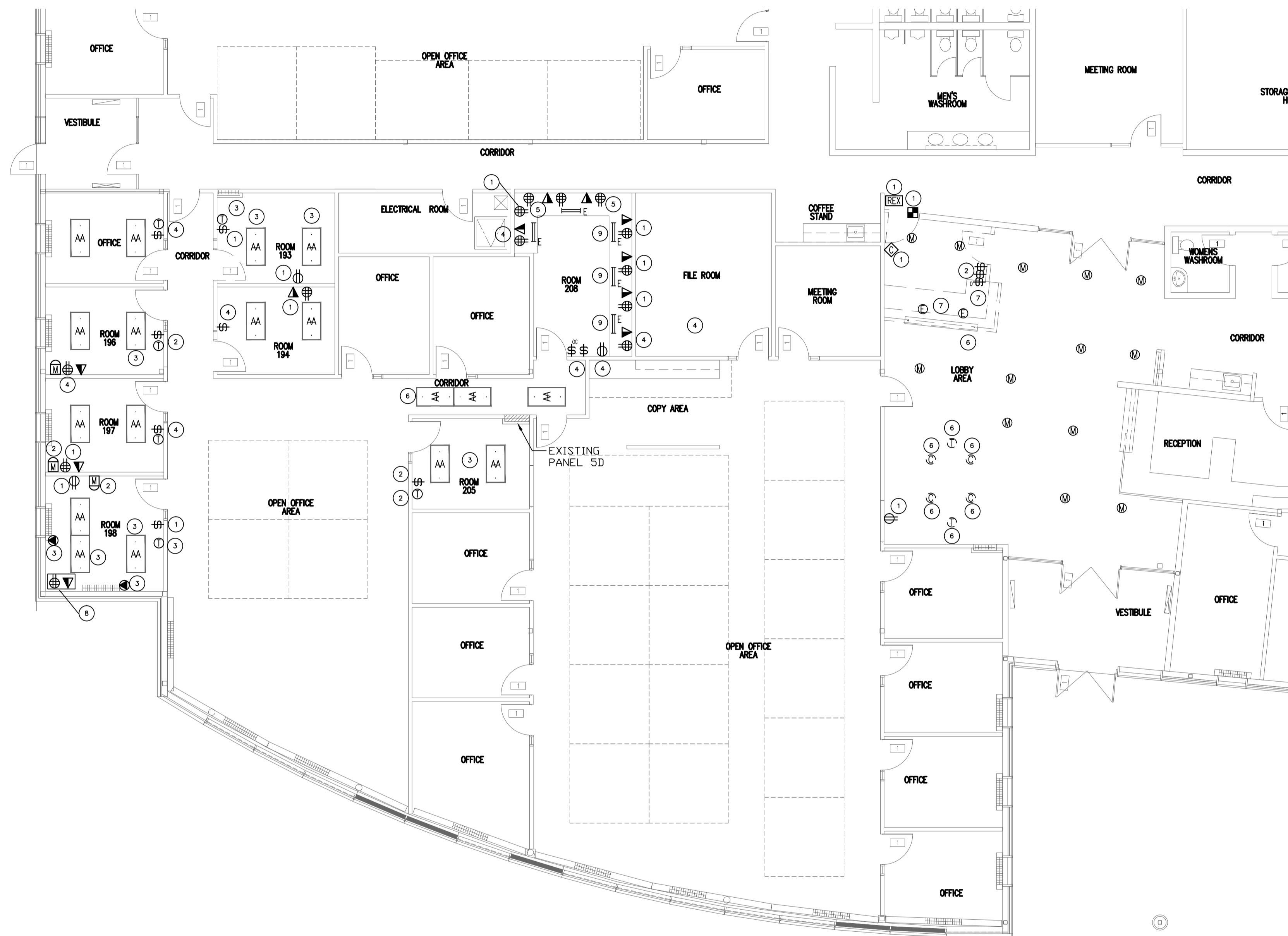
PARTIAL MAIN FLOOR PLAN-LIGHTING AND POWER - DEMO SCALE: 1/8"=1'-0"