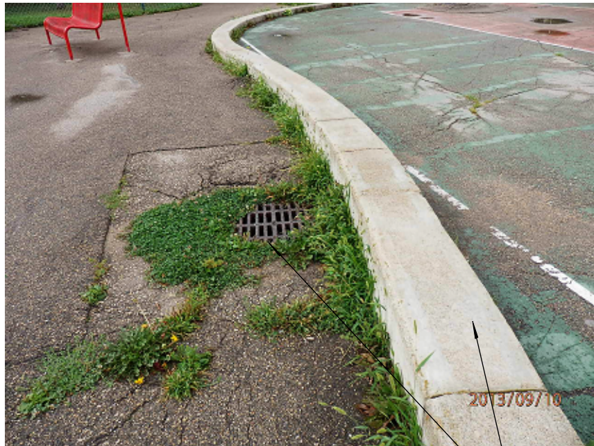
PHOTO "8": EXISTING CATCH BASIN TO REMAIN. SAWCUT AND REMOVE EXISTING ASPHALT PAVING AROUND IT AND INSTALL NEW CONCRETE PAVING. EXISTING 300 MM WIDE CONCRETE CURB TO BE REMOVED.