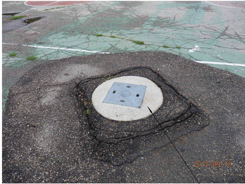
PHOTO "6": EXISTING CONCRETE FOOTING TO BE REMOVED TO MINIMUM 600 MM BELOW NEW GRADE ELEVATION