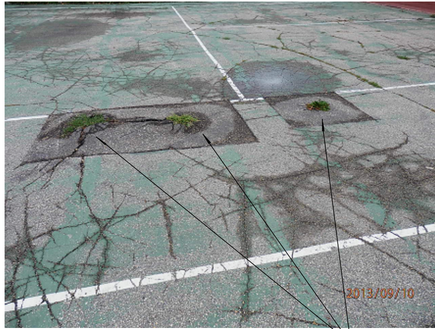
PHOTO "7": EXISTING CONCRETE FOOTINGS TO BE REMOVED TO MINIMUM 600 MM BELOW NEW GRADE ELEVATIONS