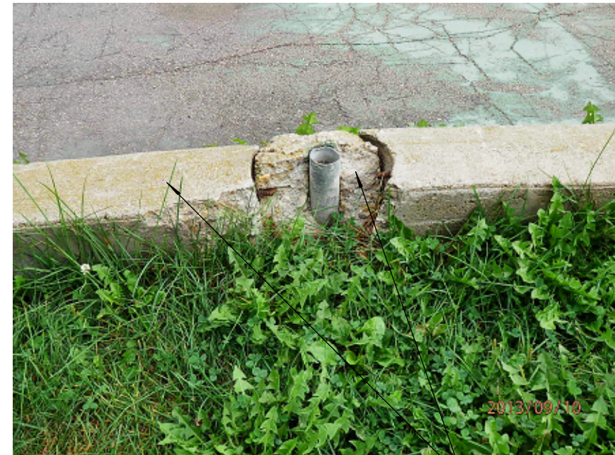
PHOTO "10": EXISTING CONCRETE EDGE TO BE REMOVED INCLUDING ALL OLD CHAIN LINK FENCE CONCRETE FOOTINGS.

PROJECT TITLE MAGNUS ELIASON RECREATION CENTRE BASKETBALL COURT IMPROVEMENT