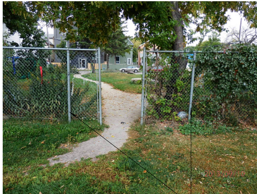
PHOTO "9": EXISTING CHAIN LINK FENCE OPENING TO BE WIDENED TO ADJACENT POSTS.