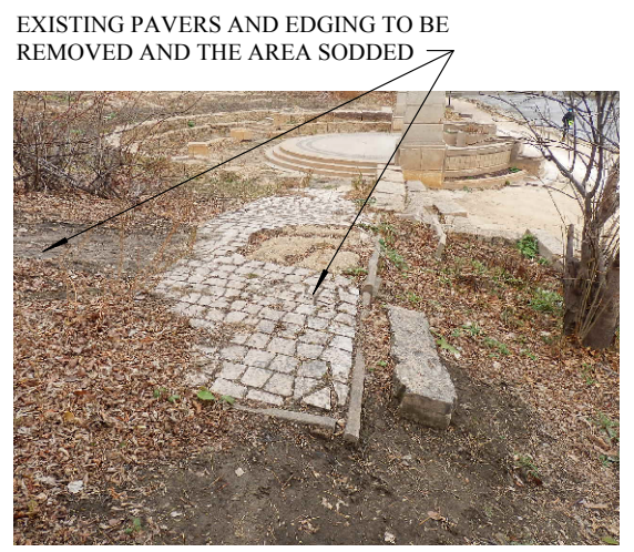
3 EXISTING PHOTO L7 Scale: 1:200