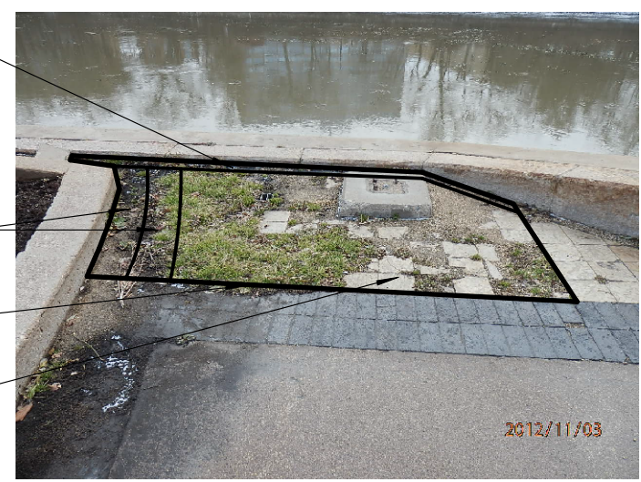
3 EXISTING PHOTO - LOOKING SOUTH L6 Scale: 1:200

ONE ROW OF MAGANESE IRONSPOT PAVERS - ALONG OUTSIDE EDGE TWO ROWS OF MAGANESE IRONSPOT PAVERS - THIS EDGE HEAVY BLACK LINE INDICATES LIMIT OF WORK AREA INSTALL 90 x 190 LIMESTONE PAVERS IN CENTRE AREA TO GRID PATTERN TO MATCH EXISTING