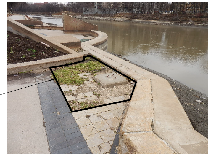
4 EXISTING PHOTO - LOOKING EAST L6 Scale: 1:200

HEAVY BLACK LINE INDICATES LIMIT OF WORK AREA