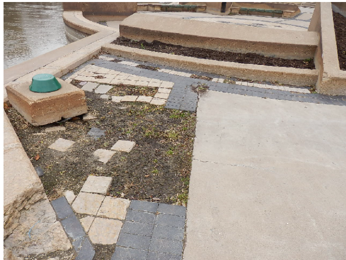
3 EXISTING PHOTO - LOOKING WEST L5 Scale: 1:200