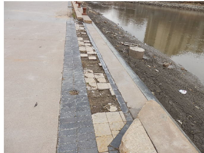
4 EXISTING PHOTO - LOOKING EAST L5 Scale: 1:200