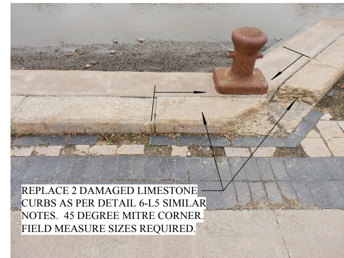
5 EXISTING PHOTO - DAMAGED CURBS L5 Scale: 1:200