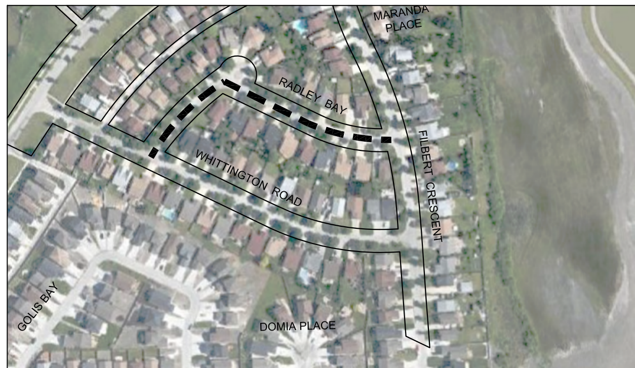
RADLEY BAY - WHITTINGTON ROAD / FILBERT CRESCENT