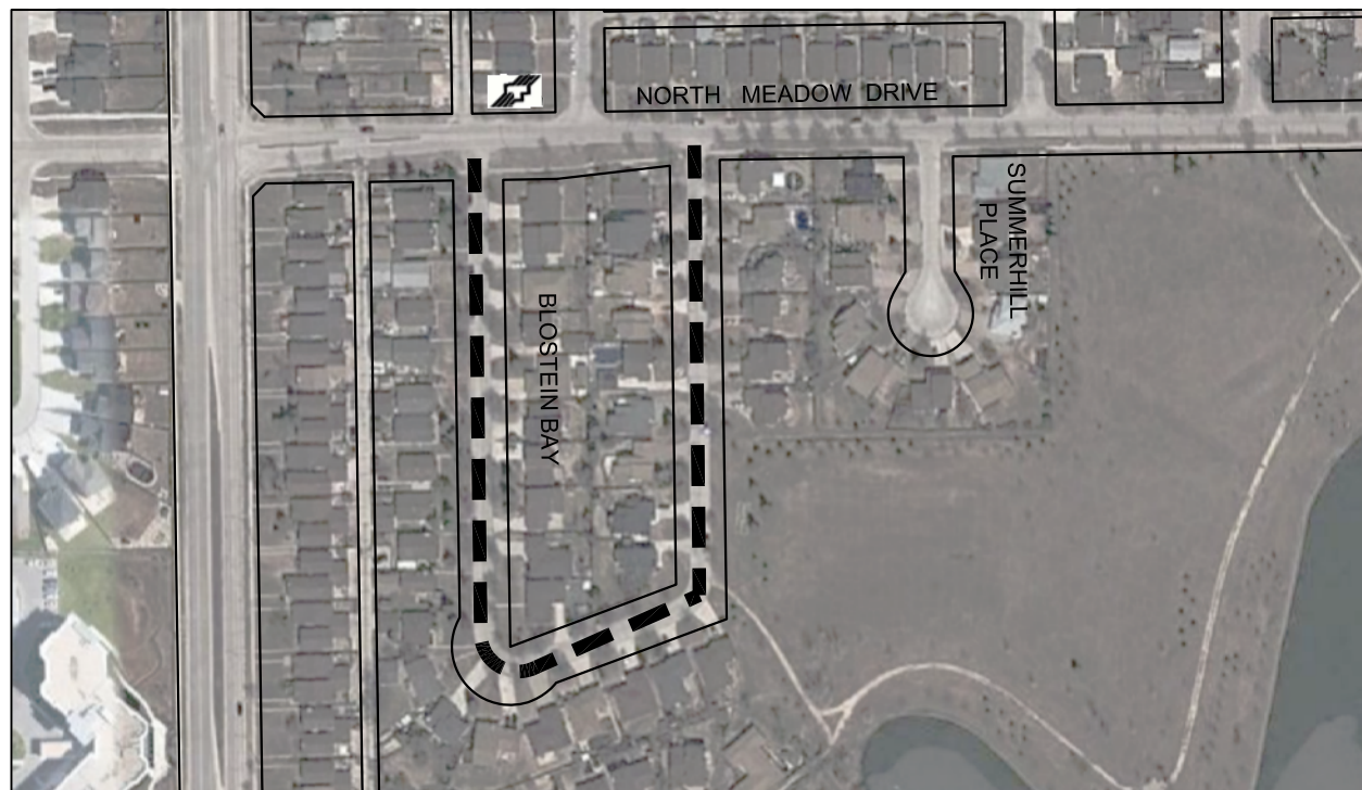
BLOSTEIN BAY - NORTH MEADOW DRIVE / NORTH MEADOW DRIVE

Jun 27, 2013 - 2:45pm P:\5513001-5513099\5513066 - 2013 Thin Bituminous Overlay Program\MMM Drawings\Contract 1\dwgs 331-2013.1-01 to 05 140613.dwg - tab:03