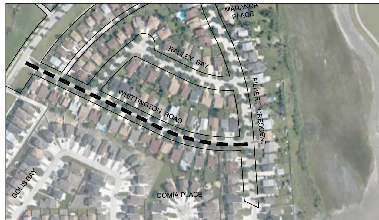
WHITTINGTON ROAD - CONCORDIA AVENUE / FILBERT CRESCENT