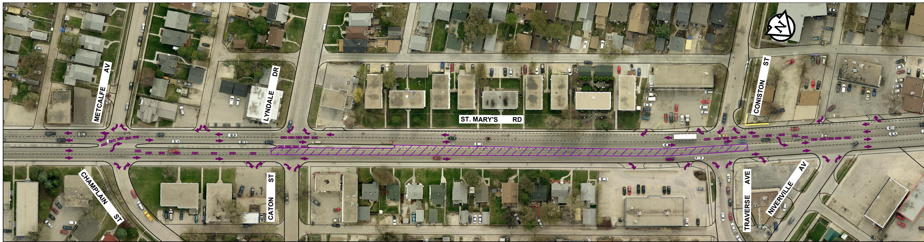
ST.MARY'S NORTHBOUND MEDIAN CONSTRUCTION - AM