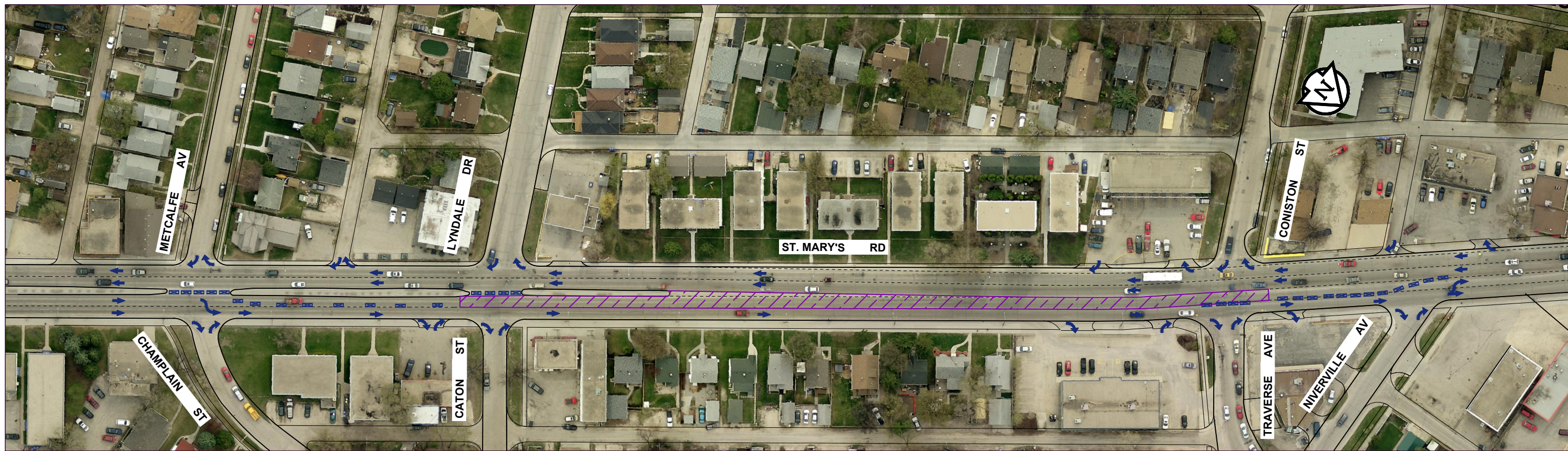
ST.MARY'S NORTHBOUND MEDIAN CONSTRUCTION - PM