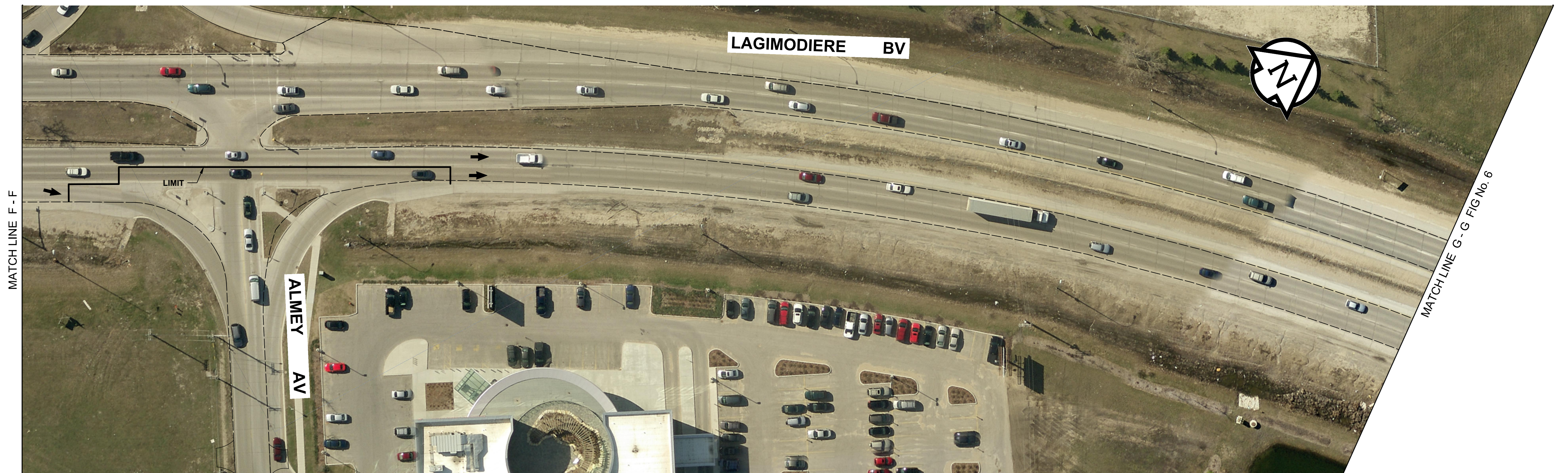
MILL AND FILL - NORTHBOUND LANES

METRIC WHOLE NUMBERS INDICATE MILLIMETRES DECIMALIZED NUMBERS INDICATE METRES