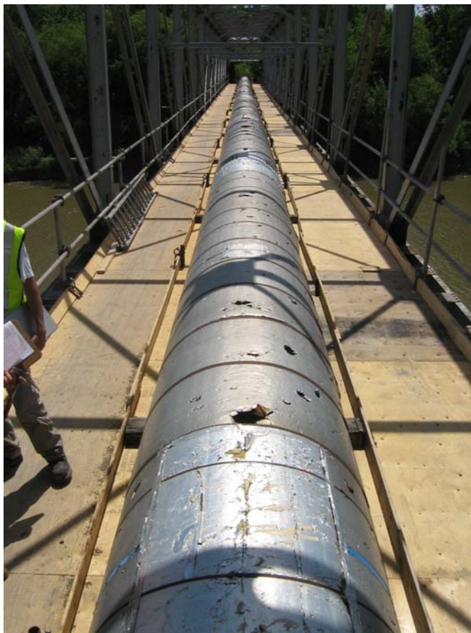
A3-10 - Existing Pipeline and Insulation on Bridge.jpg