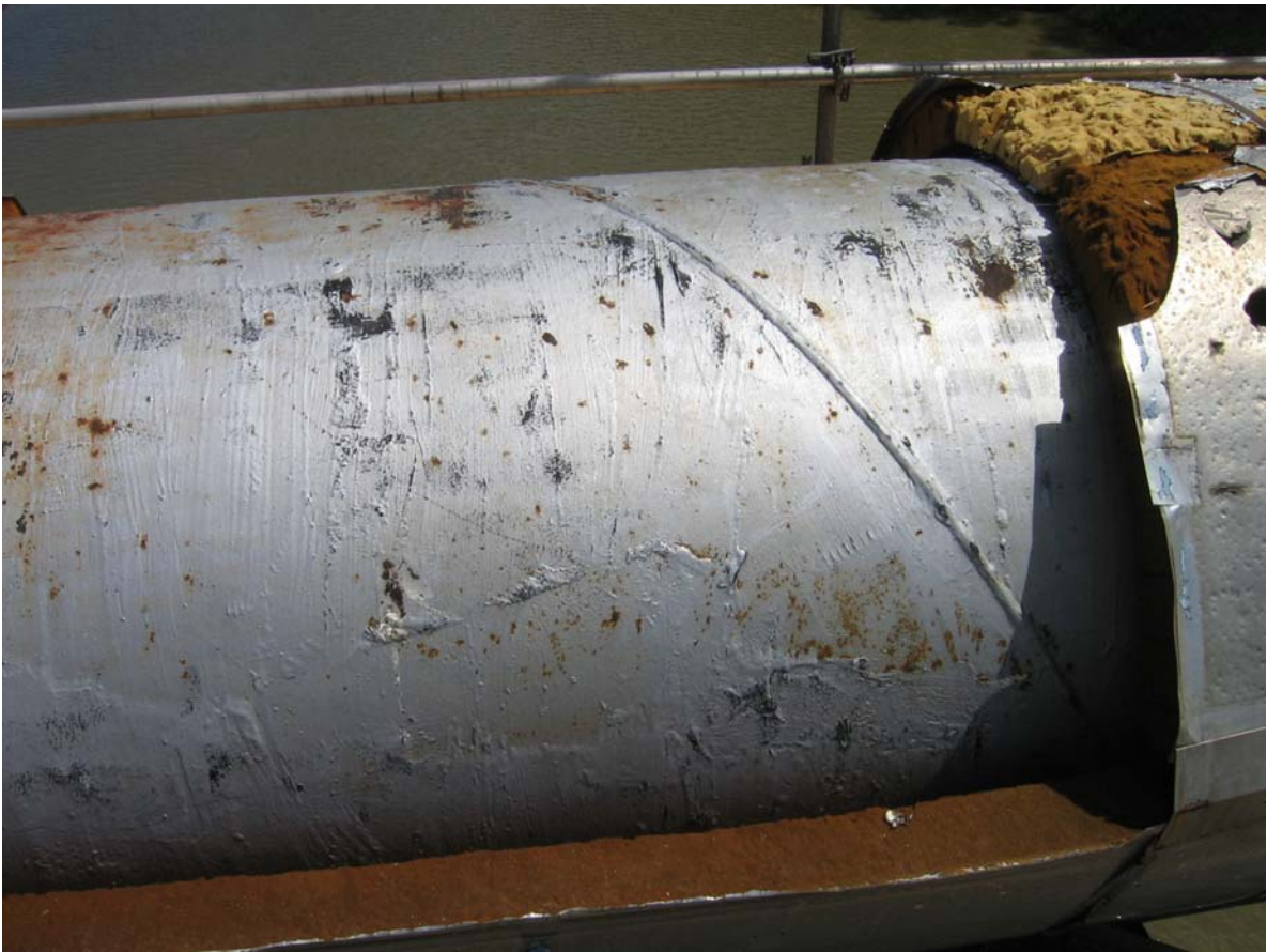
A3-12 - Existing Pipe Coating.jpg