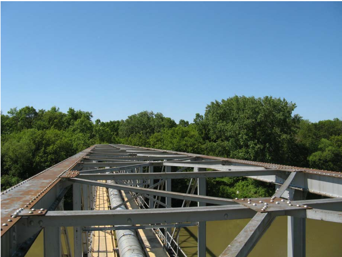
A3-08 - Top of Bridge.JPG