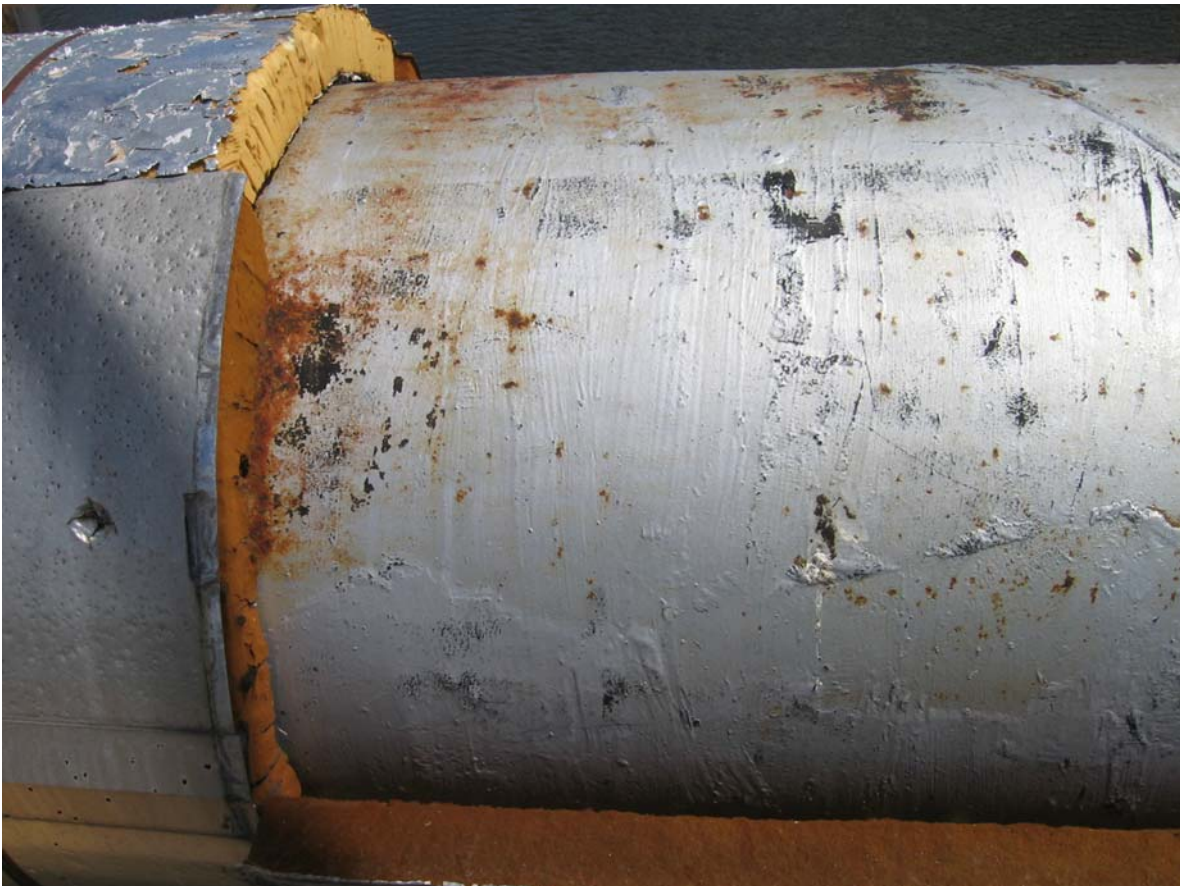
A3-11 - Existing Pipe Coatings, Insulation and Cladding.jpg