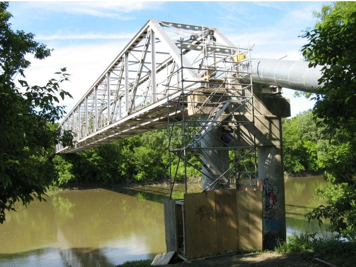
A3-01 - East Elevation form NE .JPG