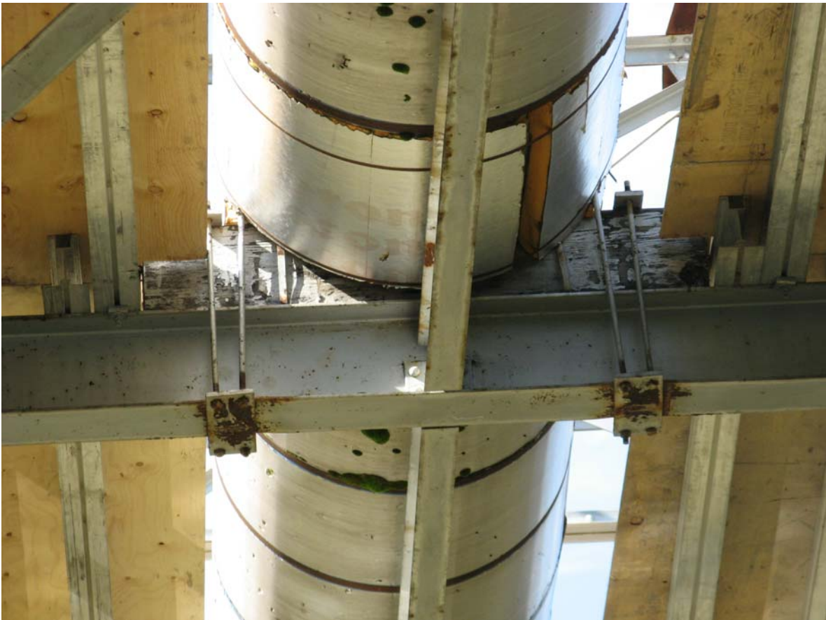
A3-03 - Closeup of Typ Floor Beam and Pipe Cradle (with temp walkways in place).JPG