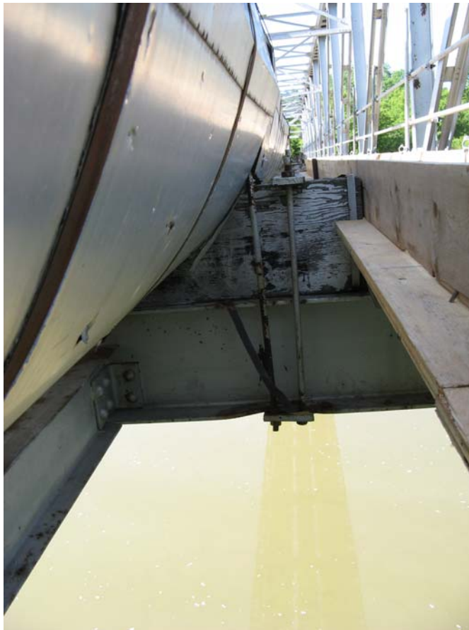
A3-04 - Member i-l West Half Bottom Flange Deformed at Holddown for Pipe.JPG