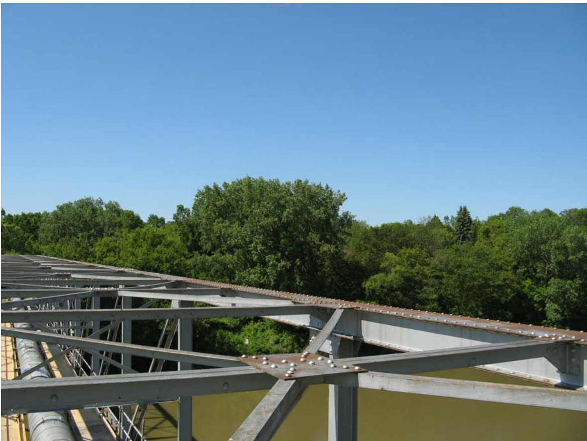
A3-07 - Top of Bridge West half.JPG