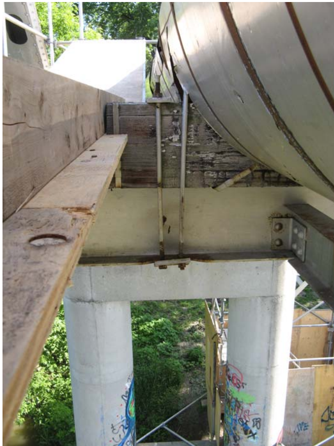
A3-05- Member i=l West Half Bottom Flange Deformed at Pipe Holddown.JPG