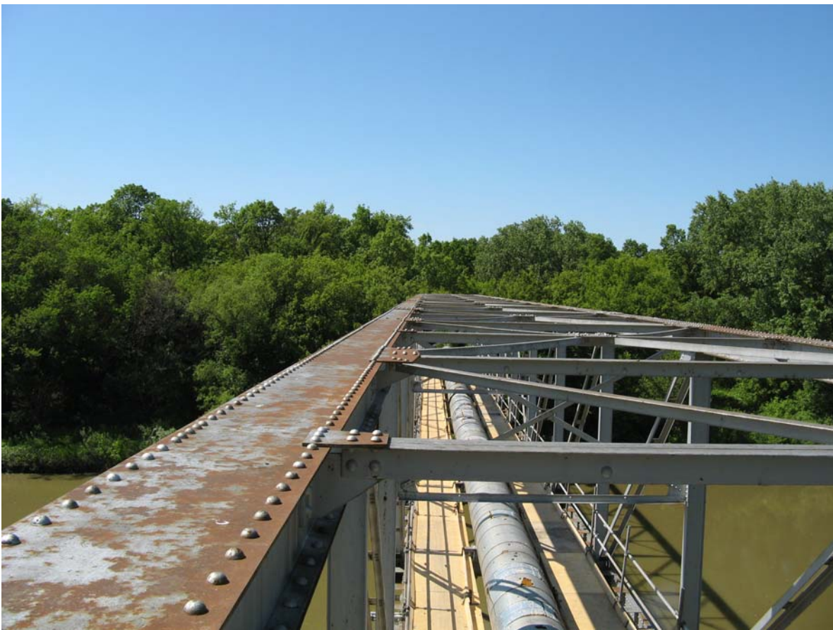
A3-06 - Top of Bridge East Half.JPG