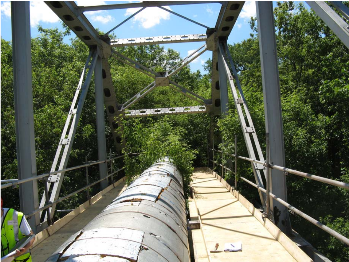
A3-09 - Pipe Insulation and Cladding-South End.JPG