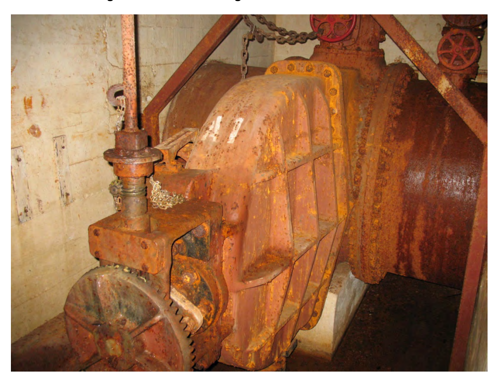
Figure 10 - DAV1 - Existing Valve