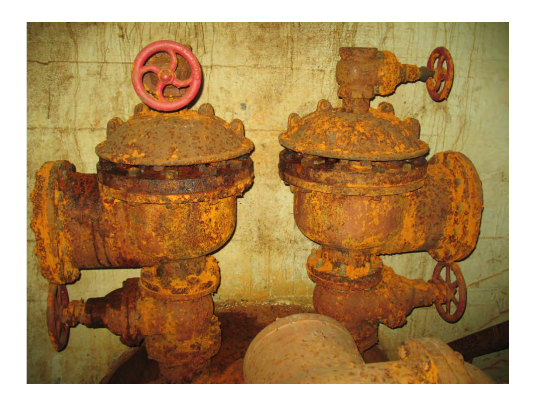
Figure 11 - DAV1 - Existing Air Release Valve Assemblies