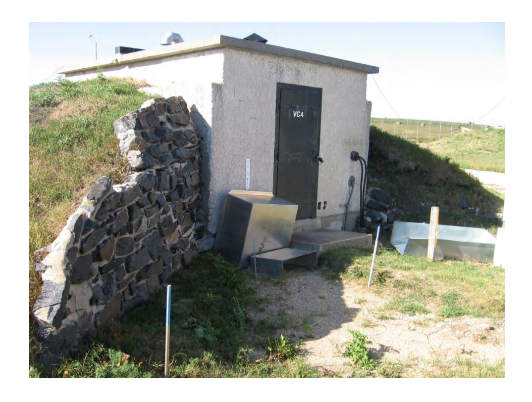
Figure 1 – VC4 - Exterior and Existing Stone Retaining Wall