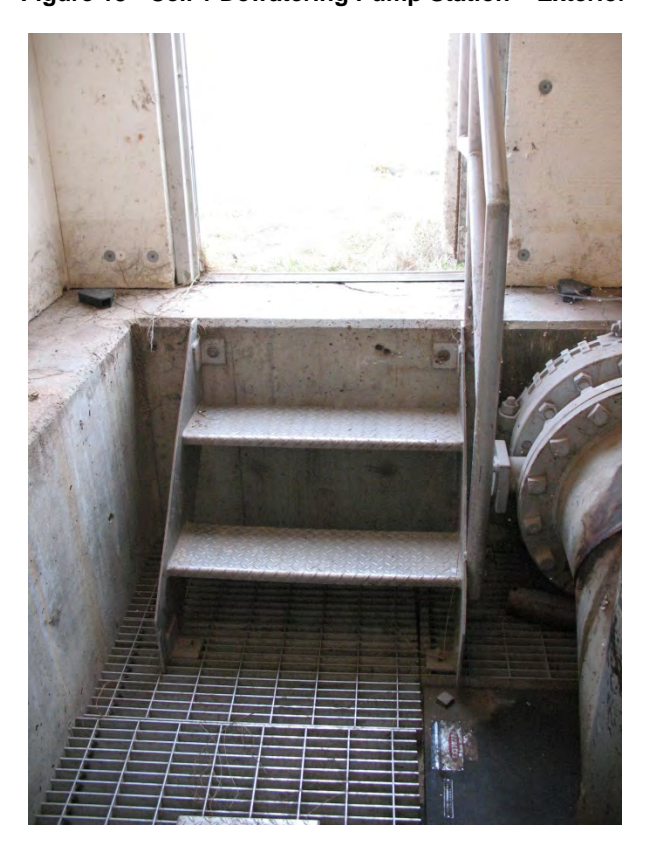
Figure 14 - Cell 1 Dewatering Pump Station – Existing Stairs