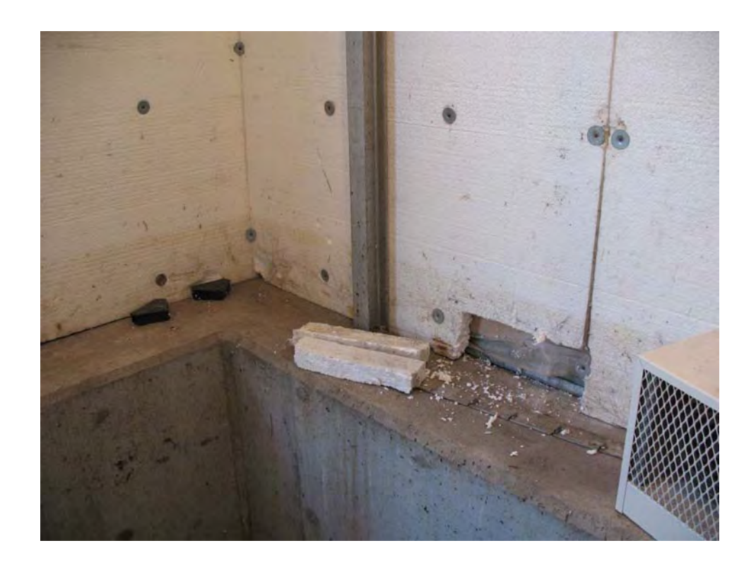
Figure 17 - Cell 1 Dewatering Pump Station - Existing Wall and Insulation