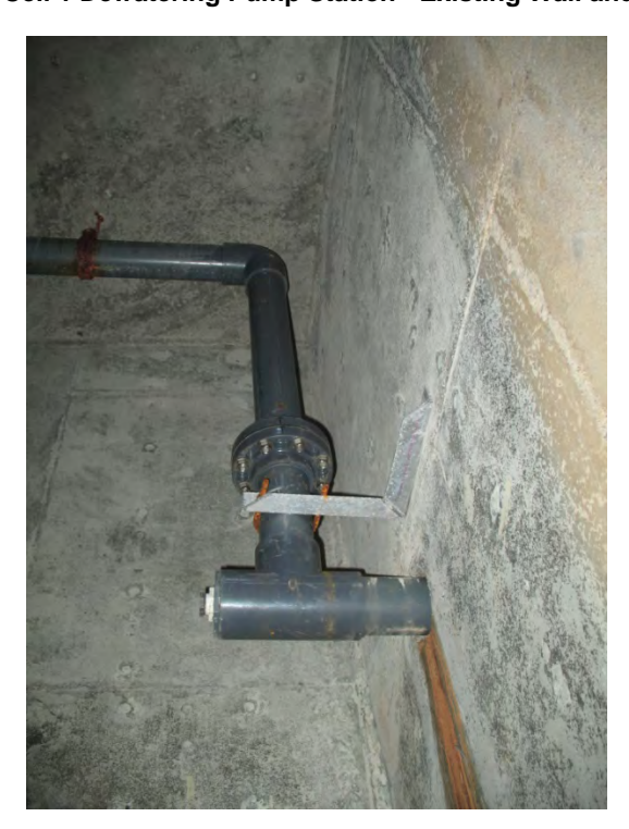
Figure 18 - Chlorine Contact Chamber - Existing PVC Injector Piping at Wall