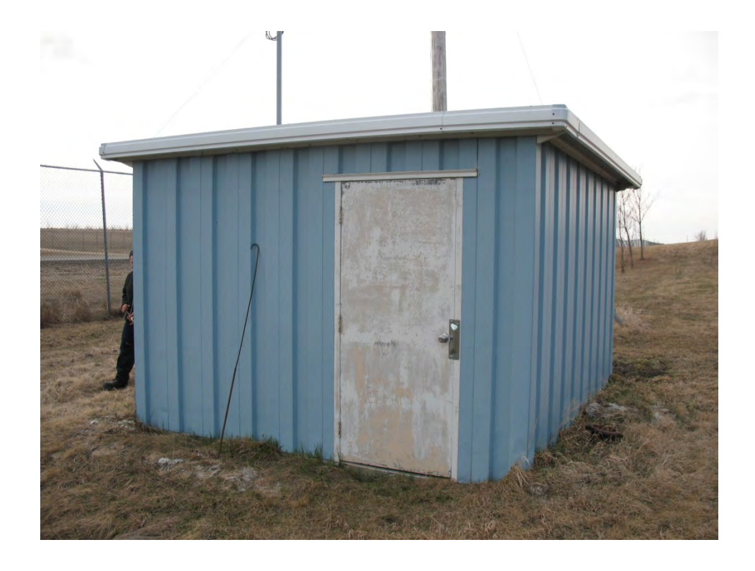
Figure 13 - Cell 1 Dewatering Pump Station – Exterior