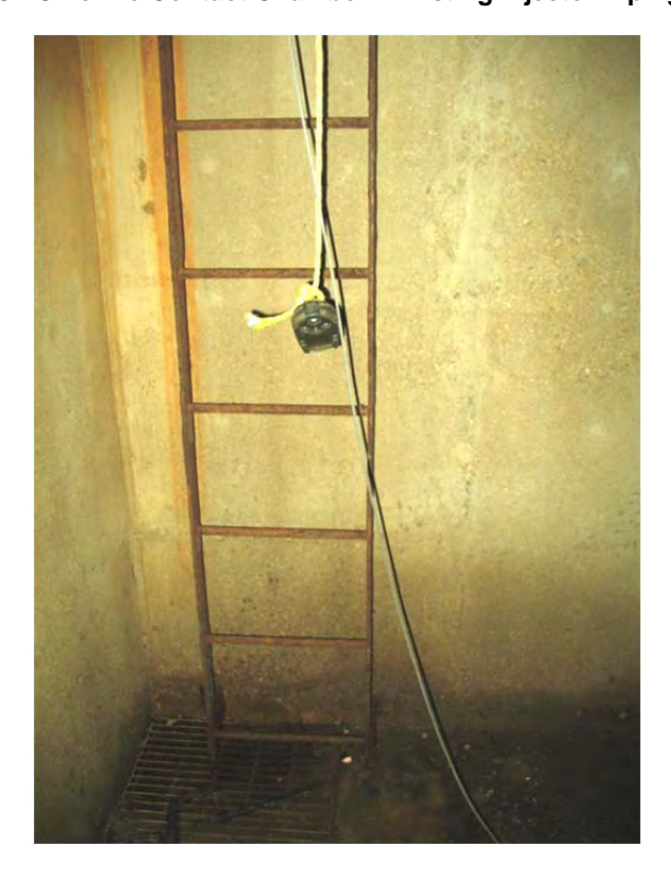
Figure 20 - Chlorine Contact Chamber - Existing Access Ladder and Sump