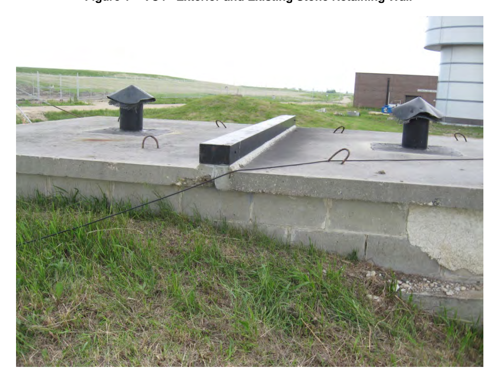
Figure 2 - VC4 - Existing Roof Slabs