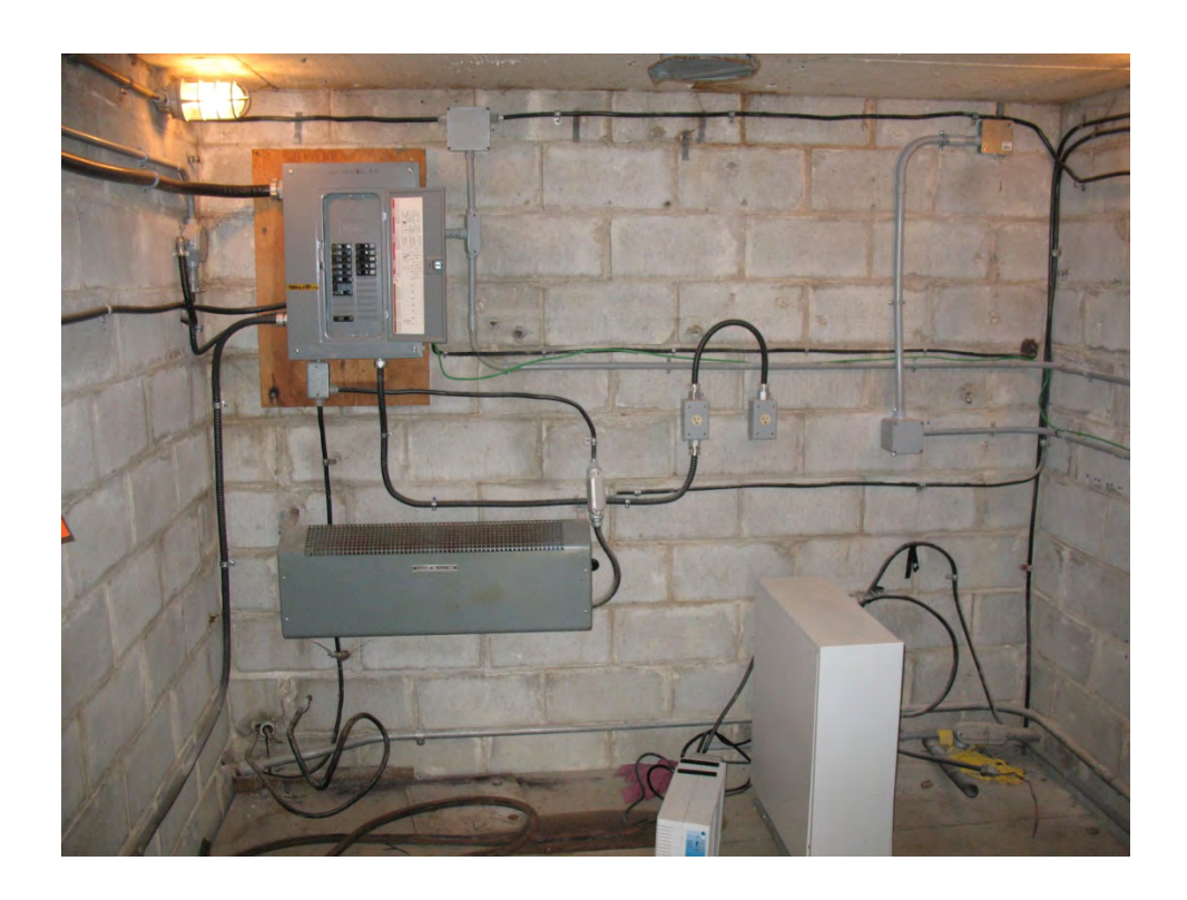
Figure 3 - VC4 - Existing Electrical Controls