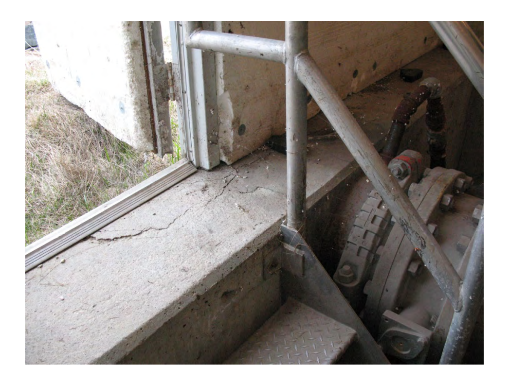
Figure 15 - Cell 1 Dewatering Pump Station - Existing Concrete Wall