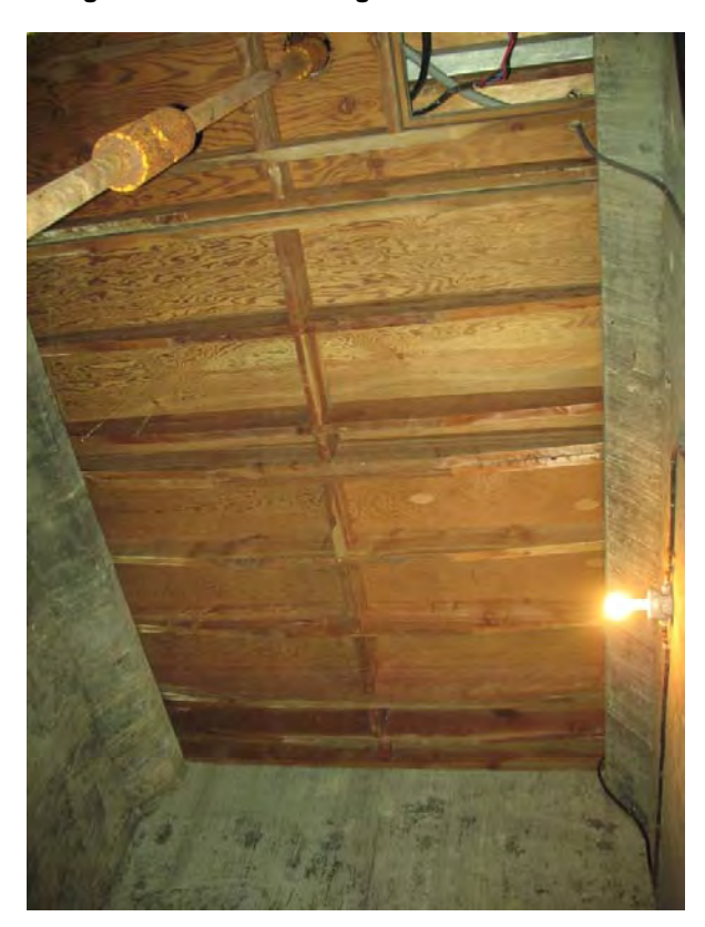
Figure 6 - VC4 - Bottom of Existing Wood Floor