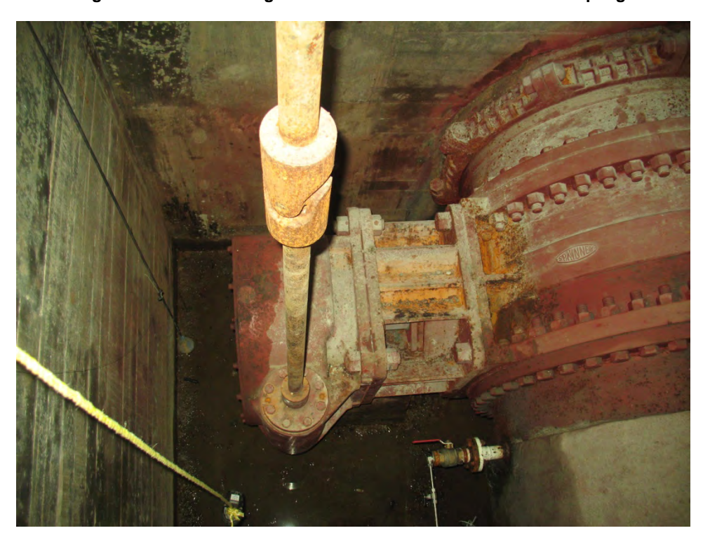
Figure 8 - VC4 - Existing Actuator