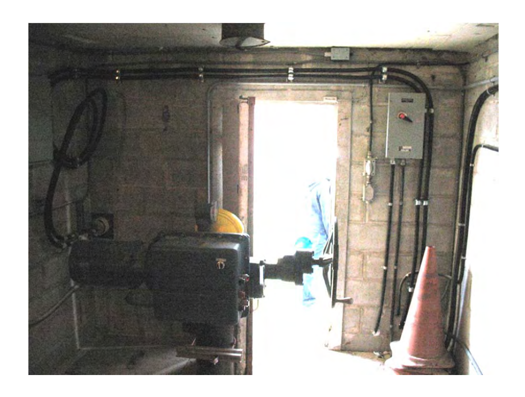
Figure 5 - VC4 - Existing Valve Actuator Motor