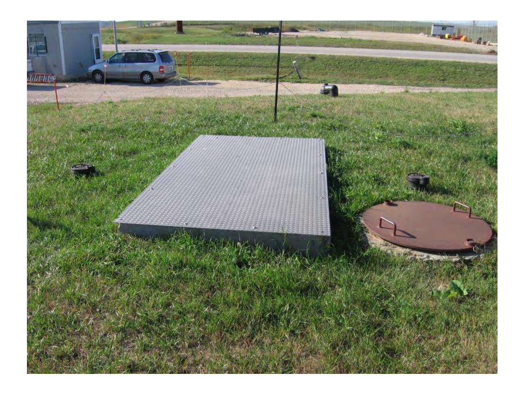
Figure 9 - DAV1 - Existing Cover and Access Manhole