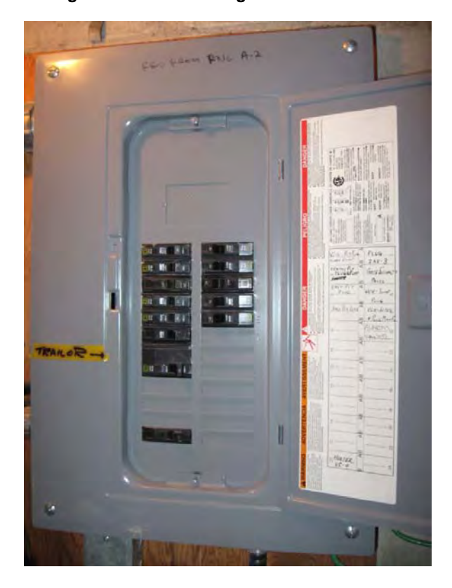
Figure 4 - VC4 - Existing Electrical Panel