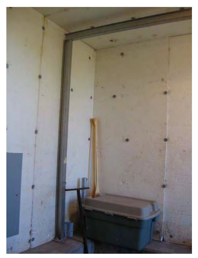
Figure 16 - Cell 1 Dewatering Pump Station - Lifting Frame and Insulation