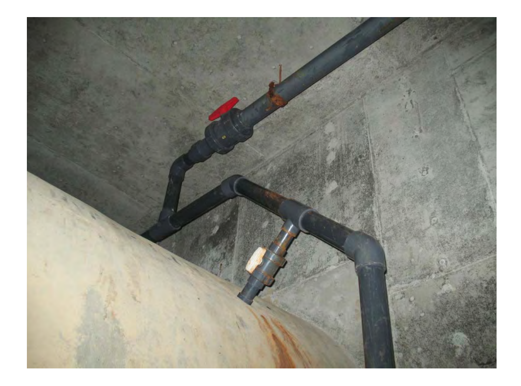
Figure 19 - Chlorine Contact Chamber - Existing Injector Piping at Pipe