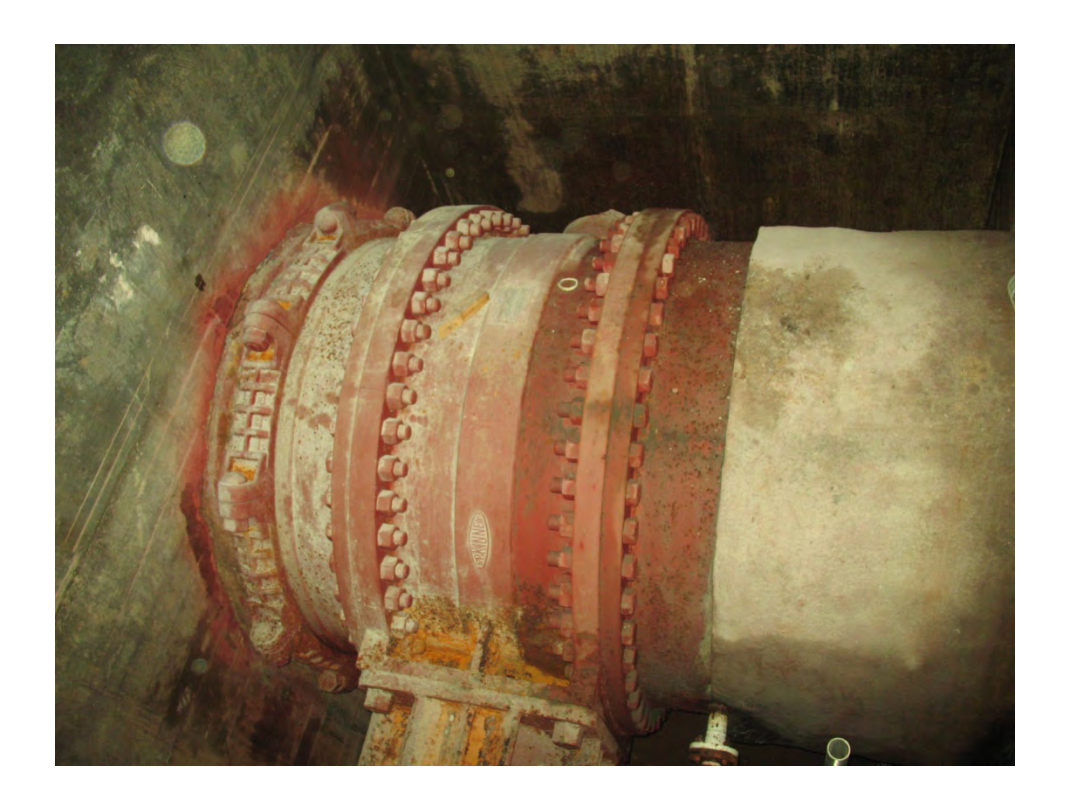
Figure 7 – VC4 - Existing 1500 mm Motorized Valve and Vic Coupling