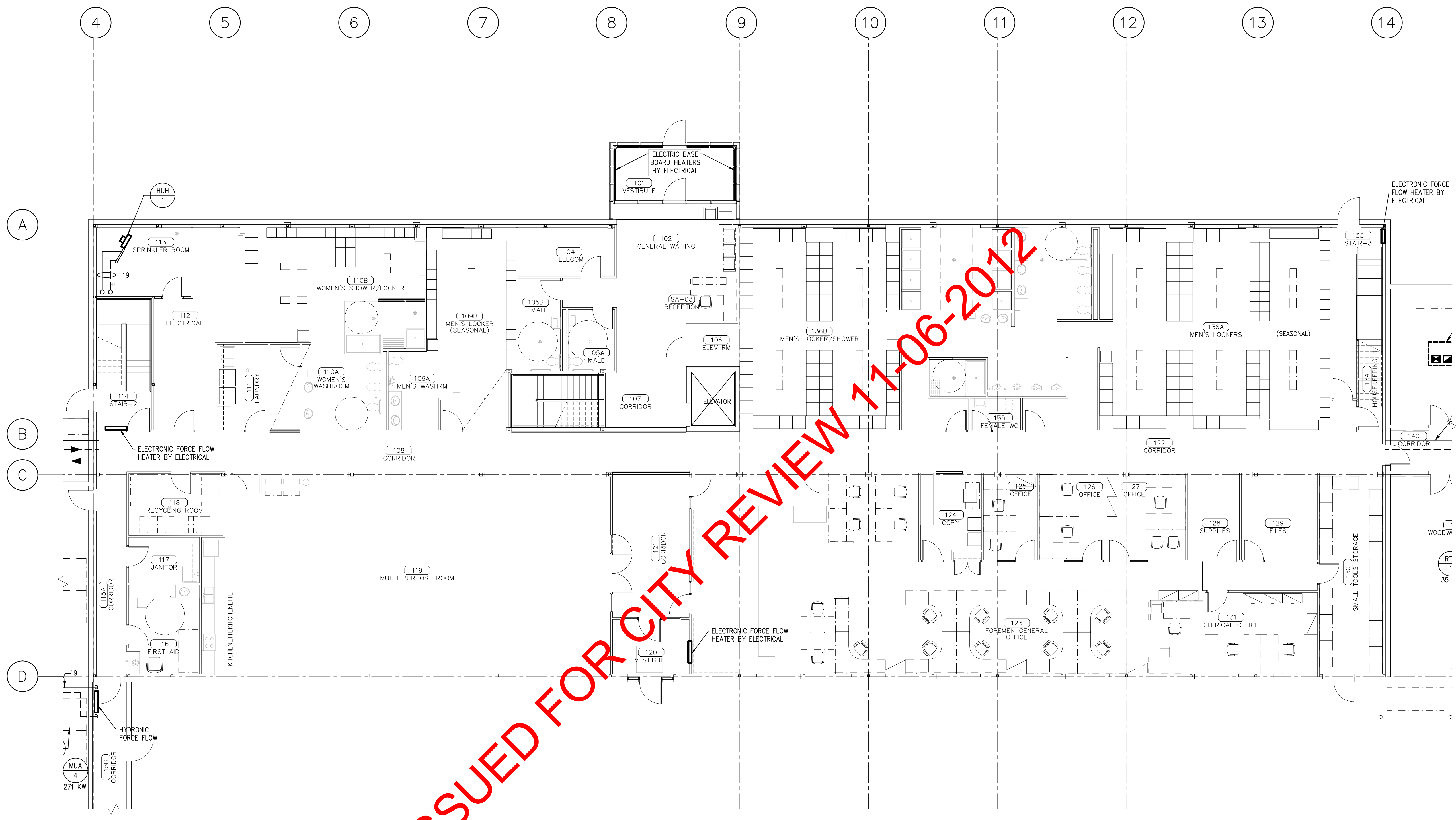
MAIN FLOOR PLAN - HEATING SCALE 1:100