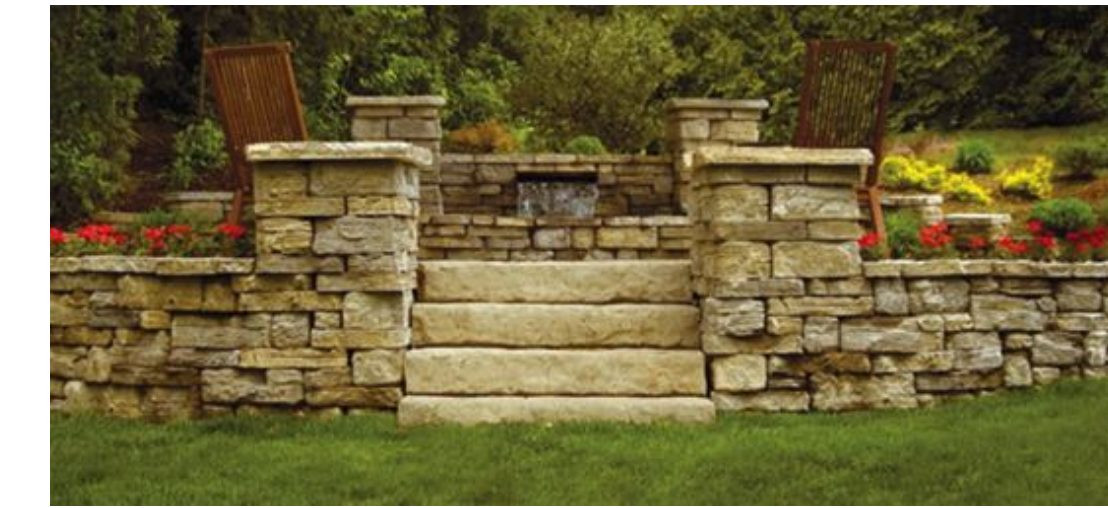
BELVEDERE PILLARS, WALLS AND STEPS

4 - 430 River Avenue Winnipeg, Manitoba, R3L 0C6 (204) 452-2426 LANDSCAPE ARCHITECTURE • URBAN DESIGN • GOLF COURSE ARCHITECTURE