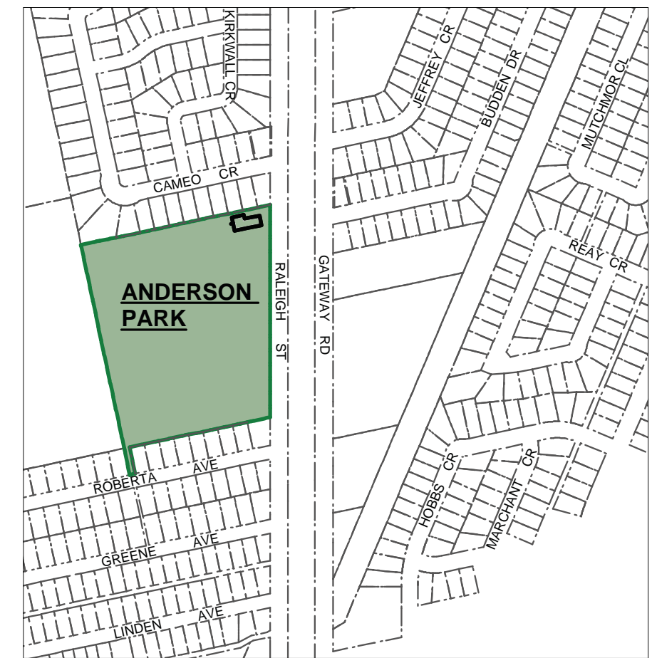
LOCATION PLAN NTS

CONTRACTOR TO CONFIRM ALL DIMENSIONS AND REPORT ANY DISCREPANCIES TO CONTRACT ADMINISTRATOR PRIOR TO CONSTRUCTION. LOCATION OF UNDERGROUND STRUCTURES AS SHOWN ARE BASED ON THE BEST INFORMATION AVAILABLE BUT NO GUARANTEE IS GIVEN THAT ALL EXISTING UTILITIES ARE SHOWN OR THAT THE GIVEN LOCATIONS ARE EXACT. CONFIRMATION OF EXISTENCE AND EXACT LOCATION OF ALL SERVICES MUST BE OBTAINED FROM THE INDIVIDUAL UTILITIES BEFORE PROCEEDING WITH CONSTRUCTION.